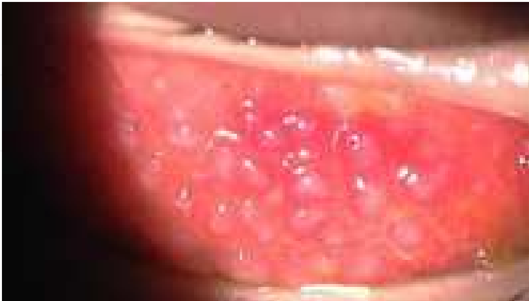
Fig. 3. Allergic conjunctivitis (Look for follicles and papillae)

Allergic conjunctivitis comprises a group of diseases affecting the ocular surface and is usually associated with type 1 hypersensitivity reactions. Two acute disorders, seasonal allergic conjunctivitis and perennial allergic conjunctivitis, exist, as do 3 chronic diseases, vernal keratoconjunctivitis, atopic keratoconjunctivitis, and giant papillary conjunctivitis.