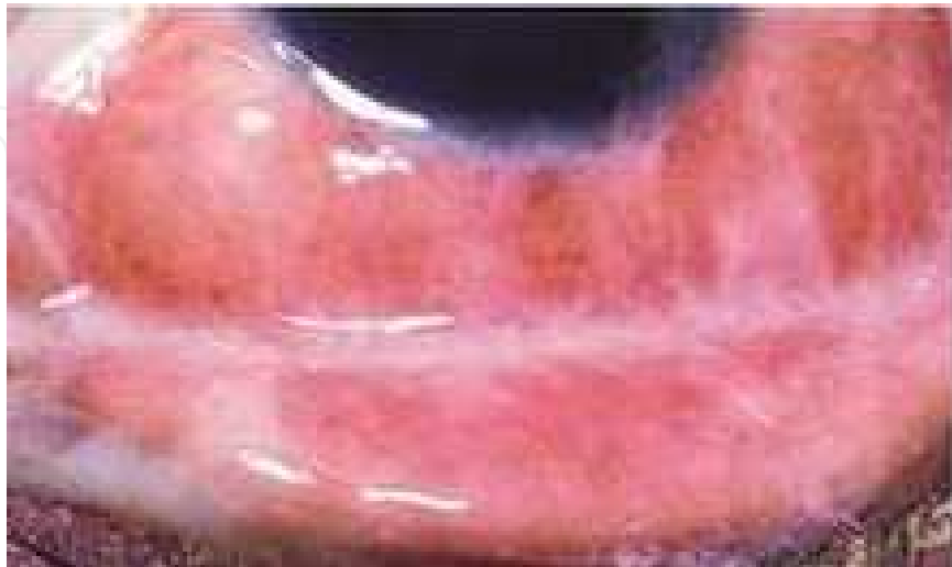
Fig. 1. Bacterial conjunctivitis (Look for the mucous discharge)

soaked with warm water, and to explain the same procedure to the patients, so they can do in home before applying medications. Generally most of the bacterial conjunctivitis cases are treated as outpatient cases but whenever any corneal involvement is suspected it would be ideal to treat the patient as an inpatient.