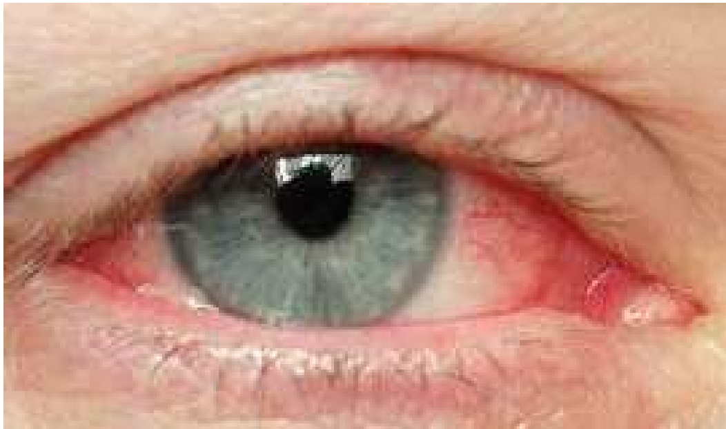
Fig. 2. Viral conjunctivitis (Look for pink eye without any discharge)

Herpes infection of the eye may be acquired as the patient's first exposure to the virus (primary infection) or as involvement of a new anatomical site (the eye) in a patient with previous HSV infection. In either case, patients with herpetic eye infection risk recurrent eye disease throughout their lives. The infective lesions of the corneal epithelium (dendritic and geographic ulcers) occasionally develop into non-infective indolent or trophic ulcers, particularly under the influence of cauterizing chemicals or corticosteroids. Inflammation of the corneal stroma may accompany herpetic epithelial lesions or occur independently. Stromal keratitis probably represents the host's immune response to viral antigens filtering down from epithelial lesions or from viral replication in stromal cells.