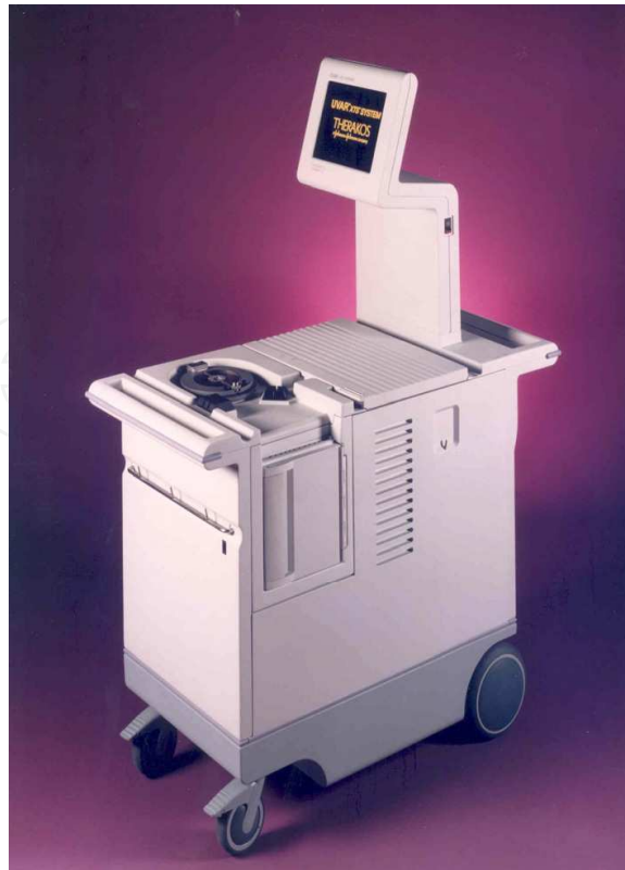
Fig. 1. THERAKOS™ XTST™ Photopheresis instrument