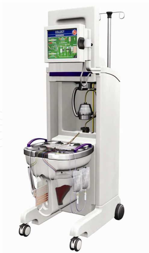
Fig. 2. THERAKOS™ CELLEX™ Photopheresis Instrument