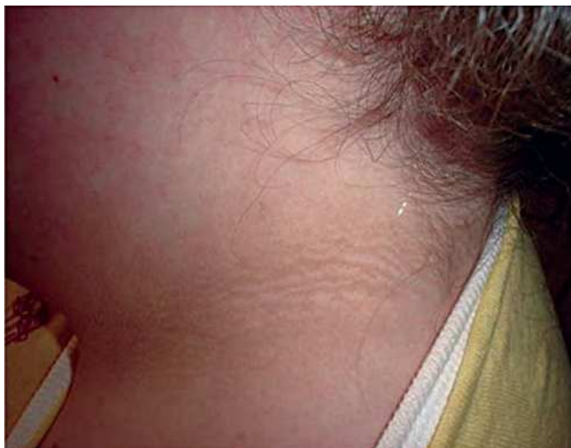
Fig. 2. Acanthosis nigricans of the neck folds in a patient with Albright Hereditary Osteodystrophy (Nwosu, 2009)

A patient with Albright hereditary osteodystrophy-like syndrome with a normal GNAS gene that was complicated by type 2 diabetes mellitus with severe insulin resistance, growth-hormone deficiency and diabetes insipidus has been described (Sakaguchi, 1998). Long et al. (Long, 2007) reported that obesity is a more prominent feature of PHP 1a than of PPHP, and that severe obesity is characteristic of PHP 1a. They postulated that paternal imprinting of G_s\alpha occurs in the hypothalamus such that maternal, but not paternal, G_s\alpha mutations lead to loss of the melanocortin signaling cascade, which is important for signaling satiety. This loss of satiety signaling then leads to greater alteration in energy balance and notably greater insulin resistance in individuals with PHP 1a (as shown in Figure 2) than in those with PPHP.