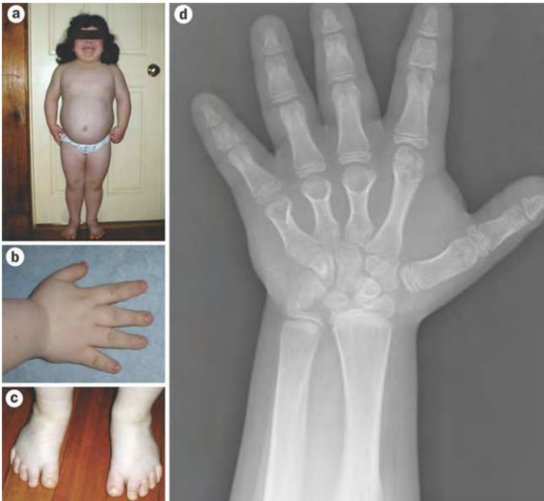
Fig. 1. a, b, c, d. Features suggestive of Albright hereditary osteodystrophy(Nwosu, 2009) Figure 1 | Features suggestive of Albright hereditary osteodystrophy in the patient. a | Photo of a patient at 5 years of age showing an obese phenotype, round face, broad chest, short neck and digits consistent with pseudohypoparathyroidism type 1a. b | Photo of the patient's hand at 5 years of age showing brachyphalangism of the fingers, especially the third through fifth digits. c | Photo of the patient's feet at 5 years of age showing brachyphalangism of the toes. d | Bone age radiograph of the patient at 7 years of age showing premature fusion of the epiphyses of the distal phalanges of the thumb, midphalanges of both the second and fifth fingers, and shortening of the third through fifth metacarpals. Her bone age was read as 13 years at a chronological age of 7 years and 8 months.

metacarpals(Poznanski, 1977; Steinbach, 1965). Shortening of the metatarsals (Figure 1c), especially the third and fourth, is seen in about 70% of persons with AHO(Steinbach, 1966).