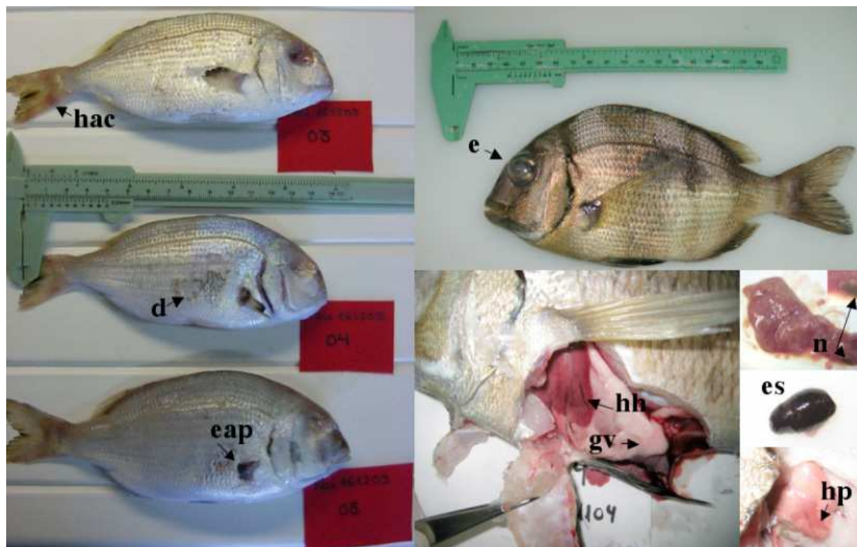
Fig. 1. Main external symptoms and pathological signs in the internal organs observed in affected fish. (hac) haemorrhages in caudal fin; (d) skin desquamation; (eap) fin erosion; (e) exophthalmia; (hh) haemorrhagic liver; (gv) visceral fat accumulation; (n) necrosis; (es) splenomegaly; (hp) petechiae.