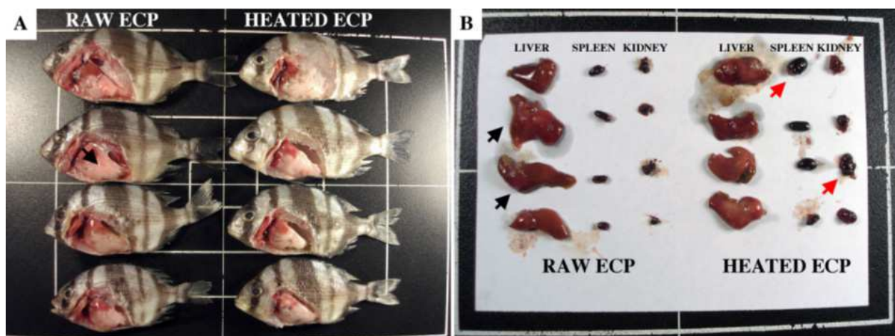
Fig. 2. Effect of the P. damsela subsp. damsela ECPs (raw and thermally treated at 100°C for 10 min) on redbanded seabream ( P. auriga ) (10 g weight). (A) Arrows indicate the presence of visceral haemorrhages. (B) Black arrows indicate signs of hepatomegaly, and red arrows show the inflammation of haematopoietic organs (spleen and head kidney).

P. damsela subsp. damsela ECPs displayed cytotoxic activity for different fish and mammalian cell lines (Wang et al., 1998; Labella et al., 2010). The cytotoxicity was limited to ECPs from virulent strains, and it was totally lost on heated ECP samples, which suggests the presence of thermolabile cytotoxic components in the raw ECPs (Labella et al., 2010).