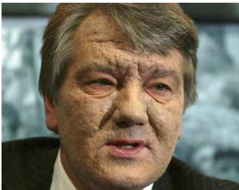
Fig. 15. Chloracne

The question therefore arises if the dioxin pollution was a contributory factor to the infections experienced by the inhabitants of St Kilda. Comparison with the major known leak of the dioxin, TCDD (2,3,7,8-Tetrachlorodibenzo-p-Dioxin) from Seveso near Milan in 1976, suggests this is unlikely. The soil levels of dioxin in Italy were considerably higher, yet careful follow up over many years in Seveso found no acute increase in the incidence of acute infections, but there was an increase in carcinomas of the gastrointestinal tract and lymphatic systems and an increase in the death rate from respiratory disease. Dioxins are believed to be carcinogenic, but cancers were not a common problem on St Kilda.