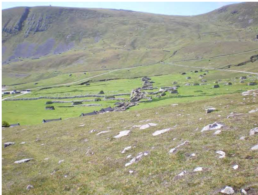
Fig. 3. Picture of St Kilda