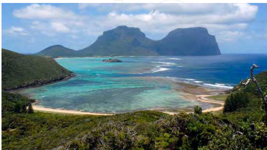
Fig. 17. Picture of LHI