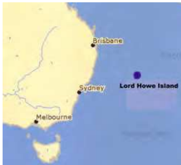
Fig. 16. Map of LHI

Lord Howe Island is situated in the Tasman Sea between Australia and New Zealand, 600 kms from the Australian west coast. Lord Howe Island has no detectable trace of human habitation prior to 1788 in spite of the extensive exploratory maritime voyages of the Polynesian people. Its first known sighting was by the HMS Supply captain Lieutenant Henry Lidgbird Ball and his crew on 17 February 1788 while sailing to Norfolk Island. They subsequently landed there on 13 March 1788 during the return journey to Sydney and named the island after Richard Howe, the First Lord of the Admiralty.