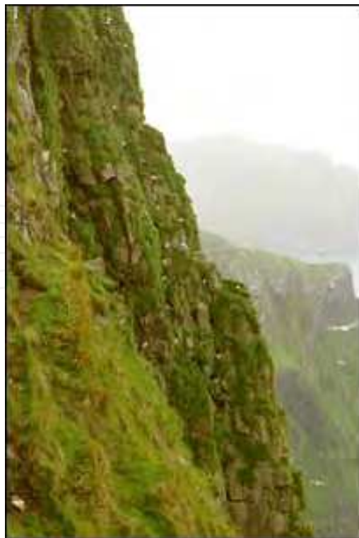
Fig. 11. St Kilda cliffs, a food source