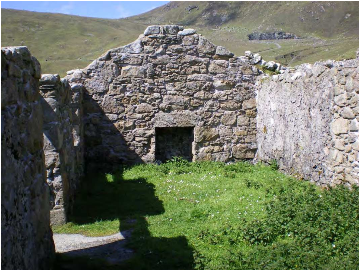
Fig. 9. Deserted house