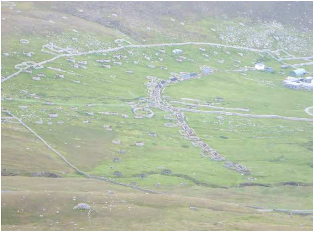
Fig. 10. Cultivated land

silverweed roots, dock, sorrel, scurvy-grass, rhubarb, turnips and cabbages. Peas and beans flowered without produce. Fruits were clearly a rarity.