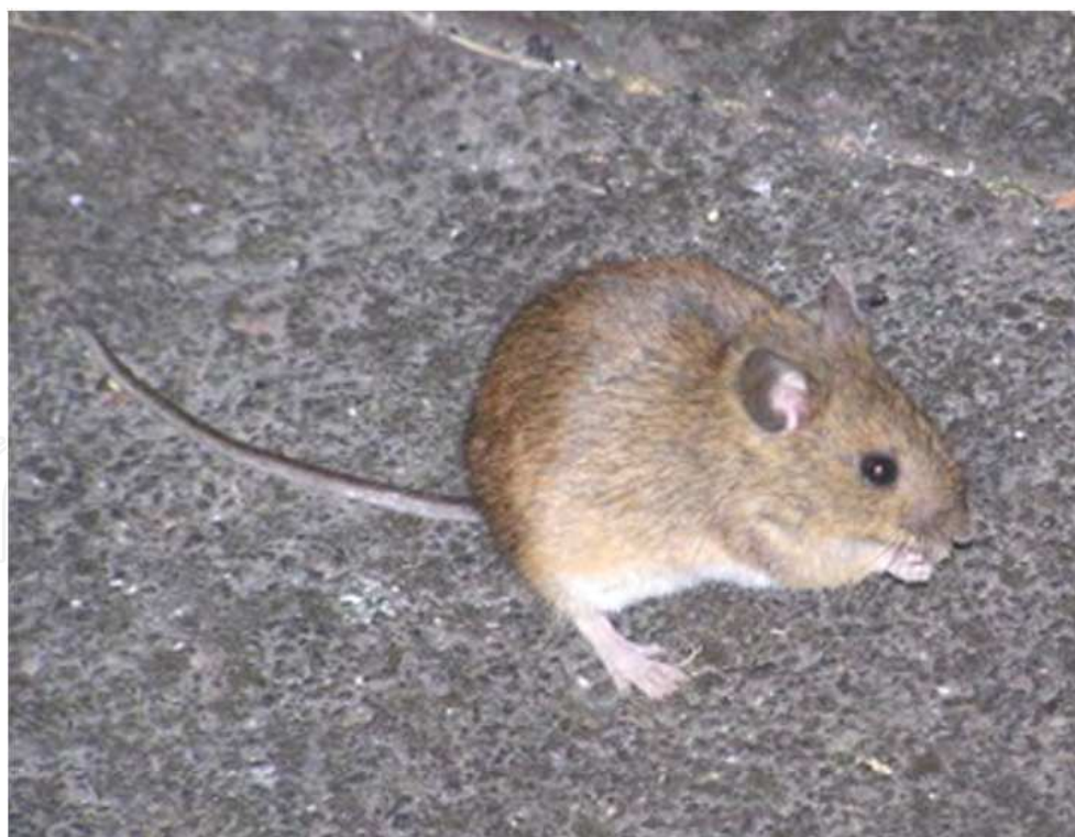
Fig. 8. St Kilda mouse

St Kilda partially escaped the intense glaciations of the Great Ice Age, hence pre-glacial plants are found in its peaty soil. Two hundred varieties of lichen and a hundred and thirty different flowering plants have been discovered on the island. Some of these are extremely rare or ancient, such that a study of these plants helps to explain the distribution and origin of plants in the United Kingdom.