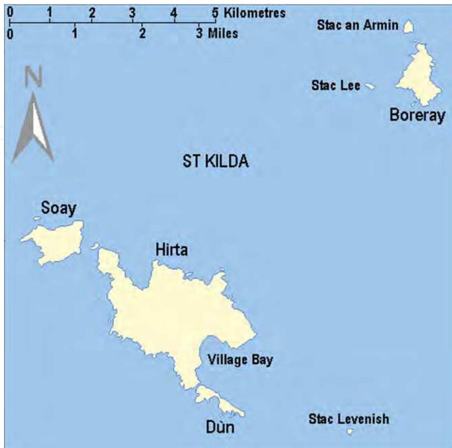
Fig. 2. Map of St Kilda