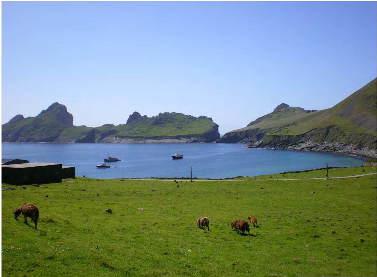
Fig. 5. Village bay

The presence of three early chapels and two incised stone crosses of early Christian style were recorded by the Rev. Kenneth Macaulay. 4,5 The continued use of Norse place names, such as Oiseval – the east hill – and Ruaival – the red hill, and archaeological finds of Norse brooches and steatite, are strong evidence of continual occupation by the Norsemen and their descendents until the 20 th century. However, prior to the steamship era, the inclement climate and the small exposed rocky harbour restricted access by visiting sailing vessels.