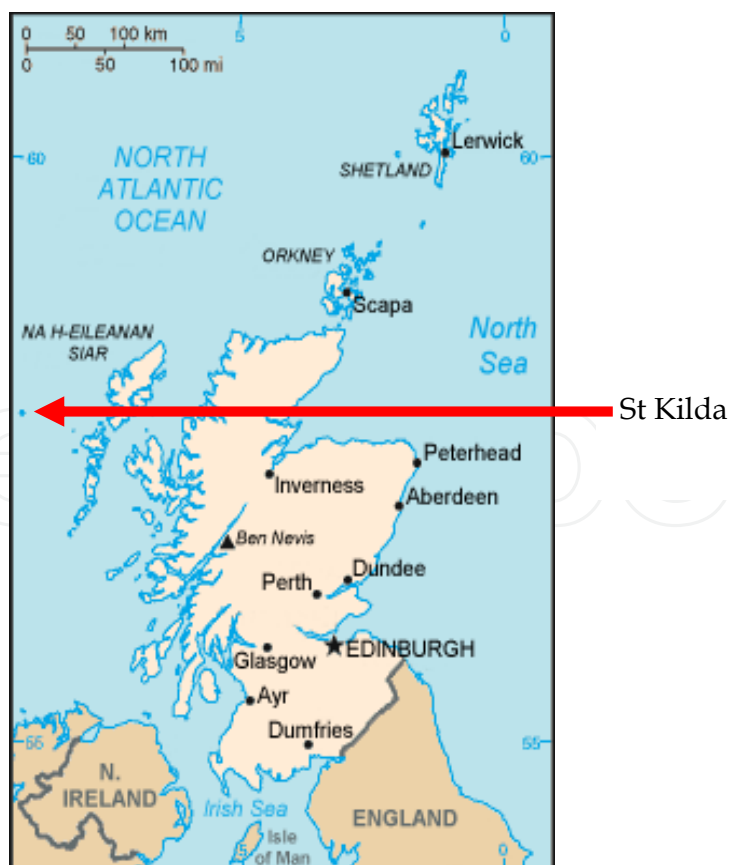
Fig. 1. Map of Scotland

Intra-species variations in Homo sapiens can contribute to health and resistance to infection, or alternatively to death and disease. The small isolated population of the St Kilda archipelago in the Scottish Hebrides suffered severely from many infectious diseases in the seventeenth to nineteenth centuries, with greater morbidity and mortality than the inhabitants of similar Scottish communities on other remote islands.