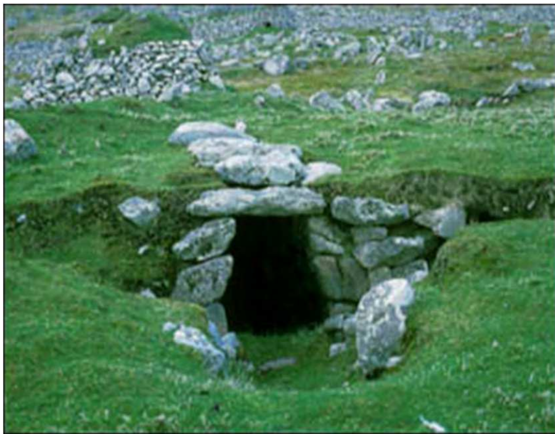
Fig. 4. Souterrain

The date of the first permanent settlement on St Kilda is not clear, but evidence suggests at least transient occupation from prehistoric times, harvesting the abundant stocks of fish and the sea birds, growing crops and keeping animals. A souterrain, an Iron Age earth house store about 2,000 years old, with a central long passage, and shorter passages or cells branching off, was discovered in 1844. A possible Bronze Age burial structure was excavated in 1995.