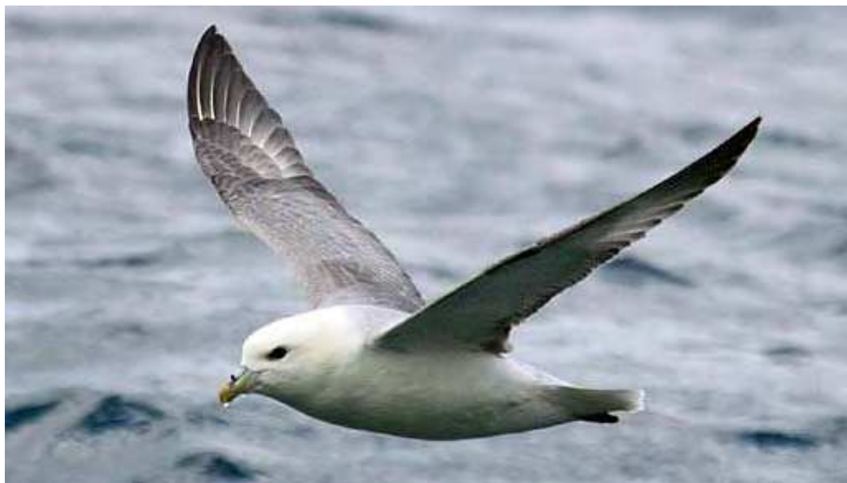
Fig. 13. Fulmar gull

Biodiversity appears to play no part in the neonatal tetanus tragedy; however St Kildans were also susceptible to common viral contagious diseases which had severe effects.