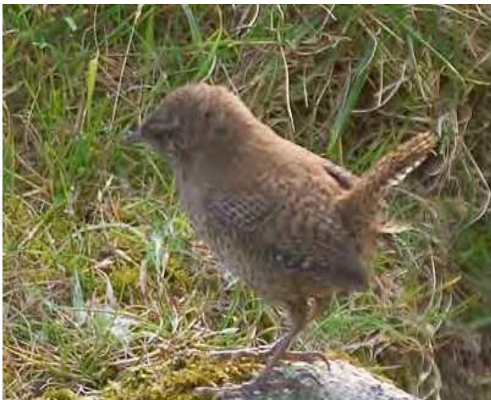
Fig. 7. St Kilda wren