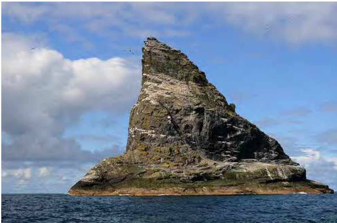
Fig. 14. Stac an Armin