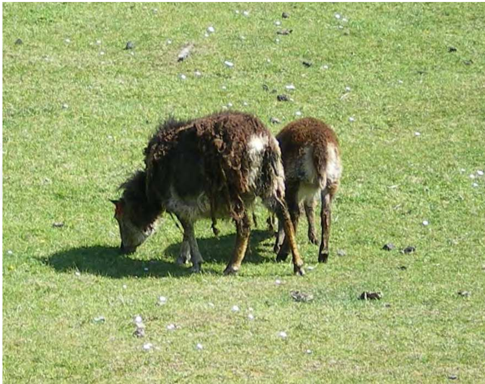
Fig. 6. Soay sheep