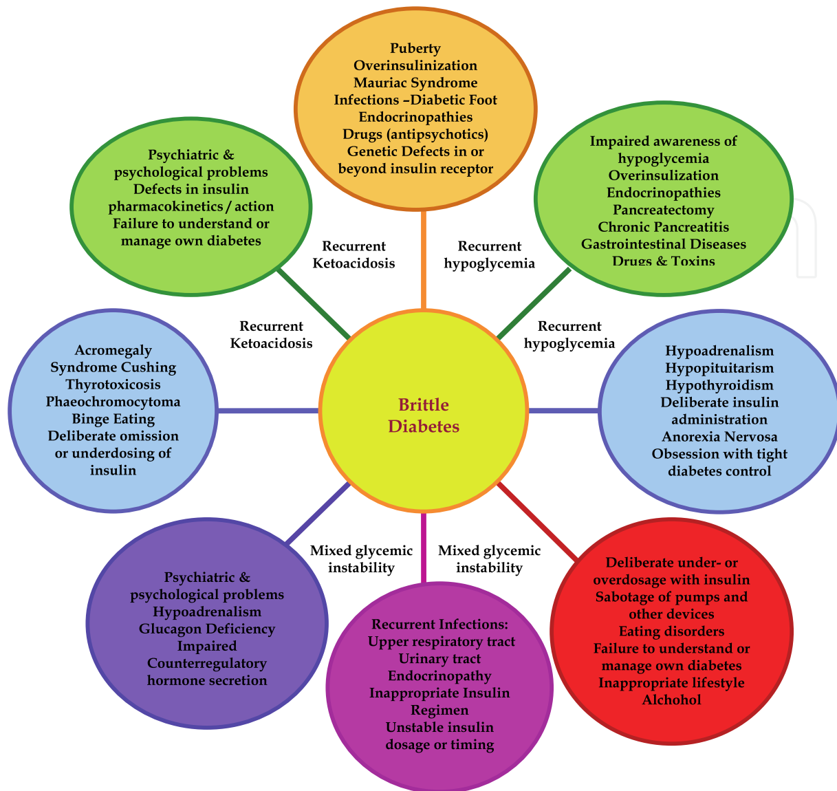
Fig. 1. Causes of Brittle Diabetes