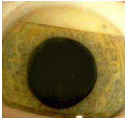
Fig. 2. ‘inverted hypopyon’ , emulsified oil in the Anterior chamber

Oil in the anterior chamber should be removed early to prevent problems with glaucoma. If oil is present in the vitreal cavity, care must be taken to ensure that it doesn’t come forward during the removal of the oil in the anterior chamber. This can be done with the use of 2 anterior chamber paracentesis. In one opening viscoelastic is injected into the AC pushing the oil towards the other paracentesis site where it is removed. The patient would be placed on anti glaucoma drugs until the viscoelastic reabsorbed, which can sometimes be delayed in eyes with reduced aqueous outflow. If only one paracentesis is used to aspirate the oil from the AC, the oil in the vitreal cavity will come forward to replace it, resulting in more oil in the AC.