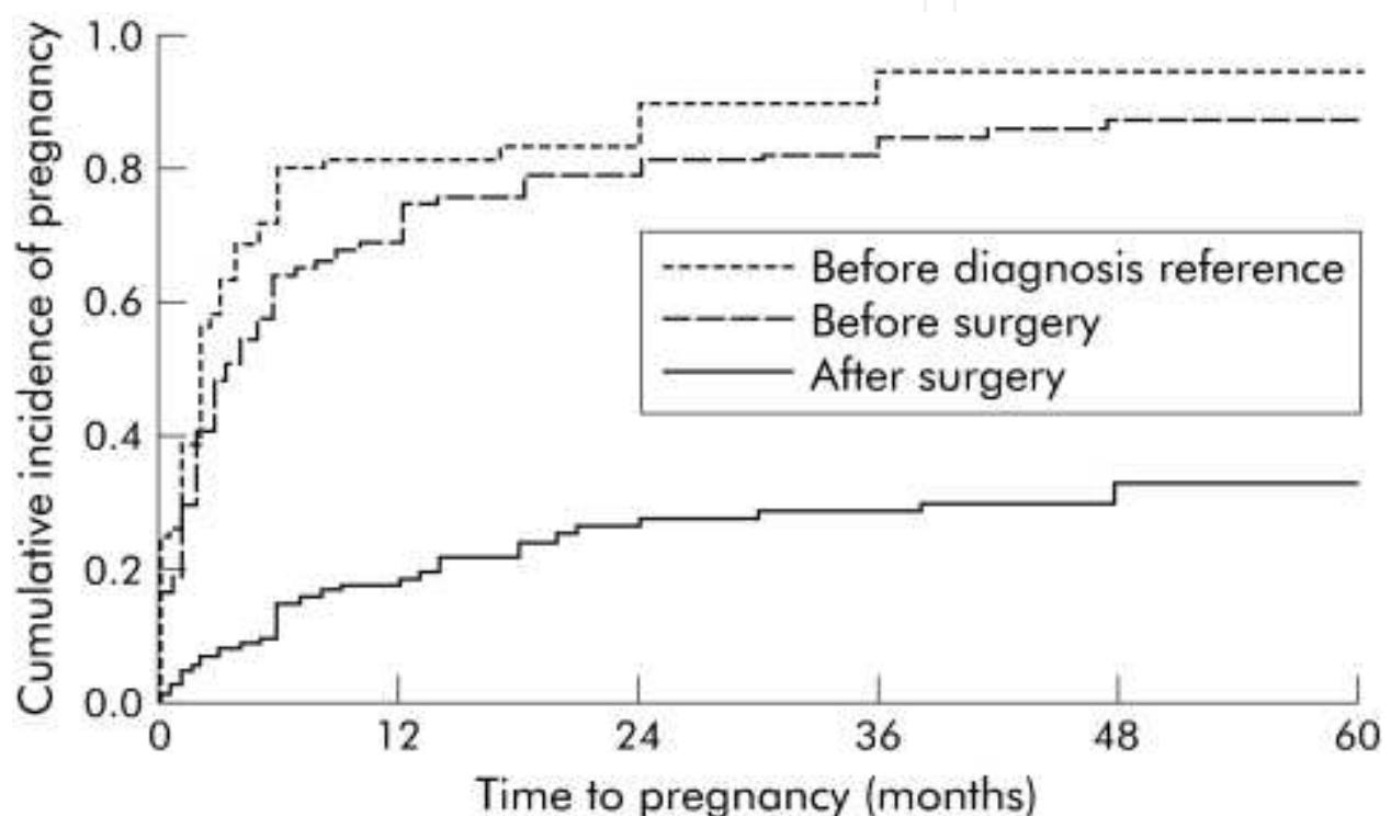
Fig. 1. Fecundability ratio in patients with ulcerative colitis before and after diagnosis, and after ileal pouch anal anastomosis compared with healthy controls. Reprinted from Olsen and colleagues [7]

Corticosteroids are used to induce remission during exacerbations of UC. They have been shown in rat studies to depress serum testosterone levels, but have no effect on gonadotropin levels [12]. Serum testosterone levels returned to normal on withdrawal of steroid treatment. Lerman et al demonstrated similar effects on fertility in male rats, although no change was seen in sperm number and motility [13]. There is limited data on the effects of exogenous steroids on male fertility in humans. A study by Roberts et al, suggested that an increase in endogenous cortisol levels observed following strenuous exercise was associated with a subsequent decrease in sperm concentration [14]. Therefore, steroids should only be used short term to control disease activity. The use of steroids for different diseases in females has not been associated with impaired fertility.