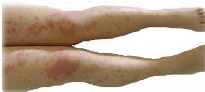
Fig. 1. Henoch-Schönlein purpura in a 8 years old female child

The purpura typically appears on the legs and buttocks (Fig.1), but may also be seen on the arms, face and trunk. The abdominal pain is colicky, and may be accompanied by nausea, vomiting, constipation or diarrhea. There may be blood or mucus in the stools. Sometime finding includes a gastrointestinal haemorrhage, occurring in 33% of cases, due to intussusceptions (Saulsbury, 1999). The joints involved tend to be the ankles, knees, and elbows but arthritis in the hands and feet is possible; the arthritis is non-erosive and hence causes no permanent deformity. Problems in other organs, such as the central nervous system (brain and spinal cord) and lungs may occur, but much less commonly than the skin, bowel and kidneys (Saulsbury, 2001)