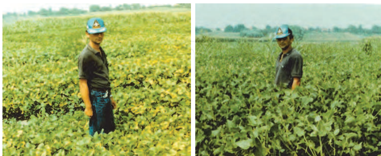
Fig. 1. Soybean status (middle of July 1989) on the control (left) and the highest rate of K (2670 kg K 2 O/ha in spring 1987) application (right) - the data in Table 6

Kovacevic & Vukadinovic (1992) tested response of soybean and maize to increasing rates of potassium application in KCl form on silty clay gleysol developed on calcareous loess. Low levels of exchangeable K, high levels of exchangeable Ca and Mg and strong K fixation were found by the soil test (Vukadinovic et al., 1988; Kovacevic & Vukadinovic, 1992). Also, clay fraction (35.2 % of soil) composition was as follows: vermiculite/chlorite 30 %, smectite 30 %, mixed layer minerals 20 %, illite 15 % and kaolinite 5 % (Richter et al., 1990). By ameliorative K fertilization soybean yields were increased drastically (3-y means: 1286 and 2607 kg/ha, for the control and the highest rate of K) and they were in close connection with improvement of leaf K and Mg status (Table 6 and Fig. 1).