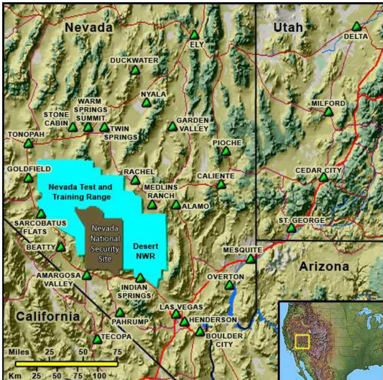
Fig. 3. The monitoring stations that make up the CEMP are located in communities and ranch sites scattered across a 160,000 km 2 area of southern Nevada, south-eastern California, and south-western Utah in the U.S.

The CEMP is funded by the U.S. Department of Energy (DOE), National Nuclear Security Administration, and administered by the Desert Research Institute (DRI), a non-profit environmental research arm of the Nevada System of Higher Education. While the DOE has historically been viewed by many in the region with distrust as the agency responsible for radioactive contamination of downwind areas, particularly during the era of above ground nuclear testing, the administration of the program by a state agency associated with the higher education system helps to improve confidence in the monitoring results. However, it is the participation of residents of the local communities that achieves the greatest benefit for the program in terms of public trust, communication, and education.