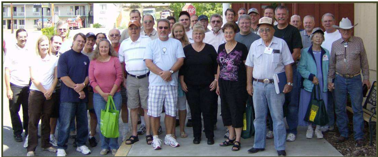
Fig. 6. Residents of 23 communities in southern Nevada, south-eastern California, and south-western Utah in the U.S., most of whom are schoolteachers, come together for regular workshops that train them to become effective communicators on issues related to the monitoring of ionizing radiation in their communities.