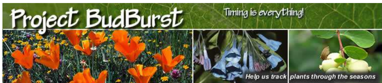
Fig. 1. On-line banner for Project BudBurst, a collaboration between the NEON program funded by the U.S. National Science Foundation and the Chicago Botanic Garden. The project also aims to integrate phenological observation programs initiated by other organizations, universities, and national laboratories.

Global climate change is already resulting in the changes in the timing of leafing, flowering, and fruiting of plants (plant phenophases) with a general lengthening of the growing season. While there have been many local records developed, there remain significant geographic gaps and gaps in the types of plants for which phenological records have been developed (Backlund et al. 2008). Project BudBurst, co-managed by National Ecological Observatory Network (NEON) of the U.S. National Science Foundation (Keller et al. 2008) and the Chicago Botanic Garden ( http://neoninc.org/budburst/_AboutBudBurst.php , accessed July 2011) is designed to address these data needs through public participation. The principle objective of NEON is establishing observational and experimental sites in 20 ecoclimatic domains in the contiguous U.S. as well as the states of Alaska and Hawaii. Project BudBurst's contribution is in expanding the number of locations and species for which information on the response to climate change is collected in the U.S. and Canada by using citizen scientists referred to as "Project BudBurst Observers." See Fig. 1.