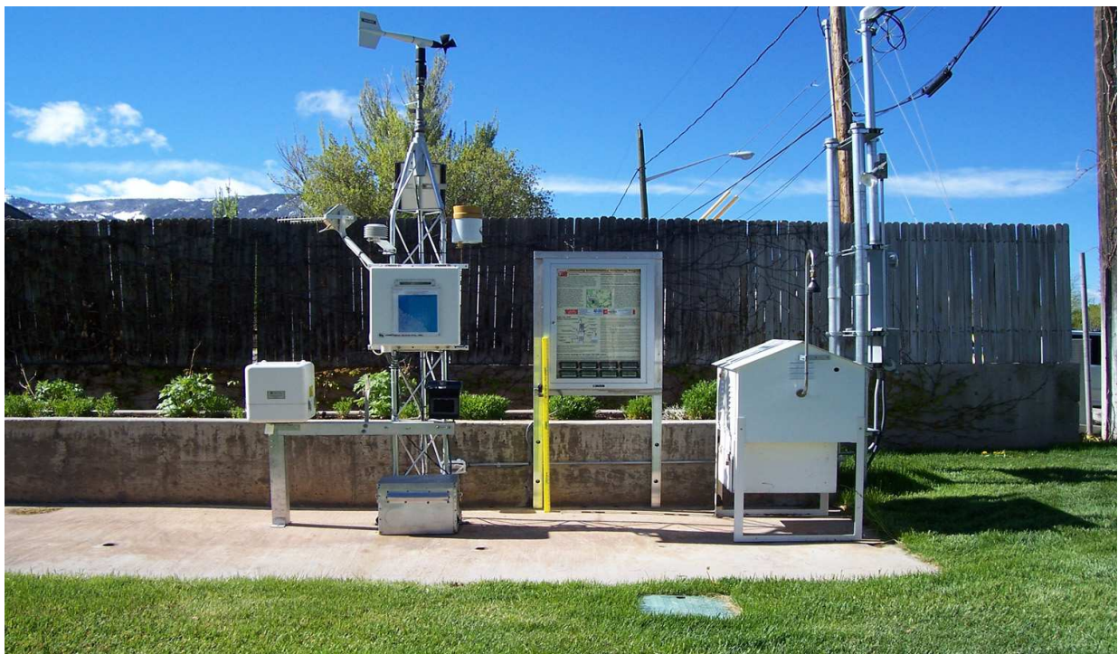
Fig. 4. A typical CEMP environmental monitoring station, with a full suite of meteorological sensors, radiation detection equipment, air sampler, and interpretive display with real-time sensor readouts.

The public participants in this program are not strictly volunteers, but receive a small monthly stipend for their duties as employees of DRI. The decision to hire them as employees was made in part to stress the importance of their sample collection duties, but also to offer them protection for any injuries that might occur during the discharge of their duties. The amount they are paid (approximately $150 US per month) is small, so as not to create the public perception that they are "in the pocket" of the DOE sponsors, and simply being given messages to parrot to their communities. On the contrary, CEMs are provided with regular training on the basics of ionizing radiation, and become knowledgeable on subjects ranging from radiation detection to local environmental conditions. Through attendance at these training workshops, the CEMs also become effective liaisons between local and federal entities, helping to identify concerns of people in their communities.