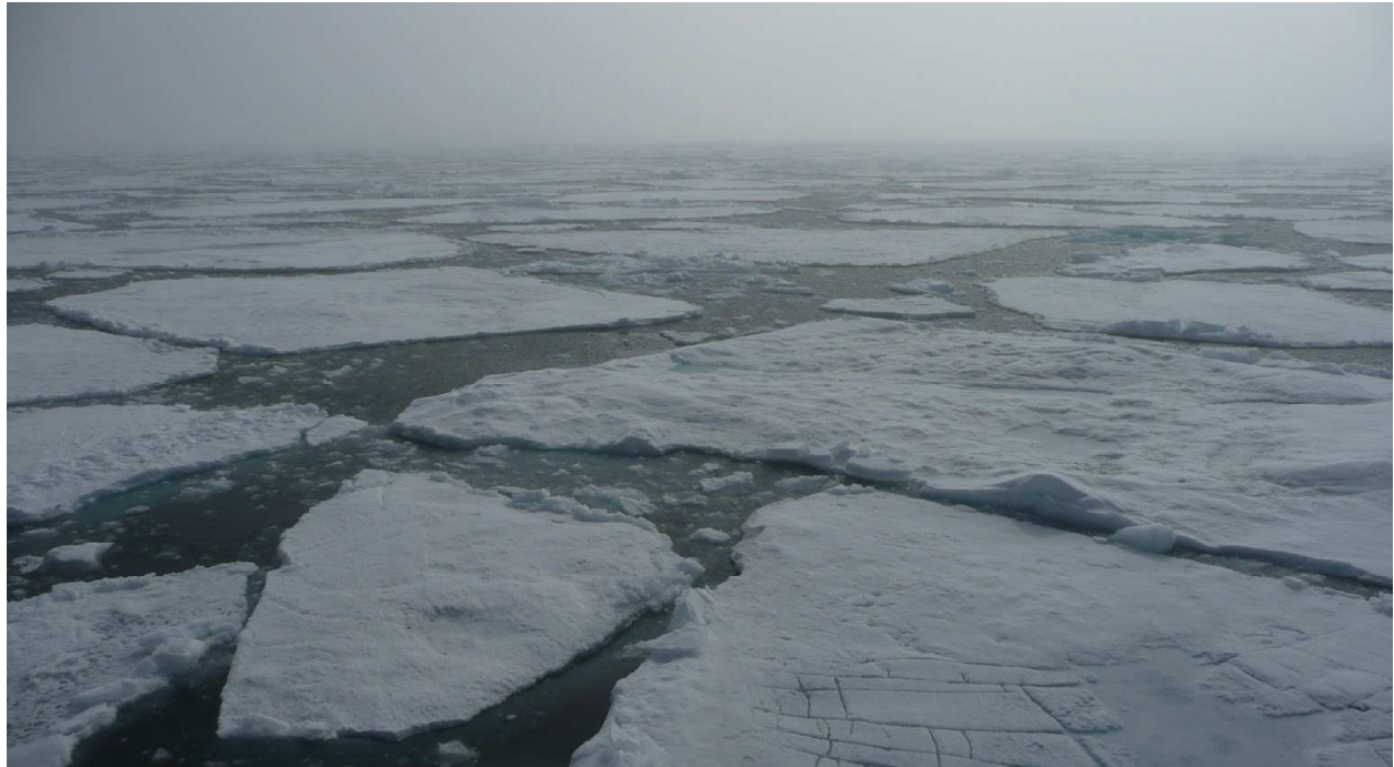
Fig. 2. Although sea ice has partially broken up on this bay, thin ice is beginning to form over the open water areas again. Such observations of episodic ice thaw are one type of observation sought in the IceWatch Canada program.

particularly for those parts of the country at higher latitudes where the population of Canada is sparse.