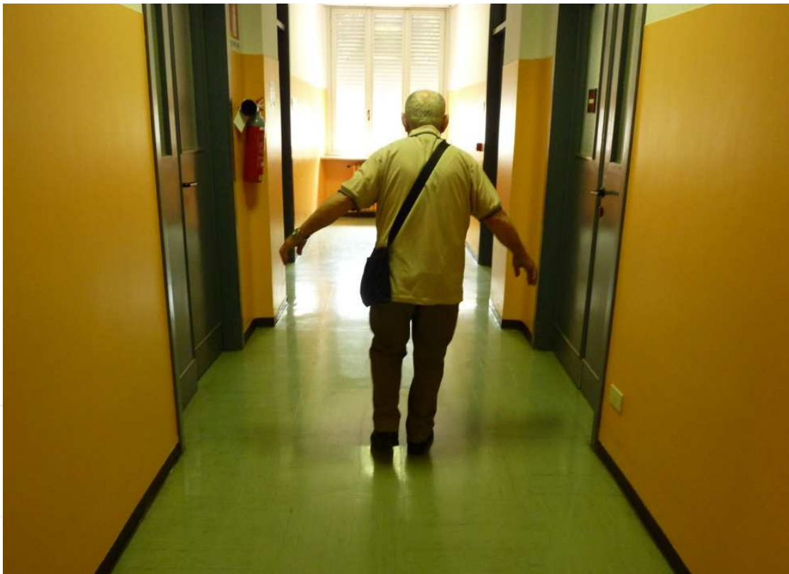
Fig. 2. Tightrope walking: the patient walks very slowly on a broad base with his arms extended.

exaggerated effort or fatigue with grimaces, excessive slowness, convulsive shaking, often with knee buckling especially when the patient has unilateral functional weakness, astasia-abasia, arms are outstretched like a tightrope walker (Fig. 2), unusual uneconomic posture and bizarre movements (Bhatia, 2001; Baik & Lang, 2007). Patients with psychogenic require further strength and balance than an indifferent gait and they seem to be frightened of falling, and this gait allows them to be closer to the floor (Stone & Carson, 2010). The movement disorder is commonly accompanied by other psychogenic neurological symptoms, such as false weakness or sensory findings, or by excessive pain and tenderness (Thomas & Jankovic, 2004). Okun et al. described 9 consecutive patients who presented with a psychogenic gait disorder who underwent "chair testing." Each patient was asked to walk 20-30 feet forward and backward toward the examiner. Patients were then asked to sit in a swivel chair with wheels and to propel the chair forward and backward. Compared with their walking, 8 of the 9 patients in the psychogenic group performed well on the chair test, showing improved ability to propel a chair forward when seated. By contrast, all 9 control patients with nonpsychogenic gait problems, performed equally when walking or propelling utilizing the chair (Okun et al., 2007).