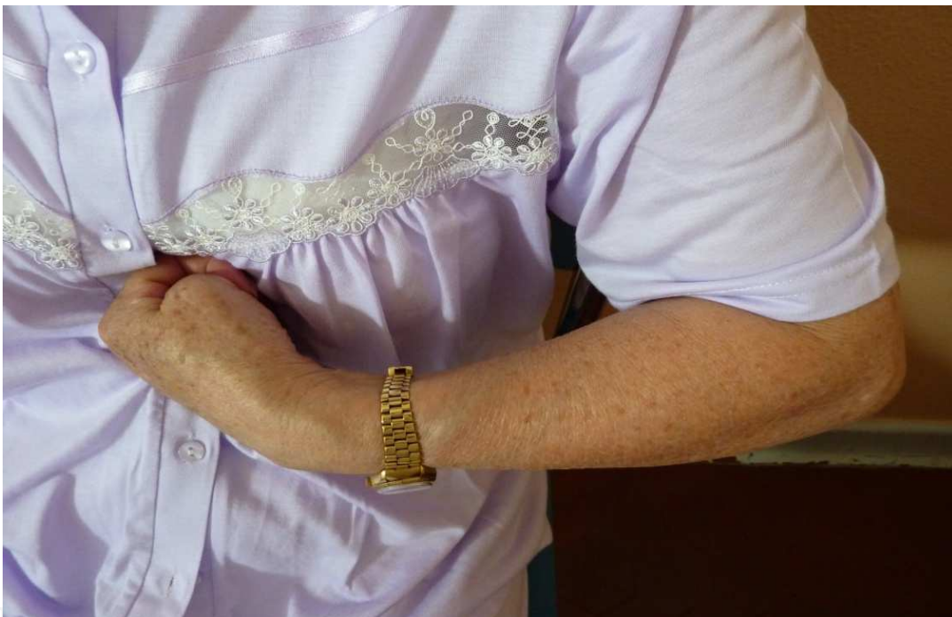
Fig. 1. A fixed dystonic posture of psychogenic origin

Controversial patients are those with dystonia developing within hours or days after a minor injury, with a fixed dystonic posture and severe pain. This kind of dystonia may be associated with features of complex regional pain syndrome type I. A study by Schrag and co-workers show that a substantial proportion of patients with fixed dystonia clearly fulfils criteria for a psychogenic dystonia (37%) or somatization disorder (29%). Although fixed dystonia sometimes developed in patients in whom a diagnosis of somatization disorder had already been made, a history of somatization was often unrecognized and, in many cases, only became evident after examination of primary care records (Schrag et al., 2004; Miyasaki et al., 2003). Various features of complex regional pain syndrome-related fixed dystonia suggest abnormal regulation of inhibitory interneuronal mechanisms at the brainstem or spinal cord level and impairment central synaptic reorganisation due to an interaction between neuroplastic activities and anomalous environmental necessities (Munts & Koehler, 2010).