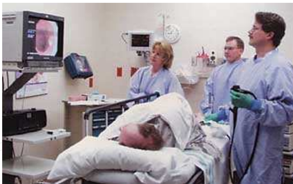
Fig. 1. Colonoscopy.

Many individuals are still hesitant to undergo colonoscopy despite numerous advertisements and campaigns about it. A few years back, a famous TV personality named Katie Couric, had her colonoscopy broadcasted through live television because she wanted the public to see that there's nothing scary or frightening about the procedure. Her husband died of colon cancer at a young age. Had he had a colonoscopy (Fig. 1), his cancer would have been diagnosed and treated early which could have saved or prolonged his life.