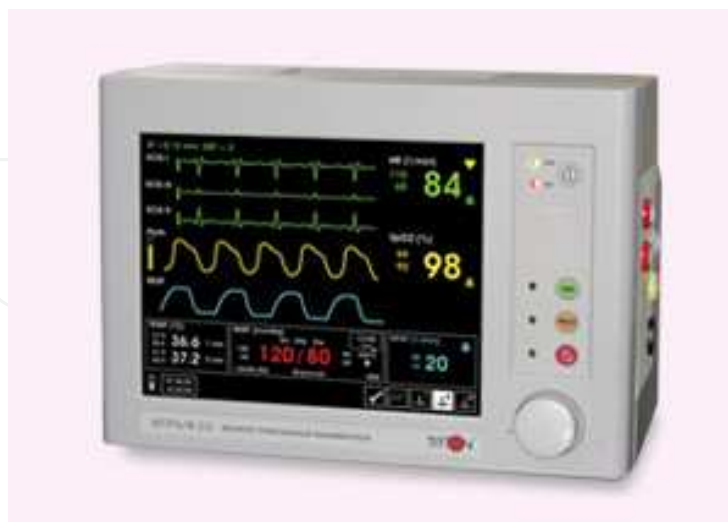
Fig. 5. Sample of monitoring equipment used

During the procedure, the patient is hooked up to a monitor that measures and displays the heart rate, blood pressure, and oxygen saturation (Figure 5) and in some cases, carbon dioxide levels (capnography). Some have also used transcutaneous carbon dioxide measurement or bispectral index monitoring (BIS). The latter is a quantitative assessment of cortical activity that has been used to monitor sedation and adjust sedation levels (Kissin, I., 2000). These are monitored by a licensed personnel (usually the person providing the sedation) every 3-5minutes during the procedure and with each incremental dose of the sedative. Monitoring may detect changes in the individual's blood pressure, heart rate, cardiac electrical activity, ventilatory, and neurologic status that might signal a clinically significant compromise of the patient's health status or that the patient has progressed to a deeper level of sedation than originally intended. Oxygen is usually given as an adjunct via a nasal cannula or mask as all of the sedation agents depress the respiratory system. The ASA guidelines recommend that patients receiving sedation medications receive continuous electrocardiogram (ECG) monitoring, especially if they have significant cardiovascular disease or arrhythmias. 20 Parameters outlined in the Modified Aldrete scoring system, which includes the above mentioned items plus activity and consciousness are also monitored and recorded.