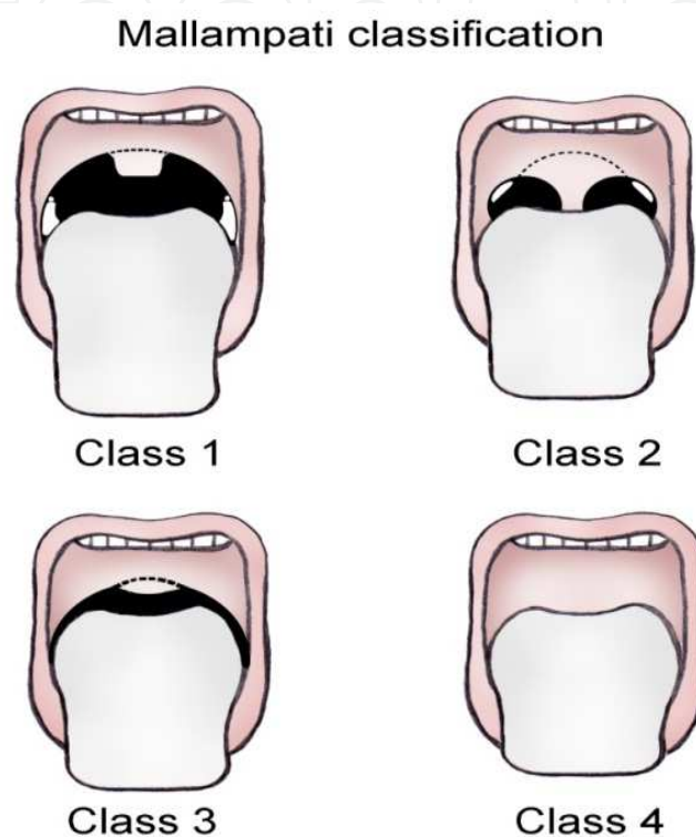
Fig. 4. Mallampati classification of airway management.

procedure with the patient. He will then sign the consent form allowing the endoscopist to perform the procedure and to be given sedating medications (if agreeing to sedation). The anticipated level of sedation should be congruent with the expected level of sedation by the individual as much as possible. The endoscopist will also review the colonoscopy procedure, the benefits, risks and complications to patients who are not receiving sedation. Preparation is the same as for sedation in the event that an emergency arises or the patient requests medication during the procedure.