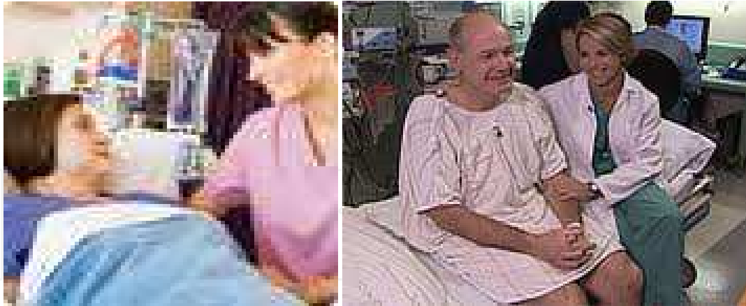
Fig. 3. Confidence and satisfaction in colonoscopic procedures