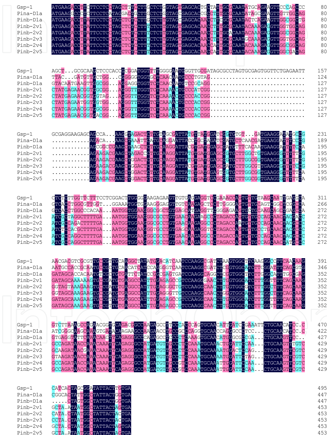
Fig. 1. DNA sequence alignment of Puroindoline b-2 gene variants Pinb-2v1 , Pinb-2v2 , Pinb-2v3 , Pinb-2v4 , Pinb-2v5 , Pinb-D1a , Pina-D1a as well as Gsp-1 from bread wheat.

Pinb-2v3 genotypes (Table 2). The results indicated that Pinb-2v3 cultivars possessed superior grain yield traits compared to Pinb-2v2 , possibly suggesting that the Puroindoline b-2 gene could modulate wheat grain yield to some extent, and that the grain yield of cultivars with Pinb-2v3 is slightly higher than that of cultivars with Pinb-2v2 . Another likely possibility is that these Pinb-2 variants are identifying germplasm pools or founder effects.