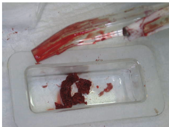
Fig. 2. Autogenous bone graft collected from the same surgical site by safe scraper.