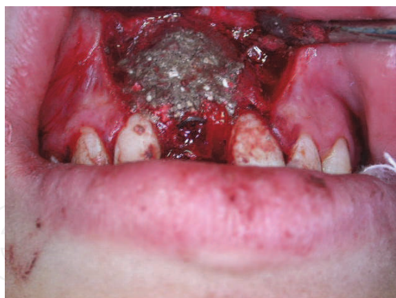
Fig. 4. Immediate dental implant placement into fresh socket and augmented with combined bone graft.