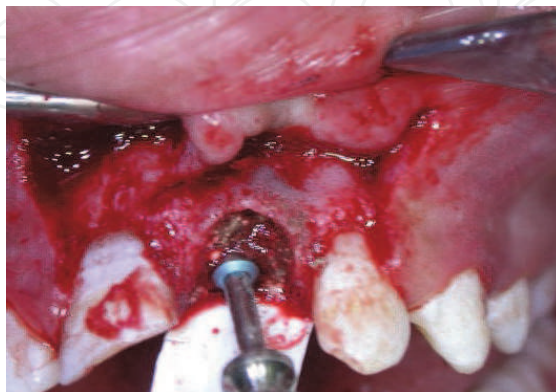
Fig. 1. Immediate dental implant placement into fresh socket augmented with autogenous bone graft.

be exhibited by only a minute segment of the patient population. When the donor site and recipient site are located within the same half of the mandibular arch, the surgical procedure is reduced to one mutually inclusive incision, which gains access to the donor bone on the lingual aspect and the recipient site on the buccal aspect. The removal of the tori can be accomplished with minimal trauma and low postoperative morbidity. Therefore, the cortical and cancellous nature of the bone, with a thickened outer cortical plate of haversian bone, makes it an excellent choice as a donor site for onlay grafting procedures.