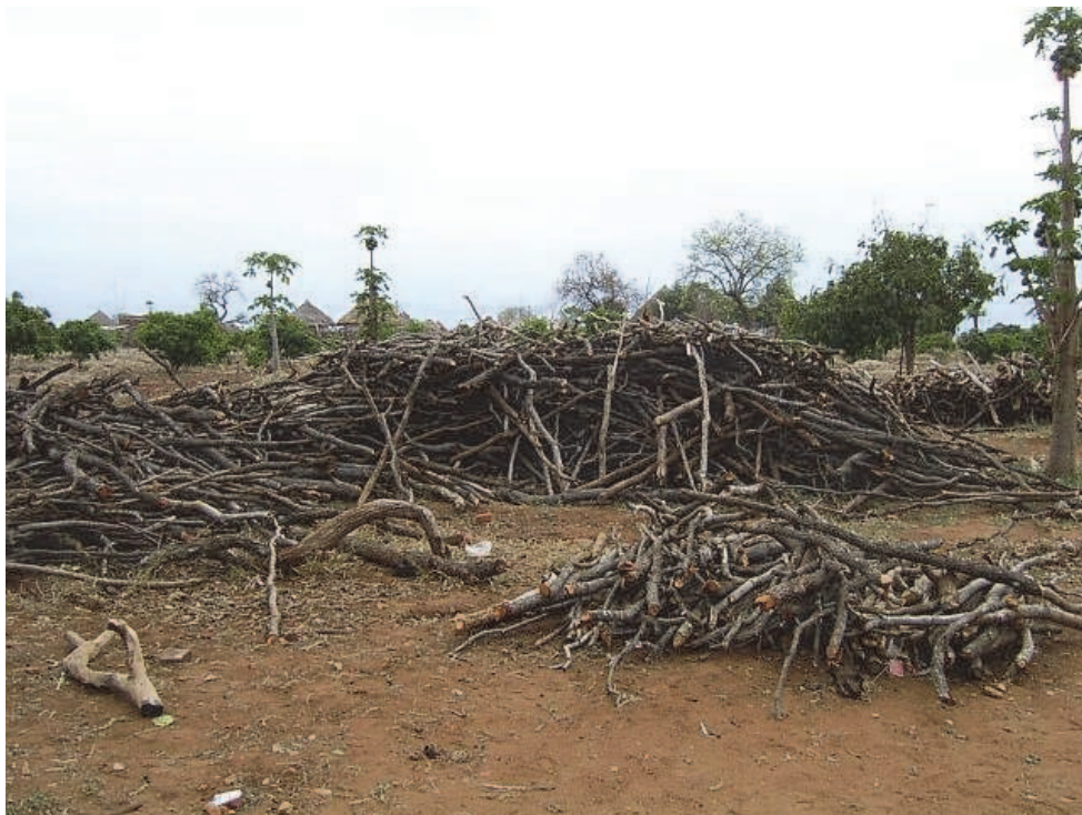
Fig. 4. Illegally collected fuelwood (mostly Colophospermum mopane ) confiscated by Magona Traditional Authority in August 2004. Reproduced with permission from Anthony (2006)

Firey's predictions may indeed be materializing in South Africa. Political transformation processes have led in many cases to de facto open access systems with new forms of opportunism, manifested by perverse incentives for unsustainable resource extraction, especially by 'gain-seeking' outsiders (Figure 4). These are exacerbated by low capacities in the provincial government structures and fueled by the stripping of powers of legitimate TAs (Anthony et al., 2010). According to a KNP internal report, increasing rates and magnitude of inter alia deforestation has been observed in areas adjacent to KNP claiming that 'trucks transporting newly cut poles and wood are often observed along the roads in adjacent areas'. In its summary, this report emphasized that 'the rate at which the destruction and degeneration is taking place will render the area useless for future community-based conservation projects.'