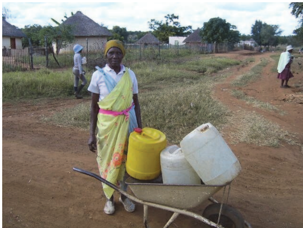
Fig. 3. Tsonga woman on route to collect drinking water from community tap.

Opinions expressed on nature conservation, i.e. protecting trees and wild animals, lag far below more immediate development needs such as employment, health, education, and improving infrastructure. Employment needs were apparent as we noted male absence in the study area, which is likely attributable to outmigration (or cyclic migration) to larger urban centers or mines where employment opportunities are greater (Bryceson, 1999). Male absence in rural areas can create labor vacuums, especially in cases where domestic responsibilities are sharply divided amongst household members, and may disproportionately increase pressures on households with only women and children. In this research about one in eight households was comprised only of women and children. This constraint is exacerbated by time required for women and children carrying out domestic chores, including almost 20 hours per week for collecting fuelwood and drinking water alone in the study area (Figure 3) (Anthony, 2006). With water scarcity perceived to be widespread in the study area, and fuelwood becoming scarcer in some areas north of the