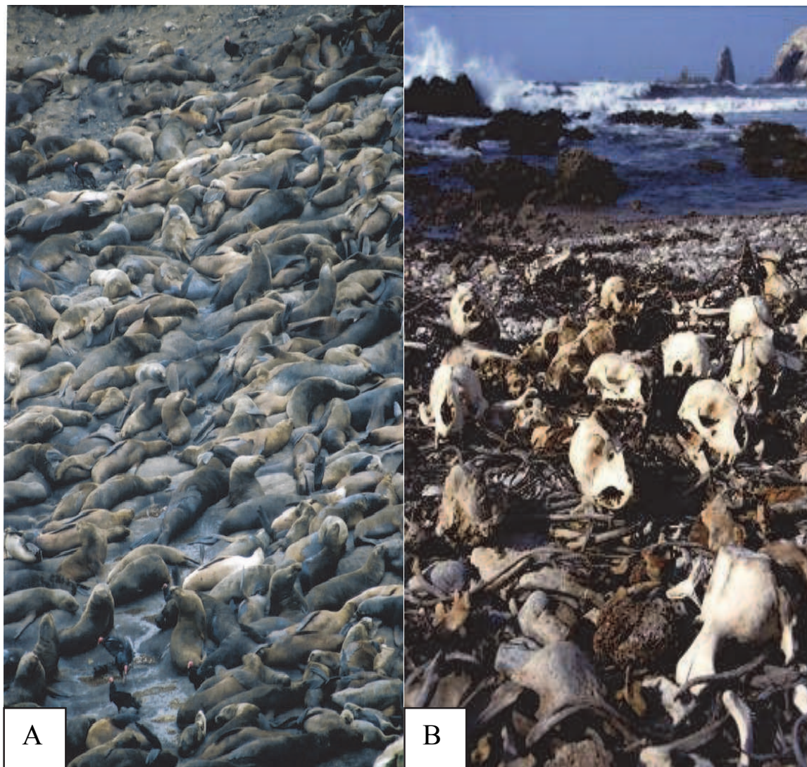
Fig. 1. South American sea lion ( Otaria flavescens ) breeding colony at Punta San Juan, Peru. A. during a non-ENSO period. B. during 1997-98 ENSO.

An important application of N_e in conservation biology is the estimation of the minimum viable effective population size, particularly in cases like the Peruvian fur seals and sea lions that suffered significant declines after an environmental change due to ENSO. Adequate assessment of viability requires, in part, determining whether the population is large enough to avoid inbreeding or to maintain adaptive genetic variation (Vucetich & Waite, 1998). A population with a high N_e retains high levels of genetic diversity and reduces the probability of effects of inbreeding depression. In contrast, a population with a very low N_e is more susceptible to genetic drift and less able to respond to selection. This is because in small populations there is less genetic variation for natural selection to act upon, and there is a higher probability that beneficial alleles will not be maintained by selection and will instead be lost from the population because of random drift effects (Willi et al., 2007). Furthermore, the estimate of N_e reflects the number of individuals responsible for maintaining the genetic diversity of the species as well as its evolutionary potential. Since the goal is the conservation of species as dynamic entities capable of evolving to cope with environmental change, it is