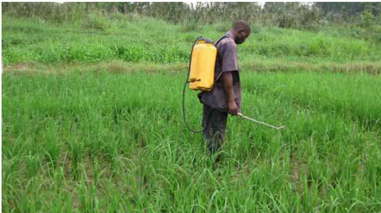
Fig. 2. Pesticide application on rice field