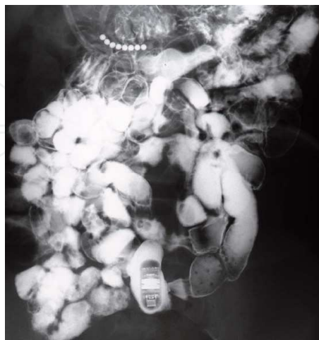
Fig. 2. Capsule retention.

The most significant complication in the CE examination is capsule retention (Fig.2). Capsule retention is defined as having a capsule endoscope remain in the digestive tract for a minimum of 2 weeks (Cave, 2005). A preceding normal small-bowel series does not preclude subsequent CE retention. The reported capsule retention rate in a study of 900 adult patients was approximately 0.7% (Barkin, 2002). It should be noted that there are potential risks of retention in CD, especially known CD. A previous study in adults (Cheifetz, 2006) revealed that CD is an potential risk of having the retention which is caused by unsuspected strictures, and retention was occurred in 13% (5 of 38) of patients with known CD, whereas in 1.6% (1 of 64) with suspected CD. When we reviewed previous CE studies of pediatric patients, which included at least 10 CE examinations for each patient, and found that 13 capsules had been retained in a total of 345 CE examinations giving an average frequency of capsule retention of 3.7% (range, 0–20%) (Table 4).