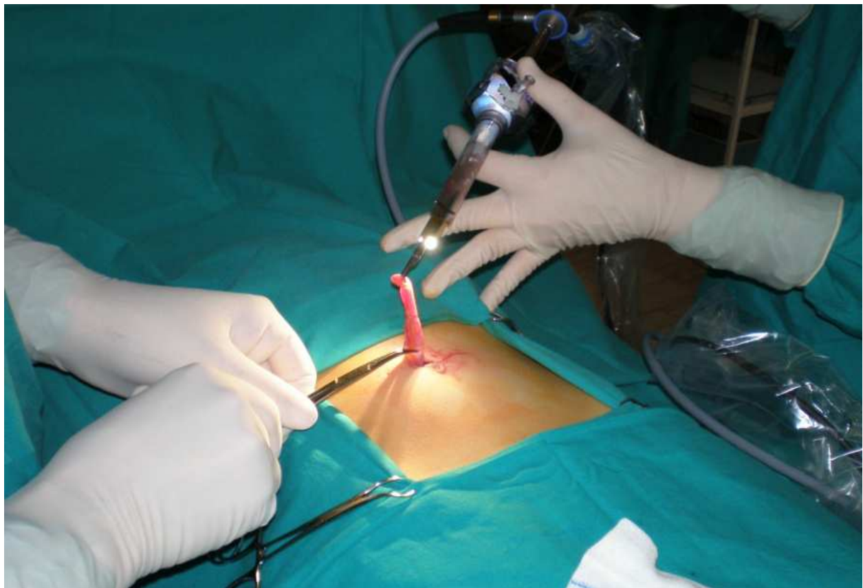
Fig. 2. Port, scope and instrument should be brought out of abdomen together with appendix