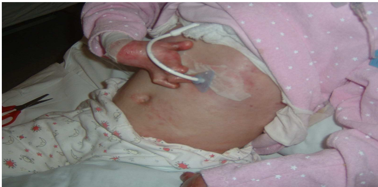
Fig. 3. Laparoscopic gastrostomy in epidermolysis bullosa

For those children whose esophagus is not passable for flexible endoscopy, e.g. refracter strictures, epidermolysis bullosa, (Figure 3) etc, endoscopic guidance by transstomach illumination is not possible. Then, gastrostomy made by an operative laparoscope placed trough the umbilical port could be one of the options. The stomach and abdominal wall can be visualized directly thus limiting the chance of inadvertent injuries. Stomach is fixed by a fine grasper and approximated to the abdominal wall. Two percutaneous sutures are placed and PEG cannula can be inserted into the stomach as in endoscopic PEG placement, but now