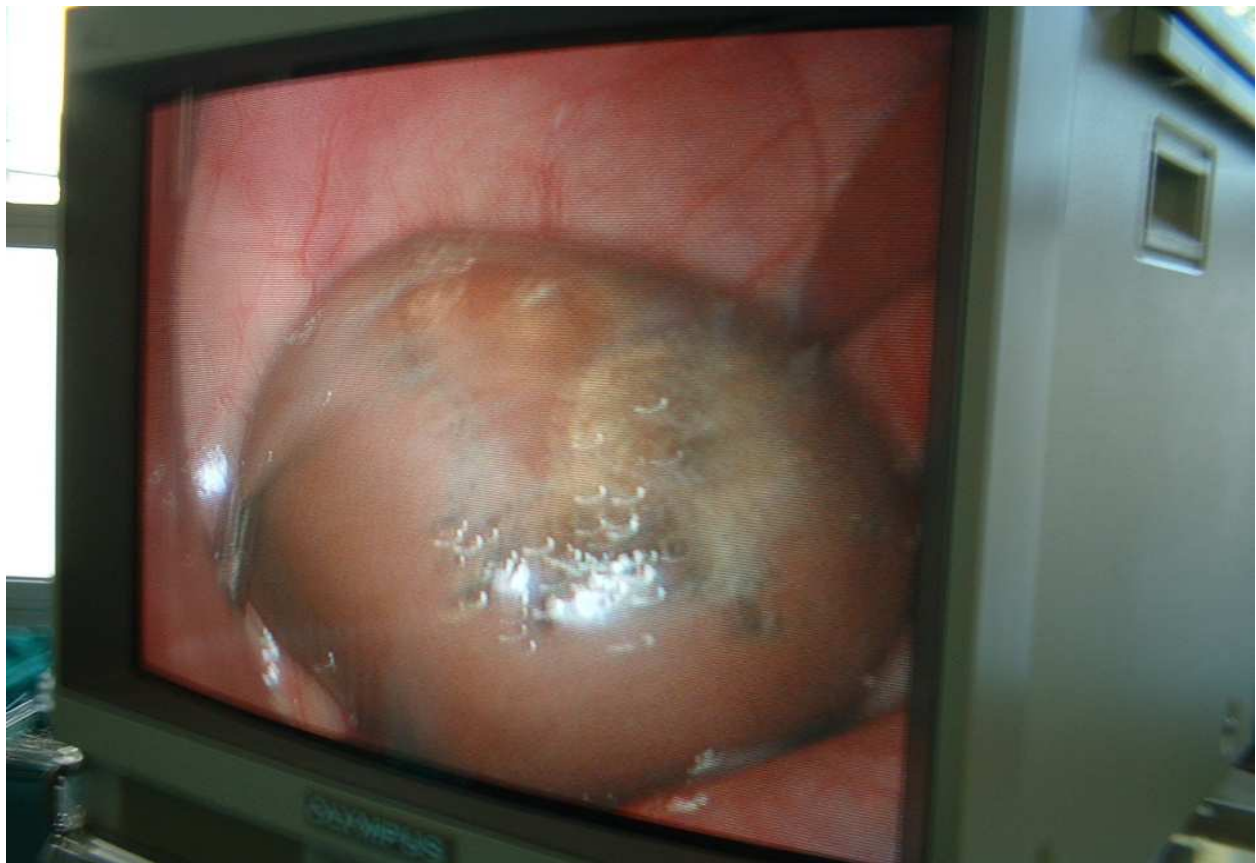
Fig. 5. Preserved integrity of the cyst after laparoscopic mobilization

If the cyst wall is attached to the parietal peritoneum, dissection is necessary. By pushing cyst forward, loose adhesions are exposed. Dissection of adhesions can be done by scissors' tip (curved tip scissors) as close as possible to the peritoneal side in order to preserve the integrity of cyst wall until the whole cyst is completely freed and mobile (Figure 5).