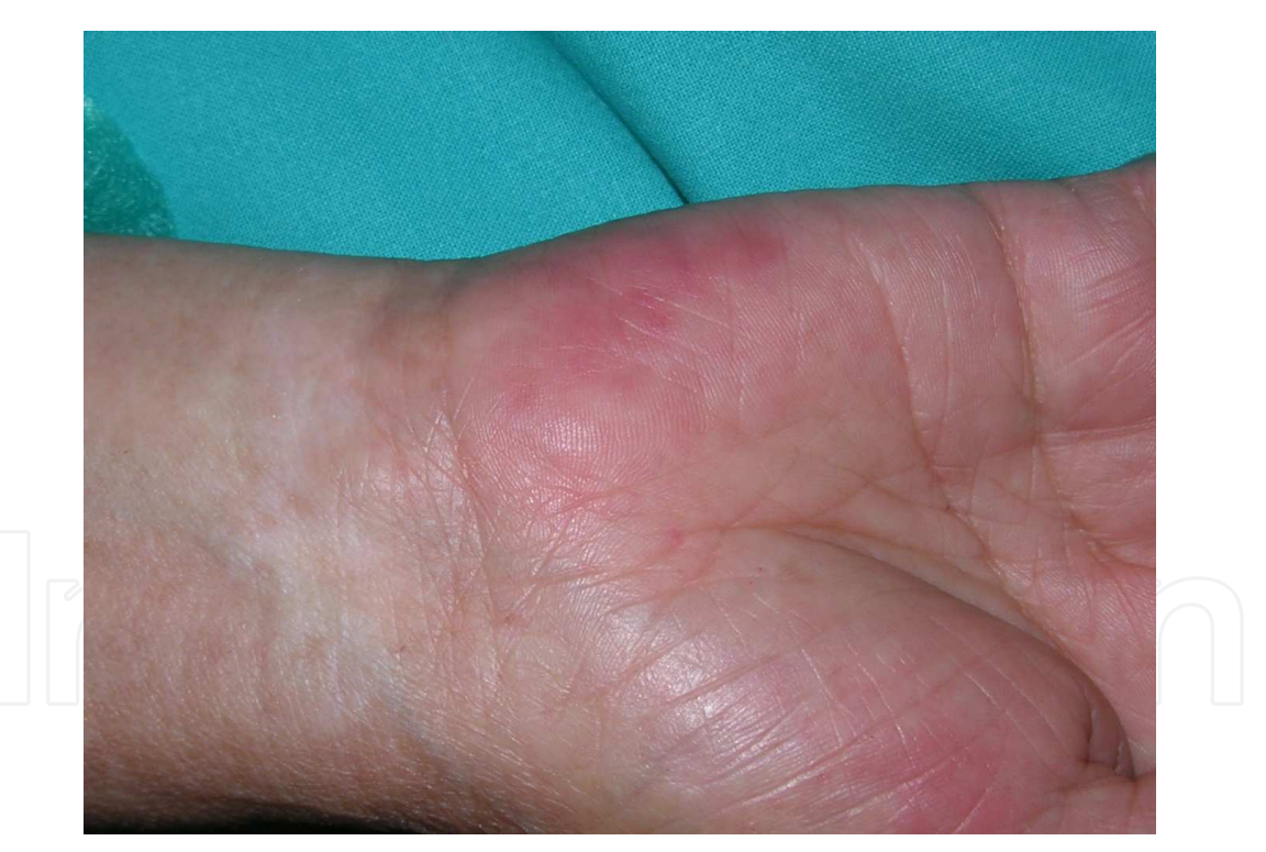
Fig. 2. The plaques on tenar and hypotenar skin have frequently a characteristic appearance of "montain range"