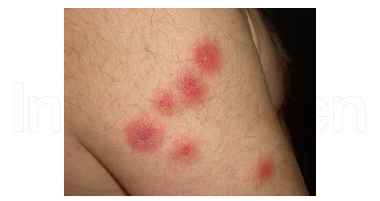
Fig. 1. Erythematous plaques with vesicular and bullous appearance due to a intense dermal edema.