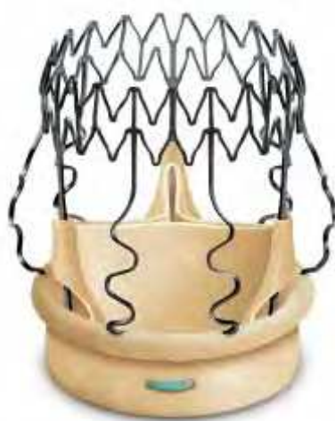
Perceval Sorin Valve