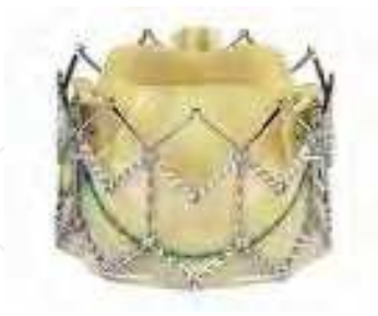
The Edwards Sapien XT valve

The new Edwards Lifescience device, the Sapien-XT valve, can be delivered by an arterial or venous access site (anterograde or retrograde technique) as well as by a transapical approach; it has the CE mark since 2007 and has the FDA investigational device exemption for the PARTNER US trial. Like the CoreValve system, more than 10,000 devices have been implanted all around the world with promising initial results. It is constructed with a bovine pericardium valve sewed to a balloon expandable chromium-cobalt stent to be anchored to the calcified native aortic annulus. Three sizes are commercialized: 23mm (for aortic annulus between 18 and 21mm), 26mm (for aortic annulus between 21 and 25mm) and the recently added 29mm size for annulus over 25mm. The femoral sheath is 18F for the smaller size and 19F for the 26, and the transapical sheath is 22F for the smaller, 24F for the 26mm size and 26F for the 29mm. No femoral system has been designed yet for the 29mm valve.