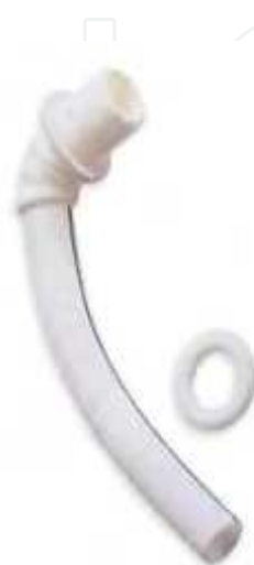
Aorto-apical conduit Medtronic Hancock

Surgical aortic valve replacement by median thoracotomy under cardiopulmonary bypass is, as mentioned above, the standard therapy for severe aortic stenosis that has proven superiority to conservative pharmacological therapy. Many times, however, this treatment cannot be performed because of different technical, anatomic or clinical problems that the patient may present, as it could be porcelain aorta or tiny aortic annulus. Aortic valve conduits, also known as apicoaortic conduits, are a sort of devices designed in the sixties to give an alternative in these situations. Apicoaortic conduits connect the left ventricle apex with the descending thoracic aorta, relieving the intraventricular pressure by allowing the blood flow to find a way out of the heart without fighting against the aortic valve resistance. Because the operation was technically difficult, it had fallen into disuse, but, with the introduction of technically easier and less invasive procedures performed by minithoracotomy, this alternative offers clear advantages over standard valve replacement (avoidance of sternotomy, cardiopulmonary bypass, cardioplegic cardiac arrest, native valve debridement, conduction system injury, aortic cannulation, and aortic cross-clamping) and arises as another option in addition to transcatheter aortic valve implantation as alternative therapy for high risk patients. This technique offers the possibility to choose from a big variety of valve models and sizes, it