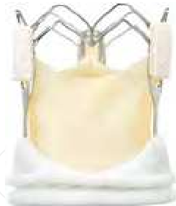
Enable 3F Valve