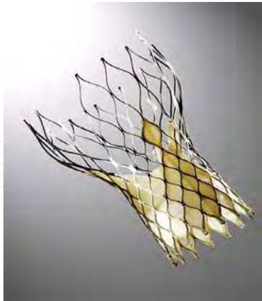
The Core Valve

The new Edwards Lifescience device, the Sapien-XT valve, can be delivered by an arterial or venous access site (anterograde or retrograde technique) as well as by a transapical approach; it has the CE mark since 2007 and has the FDA investigational device exemption for the PARTNER US trial. Like the CoreValve system, more than 10,000 devices have been implanted all around the world with promising initial results. It is constructed with a bovine pericardium valve sewed to a balloon expandable chromium-cobalt stent to be anchored to the calcified native aortic annulus. Three sizes are commercialized: 23mm (for aortic annulus between 18 and 21mm), 26mm (for aortic annulus between 21 and 25mm) and the recently added 29mm size for annulus over 25mm. The femoral sheath is 18F for the smaller size and 19F for the 26, and the transapical sheath is 22F for the smaller, 24F for the 26mm size and 26F for the 29mm. No femoral system has been designed yet for the 29mm valve.