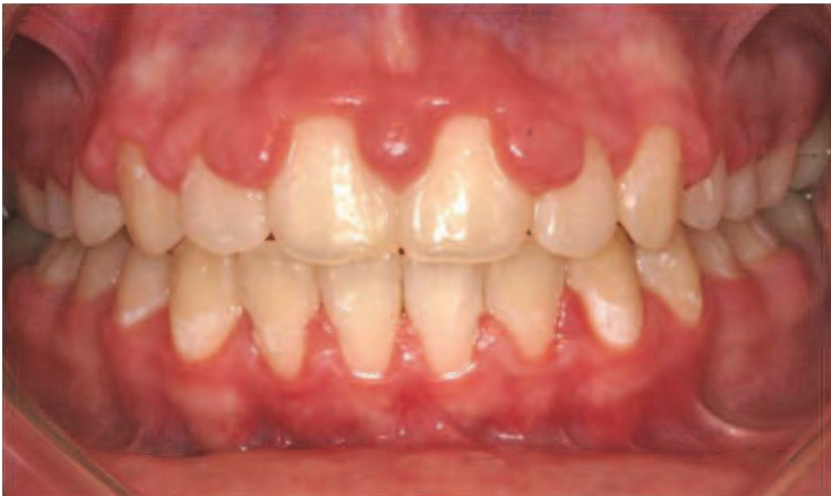
Fig. 10. Diabetes

Diabetes mellitus is characterized by disorders in insulin production, the metabolism of carbohydrates, fats, and proteins and in the functioning and structure of blood vessels. Patients with type I diabetes are at greater risk of developing gingivitis. Both children and adults with poor metabolic control show a greater tendency towards more severe gingivitis. The prevalence of gingivitis in children and adolescents with diabetes is nearly twice that observed in children and adolescents without this disease. The association between diabetes and gingivitis in children and adolescents is so widely accepted that diabetes mellitus-associated gingivitis appears as a specific entity in the most recent classification of periodontal diseases. Adults with type II diabetes may show higher rates of gingival inflammation versus adults without diabetes. Almost 64% of diabetics are estimated to have gingival inflammation, in comparison to 50% of non-diabetics. (Figure 10).