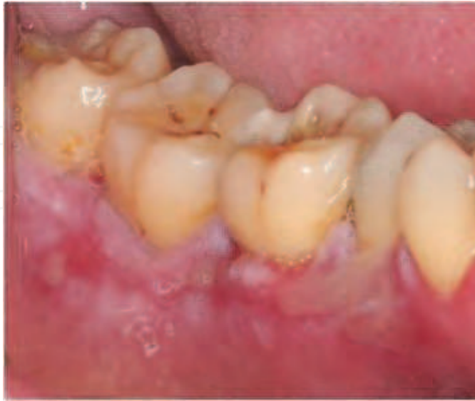
Fig. 7. Pemphigus

Individuals suspected of this condition must be referred immediately to a dermatologist. (Figure 7,8)