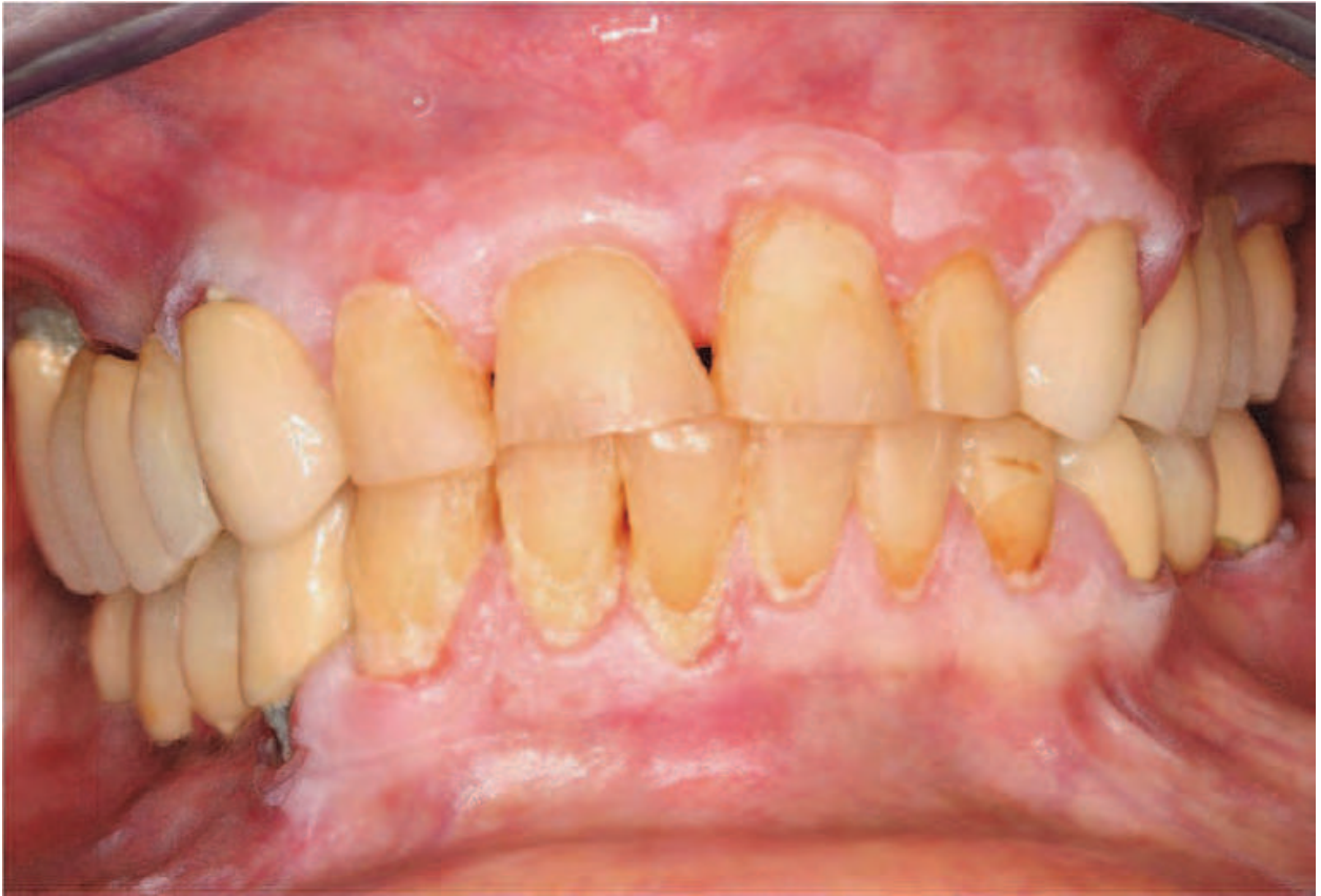
Fig. 4. Leukoplakia