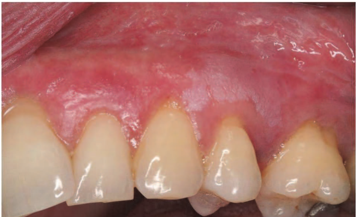
Fig. 5. Leukoplakia