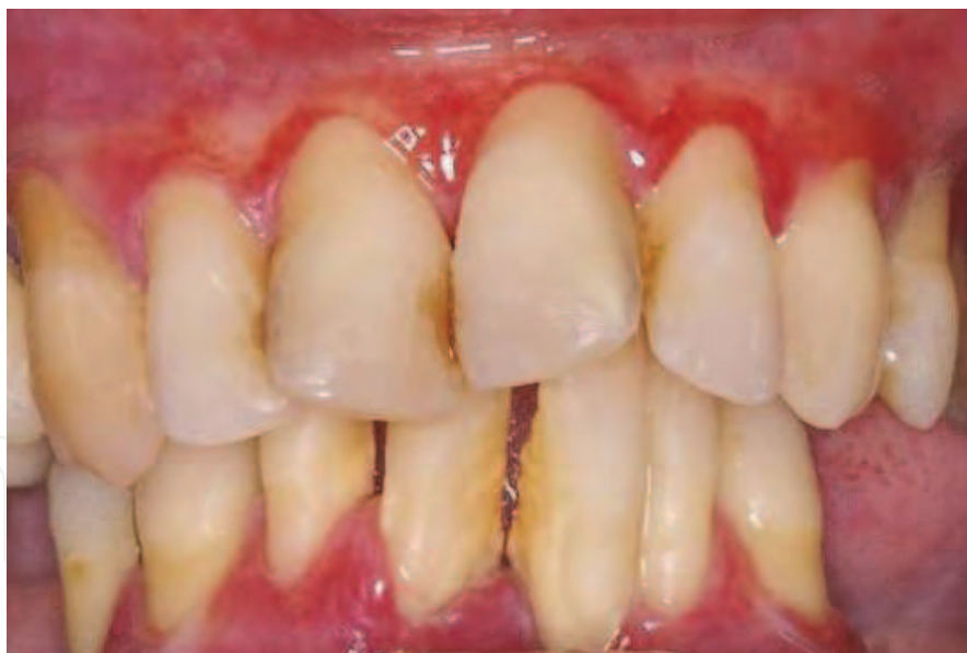
Fig. 9. Chronic desquamative gingivitis

The disease spectrum includes a mild and self-limited skin variant with exanthematic characteristics and minimal oral involvement and a severe, progressive variant that leads to extensive mucocutaneous epithelial necrosis, also known as Stevens-Johnson disease. In the milder form, oral lesions in the labial and buccal mucosa, tongue, palate, and gums change from papulae to blisters. Recurrence is very frequent, and the healing of lesions can take several weeks. Erythema multiforme has always posed a diagnostic challenge due to its extremely varied features, which can mimic other diseases. Nevertheless, the natural history and clinical and histological findings usually allow other conditions to be ruled out and a definitive diagnosis to be reached (Lozada & Silverman, 1978). Treatment calls for corticosteroids and plaque control.(Figure 9).