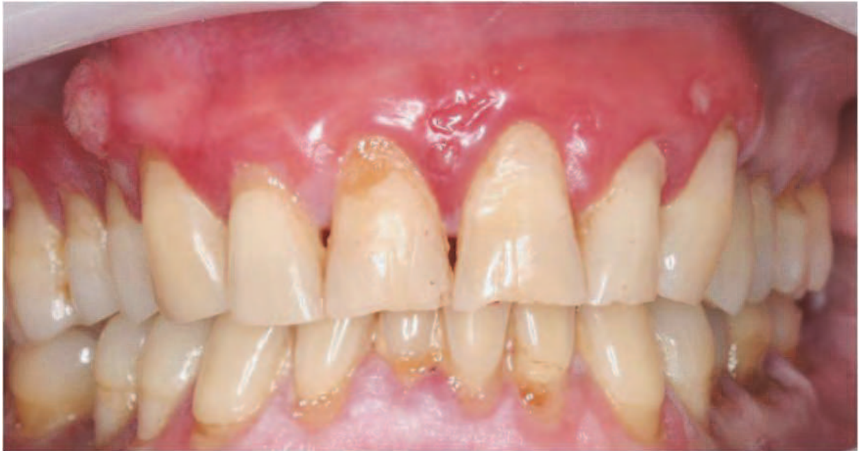
Fig. 2. Erosive formo of lichen planus