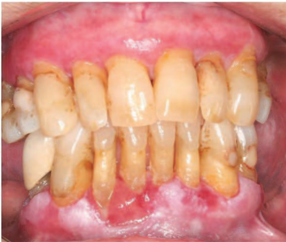
Fig. 8. Pemphigus

In the mouth, the lesions are localized in the gingival tissue and other sites. The blisters are small, fragile and asymptomatic until they burst, when they leave extremely painful and slightly bleeding erosions. The lesions contain non-adherent epithelial cells known as