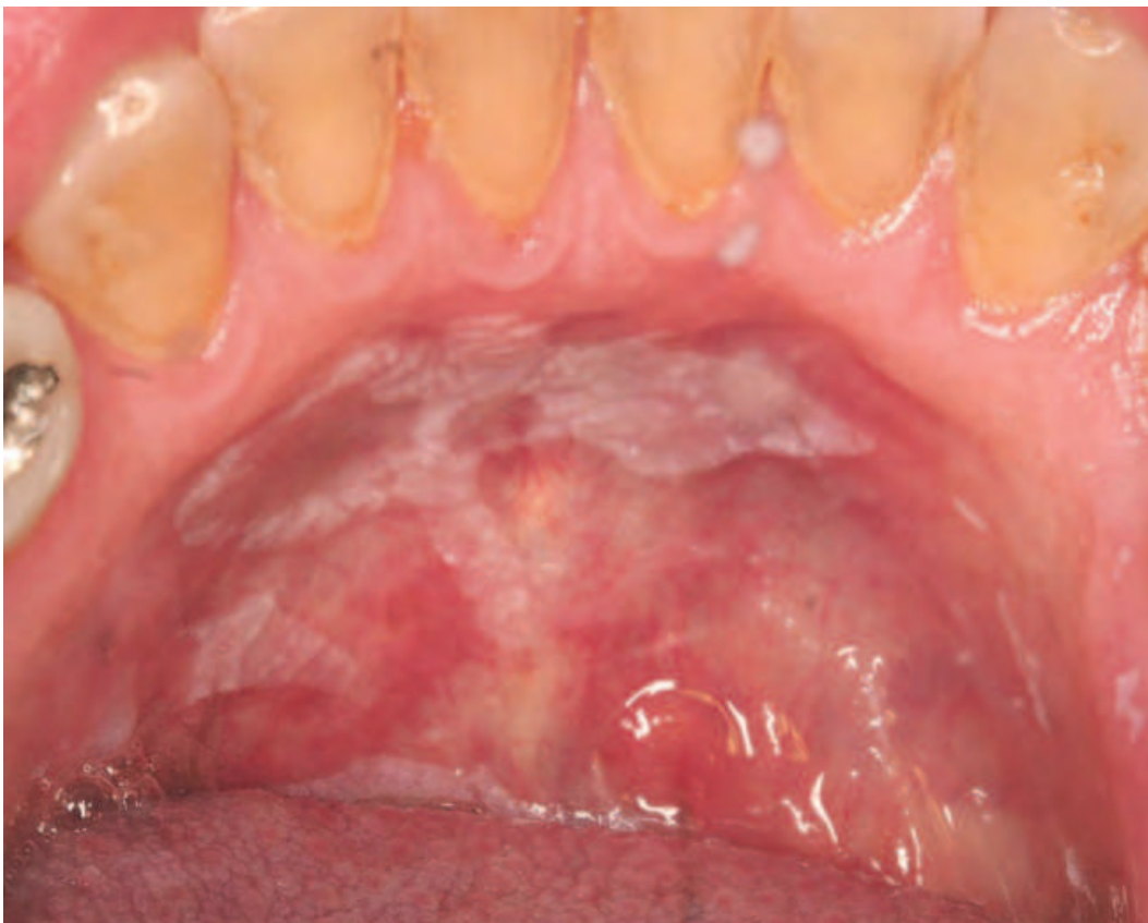
Fig. 1. HIV infection

This infection is readily diagnosed from the intense associated pain and unilateral lesions, which generally heal after 1-2 weeks. (Figure 1)