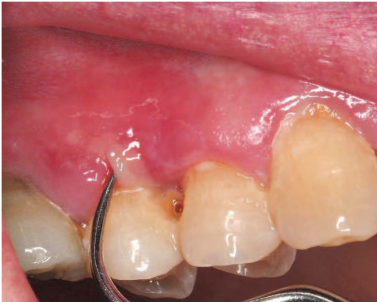
Fig. 6. Pemphigoid

Pemphigoid is a group of disorders in which antibodies against the basal membrane components cause the epithelium to detach from the adjacent connective tissue. This condition normally appears in women over 50 years of age. It mainly affects the skin but can also affect the oral mucosa. Oral manifestations are almost inevitable, and the mouth is frequently the first affected site. The course of the disease is slow and progressive. Oral lesions (blisters) can be found in gingival tissue, buccal mucosa, and palate. These remain intact for the first 24-48 hours but finally burst, producing pain and stinging. ( Nickolsky positive ) Extraoral lesions on other sites are less common, although symblepharons are found on ocular mucosa and can lead to blindness if left untreated. (Figure 6)