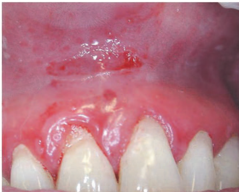
Fig. 3. Atrophic-erosive Lichen planus

Oral lichen planus is usually diagnosed by clinical and histological examinations, although the clinical appearance alone can suffice in classical lesions (bilateral white striae in cheek mucosa). The differential diagnosis includes lichenoid reactions to drugs or dental materials, leukoplakia, lupus erythematosus, and graft vs. host disease in bone marrow transplantation patients. Desquamative gingivitis may also be mistaken for pemphigus, pemphigoid, dermatitis herpetiformis, or linear IgA disease. Therefore, complementary examinations are essential in all cases to diagnose or rule out malignancy (Canto et al 2010).(Figure 4,5)