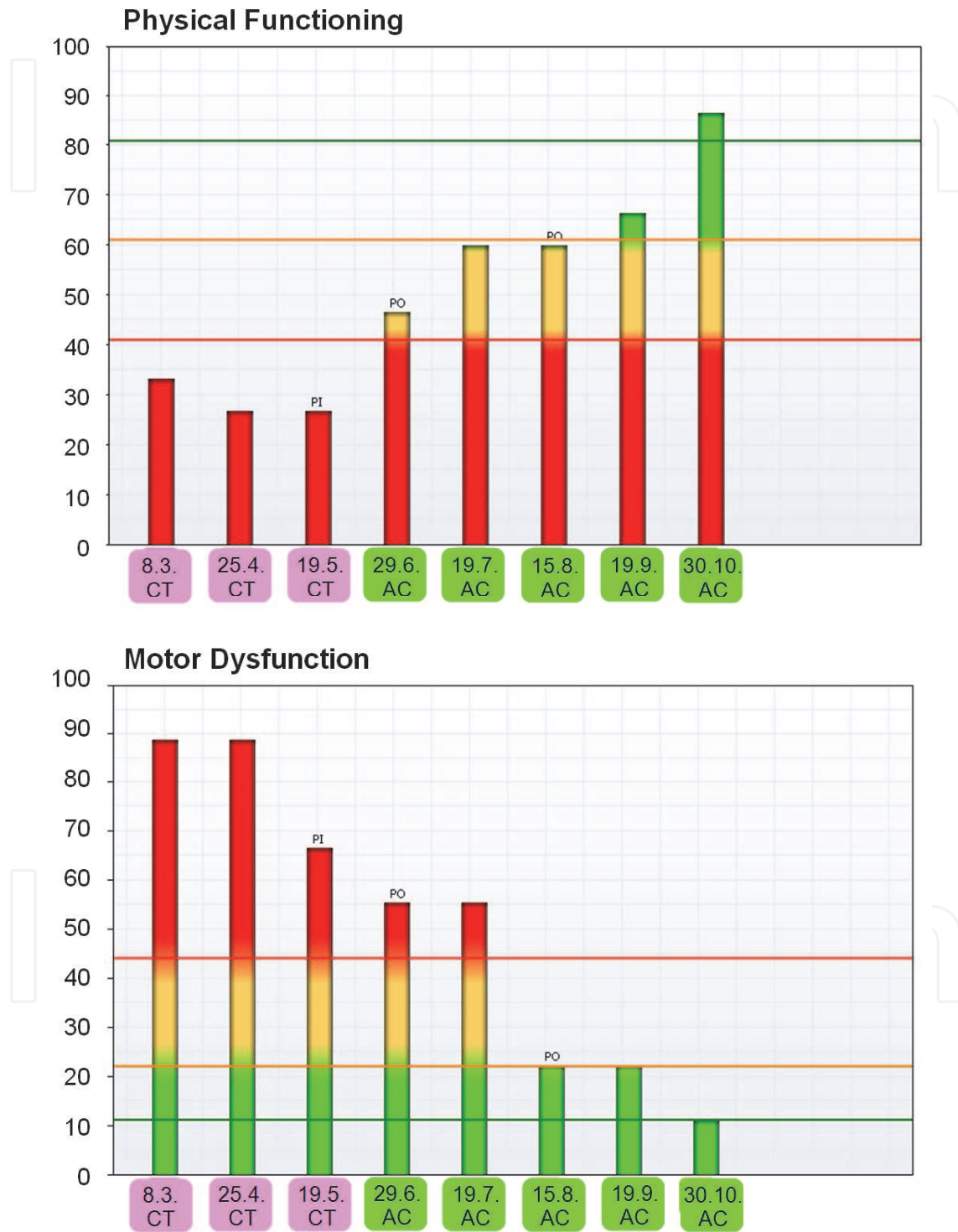
Fig. 1. Course of Physical Functioning (QLQ-C30) and Motor Dysfunction (QLQ-BN20) in a patient diagnosed with astrocytoma during chemotherapy and aftercare.

these score ranges. Below each bar assessment date and abbreviation of treatment phase (chemotherapy (CT) and aftercare (AC)) is noted. Abbreviations on top of bars indicate specific interventions (pain intervention (PI) and psychooncological treatment (PO)).