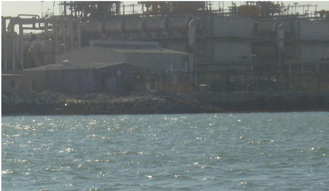
Fig. 4. Sitra Power and Water Station.

Bahrain, like most of the Arabian Gulf countries, depends mainly on desalination seawater as a source of potable water. In Bahrain, there are currently four major desalination plants producing fresh water and energy (Zainal et al., 2008). Sitra Power and Water Station (SPWS) is the largest plant in Bahrain (Fig. 4) with a capacity of 125 megawatts of electrical power and around 100 \times 10^6 L day -1 of desalinated water using multi-stage flash technology (Khalaf & Redha, 2001).