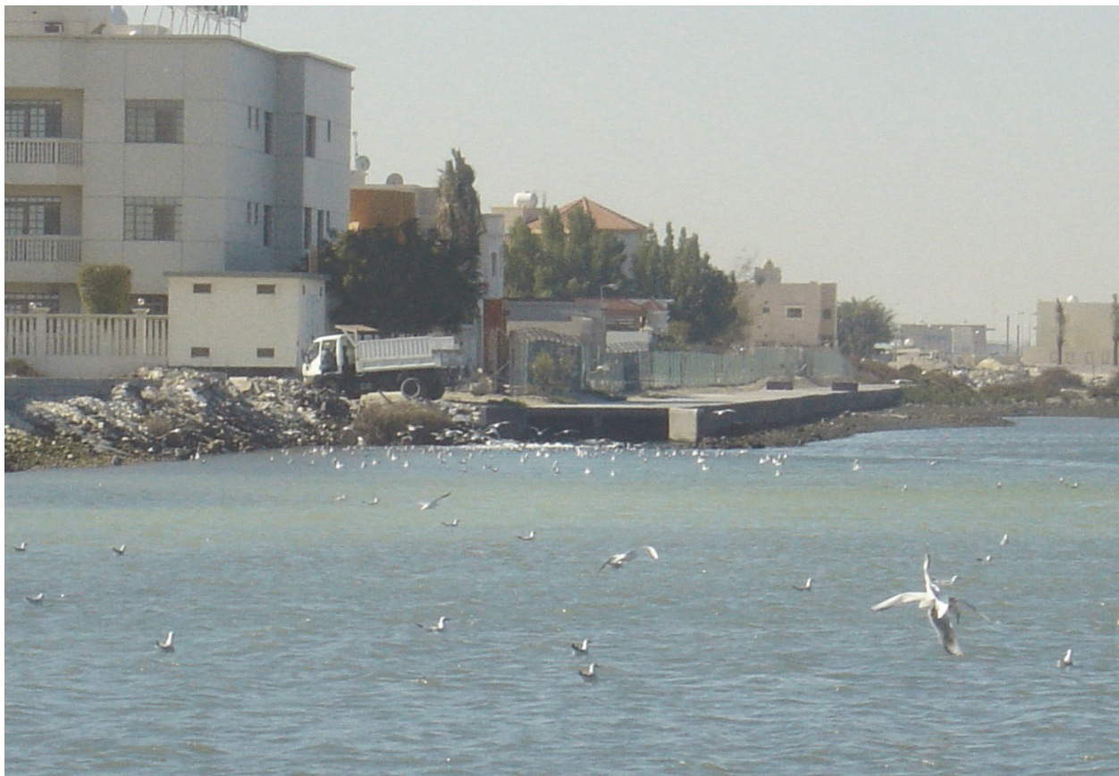
Fig. 3. The outfall of Tubli Water Pollution Control Centre, the main sewage treatment plant in Bahrain.

Sewage effluents are major sources of coastal pollution in Bahrain. Several sewage treatment plants varying in size and degree of treatment are discharging effluents to the coastal and subtidal areas in Bahrain. The main one is Tubli Water Pollution Control Centre (TWPCC), which discharges around 160,000 m 3 day -1 of treated effluents into the shallow water of Tubli Bay (Fig. 3). These effluents are characterized by high-suspended solid reaching up to 290 FTU. Seawaters adjacent the TWPCC are distinguished by high load of nutrients such as ammonia, nitrate and phosphate with concentrations reaching 1.40, 0.90, and 3.60 mg l -1 respectively. In particular, phosphate largely exceeded the maximum value of 2.0 mg l -1 recommended in the Bahraini effluent standards (Naser, 2010a).