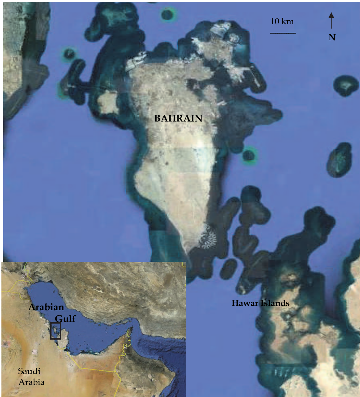
Fig. 1. Maps showing the Arabian Gulf and Bahrain (Google-Earth).

particularly in south of Bahrain, where salinity could reach 70 - 80 psu in areas with restricted water flow such as tidal pools and lagoons (Al-Zayani, 2003).