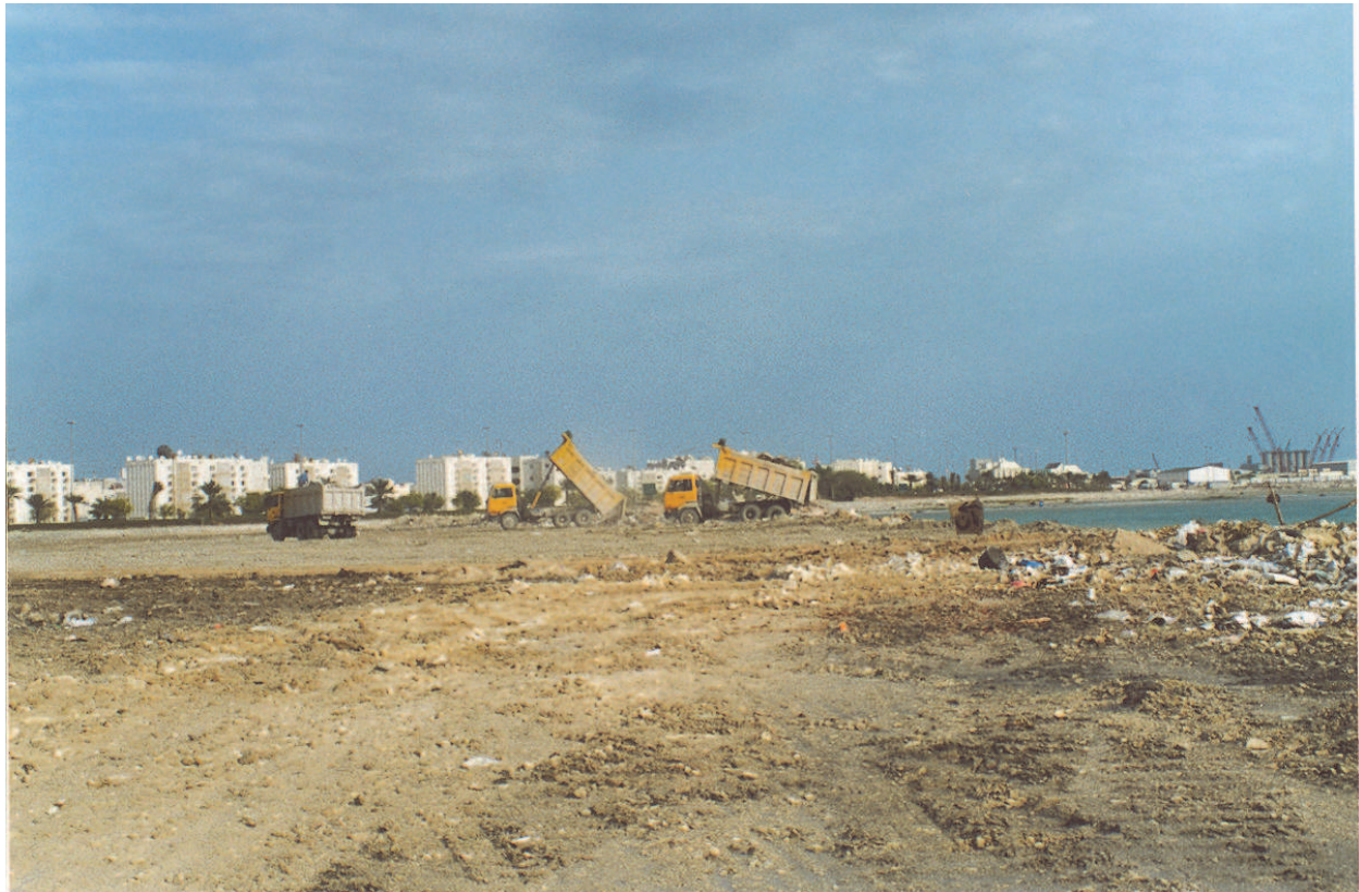
Fig. 2. Reclamation of sandy and muddy coasts of Tubli Bay.

direct removal and burial of macrobenthic assemblages in the coastal and marine environments. Therefore, biodiversity and abundance of macrobenthos are severely affected by mortality and smothering associated with dredging and reclamation activities.