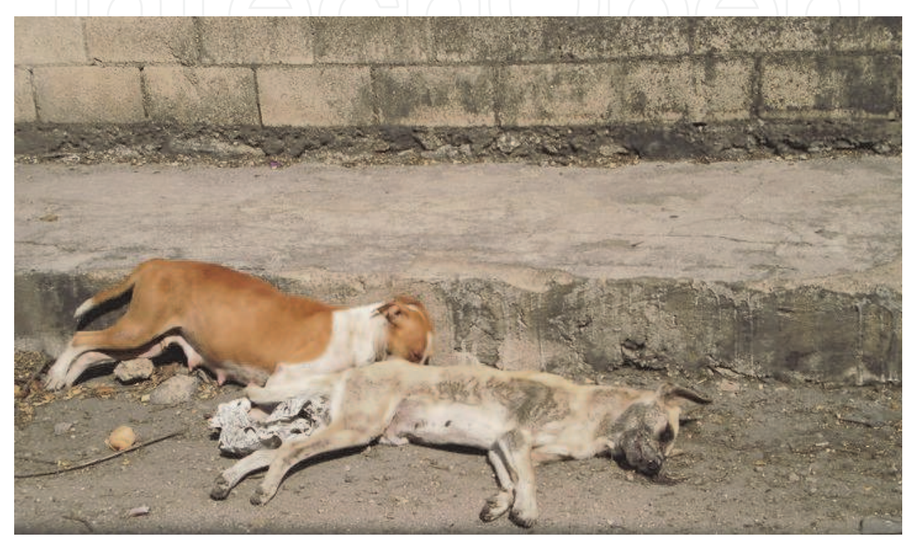
Fig. 5. Stray dogs poisoned during a municipal campaign

risk factors of disease, preventive disease and maximizing production. Production goals in companion animals would be an acceptable level of welfare and considerations of the incidence and prevalence of clinical and behavioral disease (Hurley, 2004). The implement of the shelter medicine in two Italian shelters (where laws do not currently allow euthanasia as a suitable method to control shelter population or used for scientific purposes) during three years and without admission of new dogs "closed system" resulted in improved dog health and welfare, as indicated by the significant reduction in both the prevalence and incidence of major pathologies during the next two years (Dalla Villa et al., 2008).