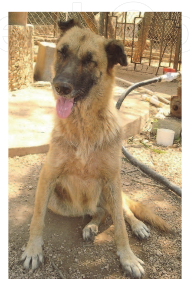
Fig. 4. A dog from a shelter considered for euthanasia

of public on animal welfare issues and subsidizing spay neuter programs, the number of unwanted dogs have decreased but after almost a decade, no changes in the euthanasia rate of dogs (3.7/1000 residents/year) have been observed indicating that the shelters dynamics of dogs appeared to reached an equilibrium with respect to euthanasia (Morris et al., 2011). A model suggests that the balance between supply and demand for dogs can be achieved such that euthanasia is never required (Frank, 2004).