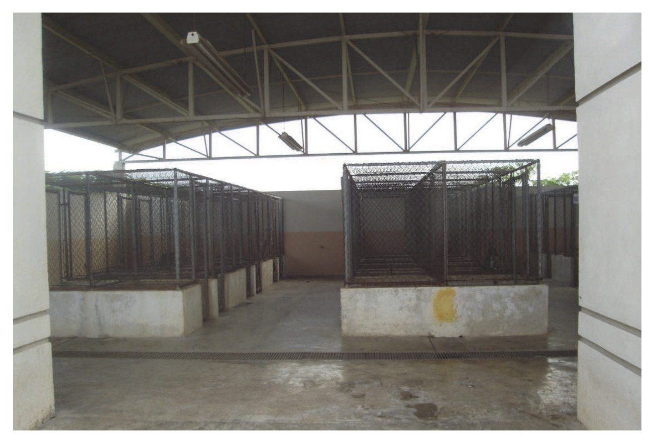
Fig. 2. A municipal dog pound building

An example of dog pound facilities is shown in Figure 2. Dog are protected for 3-10 days to give them the opportunity to be re-homed to their original owners or being adopted. However in dog pound, very few dogs are claimed and the adoption rate is very low or practically non-existing. Under these situation an overflow of dogs rapidly occurs and the quickest way to obtain space is by eliminate them by "strategic euthanasia". Since practically all dogs are euthanized, no moral conflicts arise by selecting candidates.