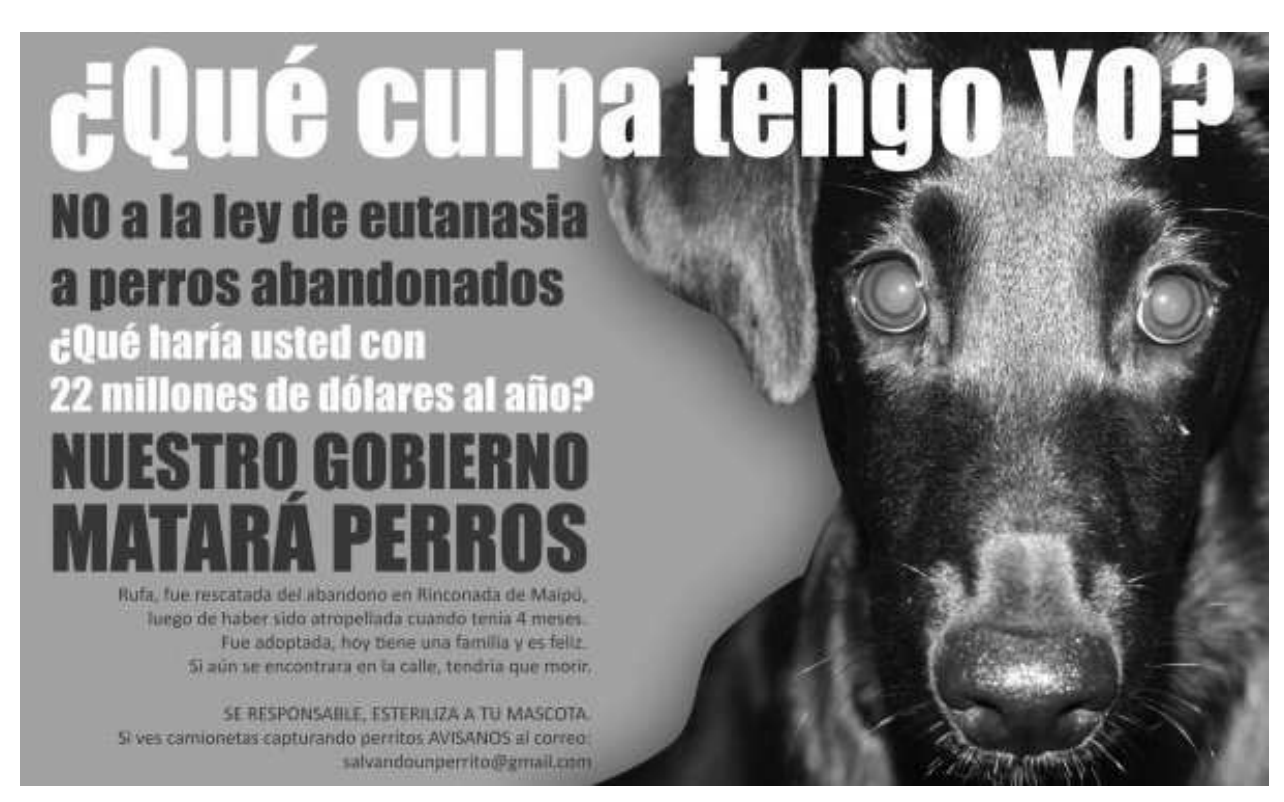
Fig. 6. Signal of protest against the decision of killing dogs in the city of Neuquen, Argentina. From the text "Why is my fault? No to the euthanasia law against stray dogs. What would you do with 22 millions of dollars a year? Our government will kill dogs" (available at: www.taringa.net/posts/solidaridad/6490679/Firma-el-petitorio-en-repudio-a-la-matanza-en-Neuquen_.html)