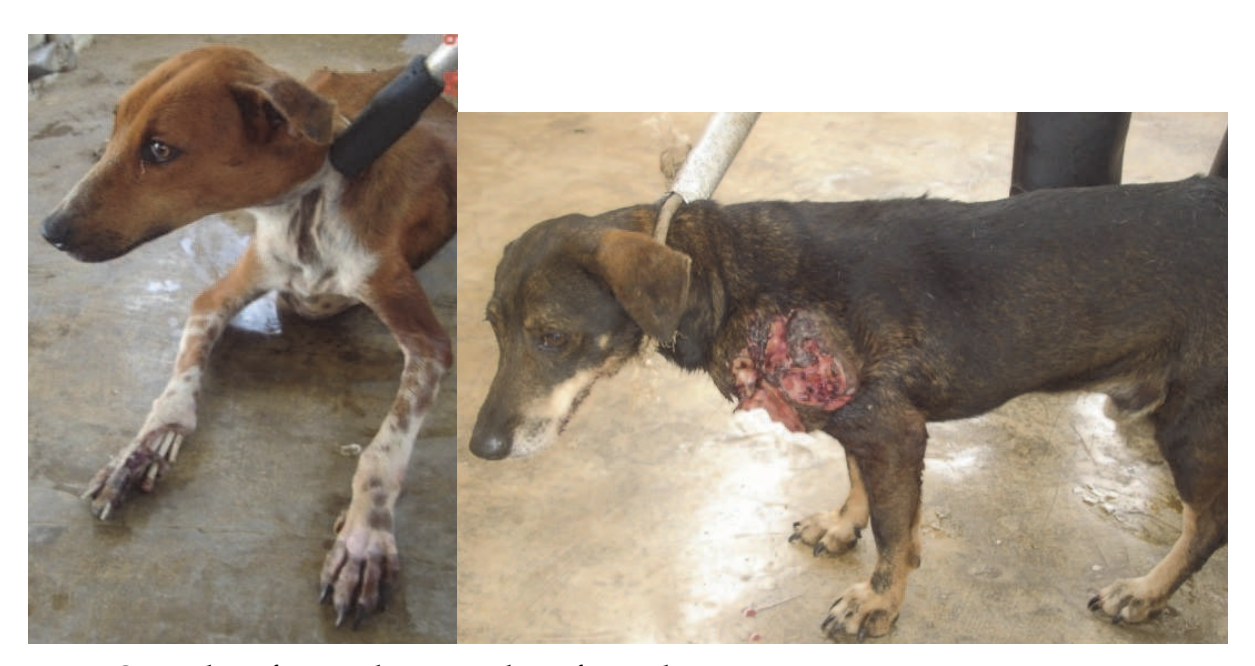
Fig. 3. Stray dogs from a dog pound apt for euthanasia

should be focus on preventing these problems by public education including the supervision of breeding, management of behavioral problems and promoting the culture of adoption. In Barcelona Spain, with the formulation of a city Plan for Pet Animals, the activities were redirected, concentrating on services within the city limits and stimulating adoption. Participation of both professional and humane organizations was sought, premises were renovated, responsible ownership of animals was promoted, controlled urban colonies of cats were established, and adoptions become the cornerstone of policy, centering the activity of the pounds toward its clients. Changes in the dog pound's activity since 1998 reflects a clear decrease in the number of animals retained, as well as in the proportion subjected to euthanasia (from 83.4% of euthanasias of animals entered in 1993 to 47.2% in 2001). This decrease may reflect an improvement in the problem of stray animals. Besides, these developments have also resulted in a positive change in the relationship with the media and animal welfare organizations (Peracho et al., 2003).