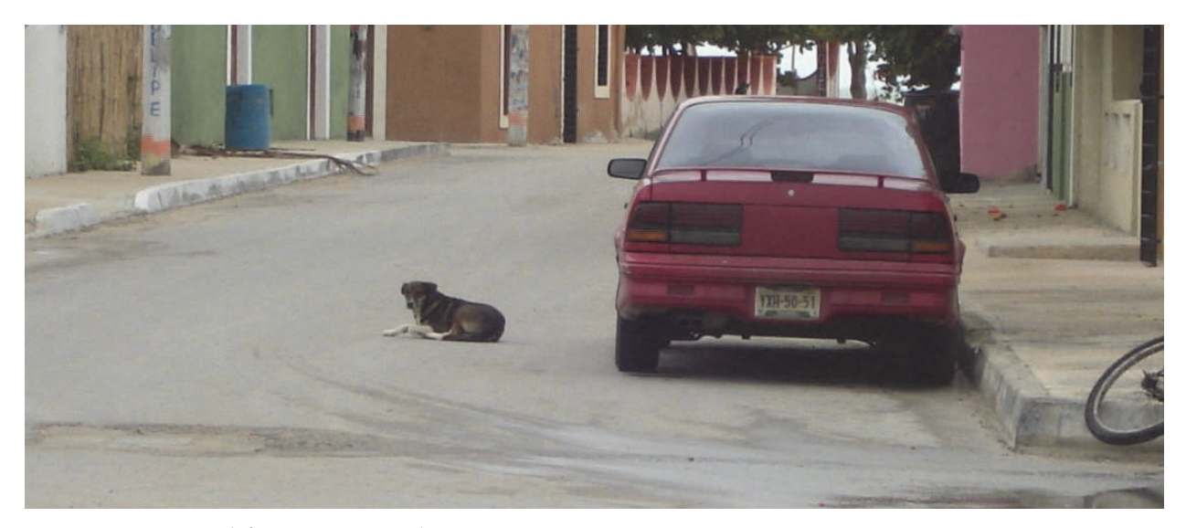
Fig. 1. An owned free roaming dog in a city

the population of owned dogs. Of the dogs that died in this model (6.2 million), over a third (2.4 million) died in shelters (Patronek & Rowan, 1995).