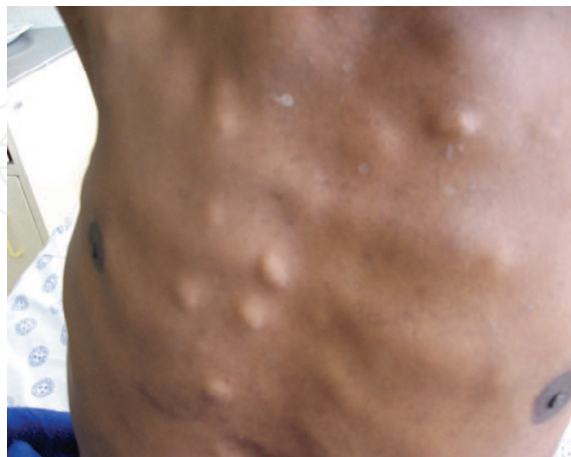
Fig. 1. Shows disseminate subcutaneous cysticercosis

Therefore it should give with extreme caution. (Foyaca-Sibat & Ibañez-Valdés, 2006). In epileptic patients due to disseminate cysticercosis with cardiac involvement, cysticidal drugs should be used with caution because the risk of associate cardiac dysfunction; presence of subcutaneous cysticercosis may help suspecting that condition. (See figure 1)