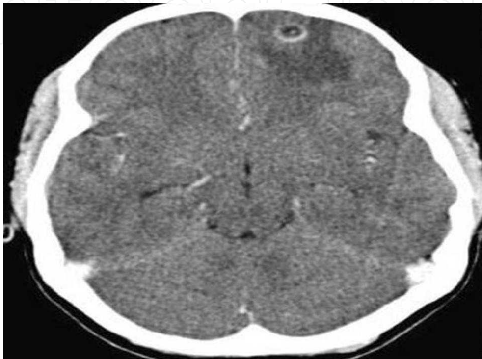
Fig. 4. CT scans of the brain show SSECTL on the left frontal lobe with perilesional oedema

In our experience most of epileptic patients with active NC respond very well to first course of PZQ (two weeks) or ABZ (one week) if they have less than 10 cystic lesions (sometimes less than 20) in the parenchyma tissue (Foyaca-Sibat & Ibañez-Valdés, 2002). Single small enhancing computer tomography lesions (SSECTL) of the brain with or without peripheral edema, as a solitary cysticercus granuloma can be a benign form of parenchymal neurocysticercosis (P-NC) and it is considered to be the most common etiology for SSECTL. (See figure 4)