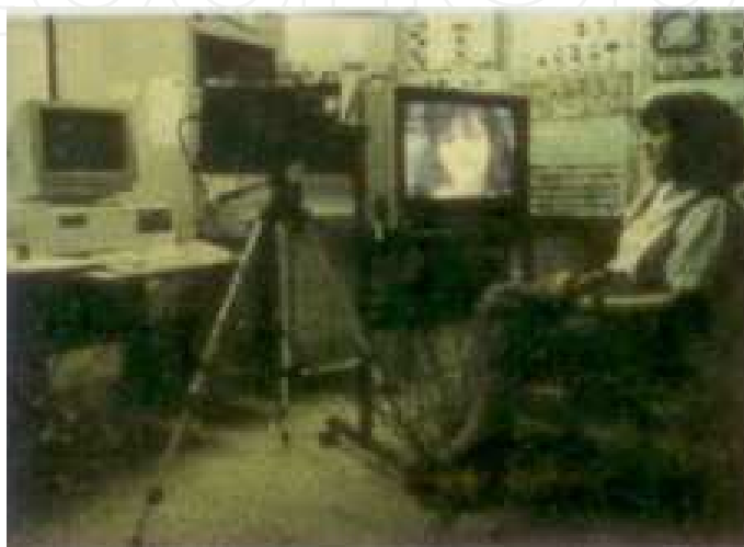
Fig. 4. Experimental Model: Simulated Public Speaking Test

One important example of such procedures is described in the study by McNair and colleagues (1982), who developed a clinical-experimental model of anxiety named Simulated Public Speaking Test (SPST), later modified by Guimarães, Zuardi, and Graeff (1987). The test, initially used to measure the anxiolytic effects of diazepam, consists of asking the subject to prepare a speech and present it in front of a video camera that records his performance (see Figure 4).