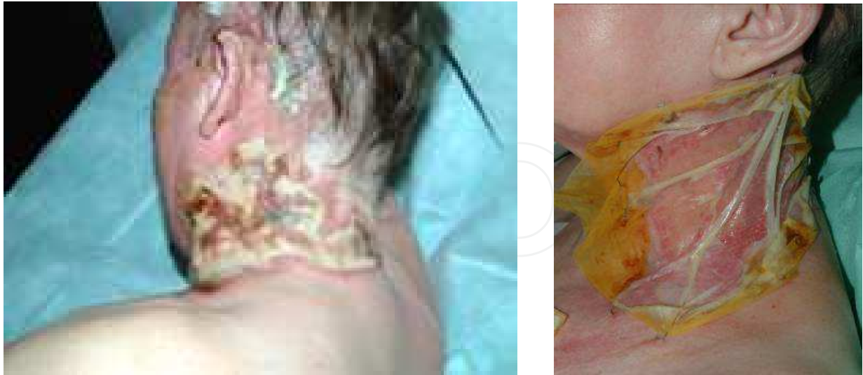
A: Burn wound before treatment