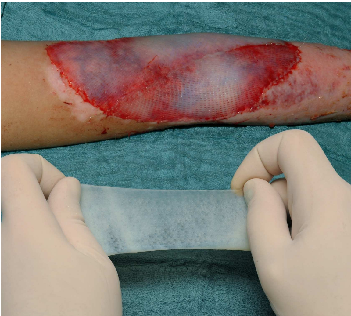
Fig. 2. Example of Glyaderm

This novel dermal substitute is called Glyaderm, which is an abbreviation for Glycerol-preserved Acellular Dermis. Before application of Glyaderm, the wound bed must show viable granulation tissue. In most cases, woundbed preparation with allogeneic donor skin is needed; in burns this takes about 7 days after debridement. Glyaderm is preserved in