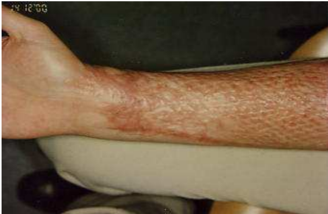
Fig. 1. Typical scar formation results after sandwich grafting, the mesh of the autologous skin graft pattern is still visible.