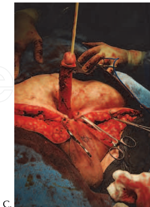
Fig. 3. C: The male escutcheon is reestablished.