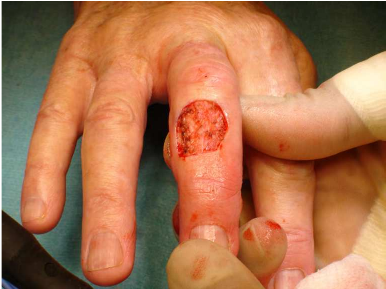
Fig. 9. Recipient 'bed' on dorsum of finger. Ensure meticulous hemostasis is achieved prior to graft

controlling small bleeding vessels. Hematomas and seromas prevent contact of the graft to the bed and inhibit revascularization. They act as a block to link-up of the outgrowing capillaries. They must be drained by day 3 to facilitate graft survival.