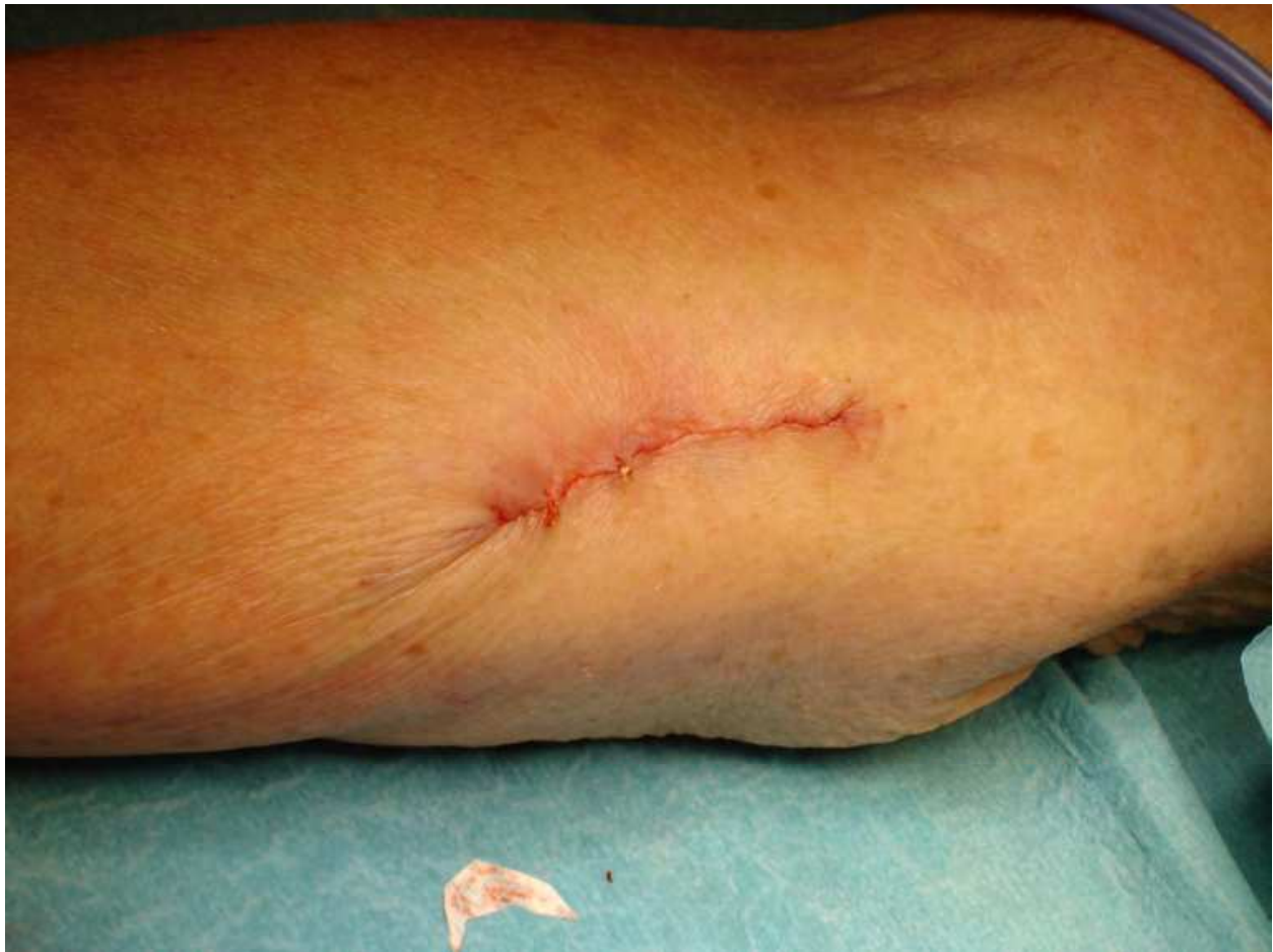
Fig. 4. Closure of medial forearm full thickness skin donor area

The graft may be further defatted, as fat is poorly vascularized and will prevent firm adherence between the graft dermis and the recipient bed. All yellow fat must be trimmed using a pair of sharp scissors until only the shiny white undersurface of the dermis is visible.