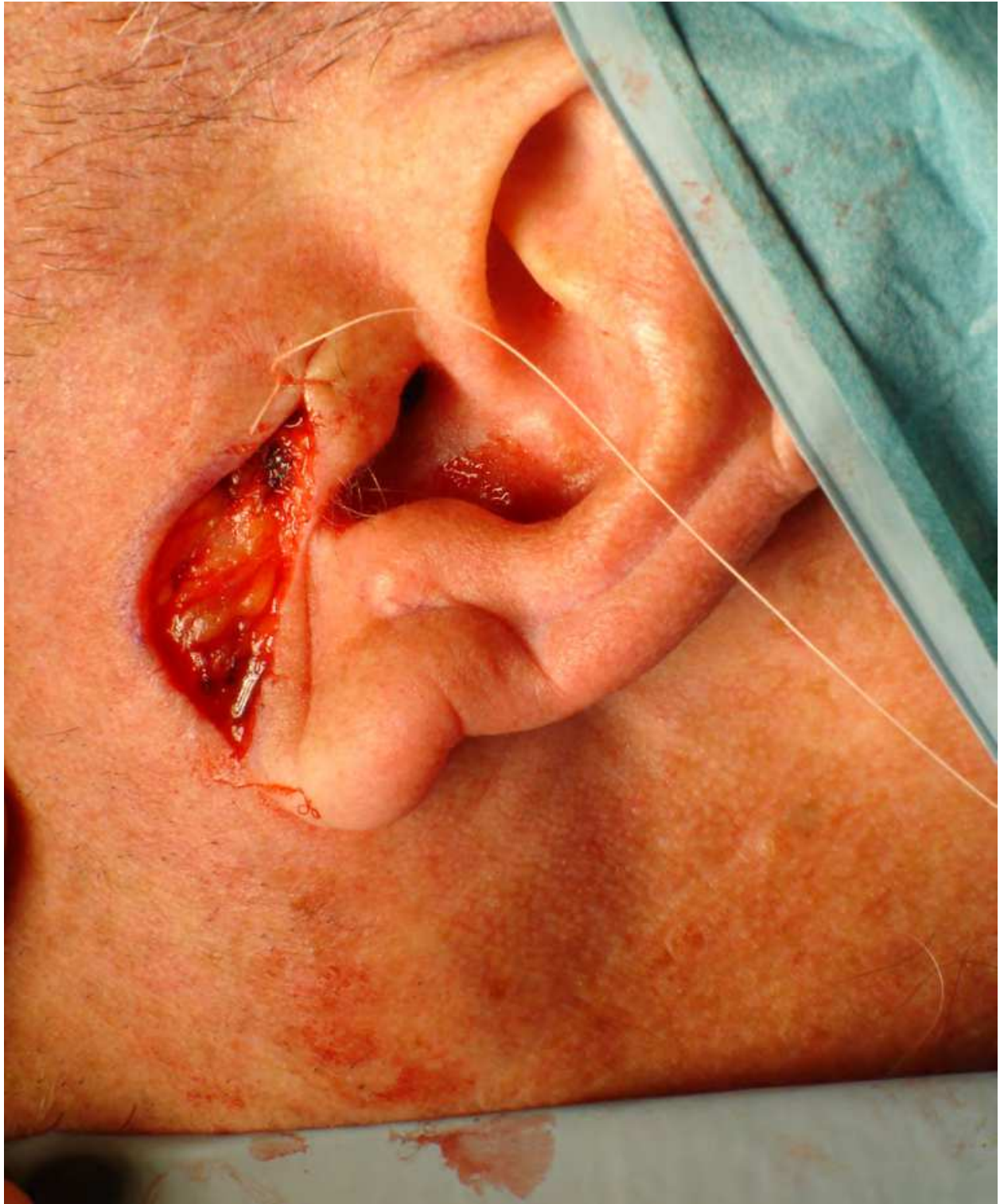
Fig. 1. Pre-auricular full thickness skin donor area. Vicryl rapide suture can be seen at the superior aspect of the ellipse to close wound