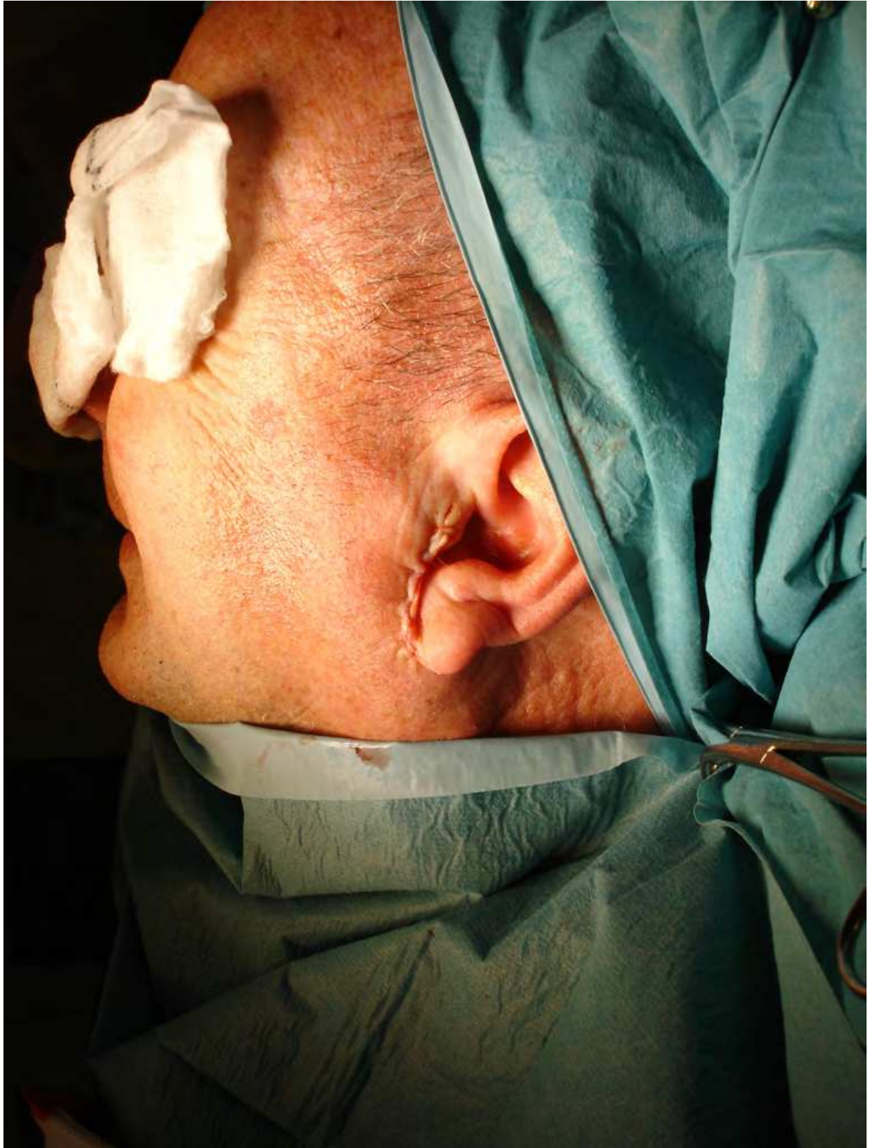
Fig. 3. Closure of pre-auricular full thickness skin donor area