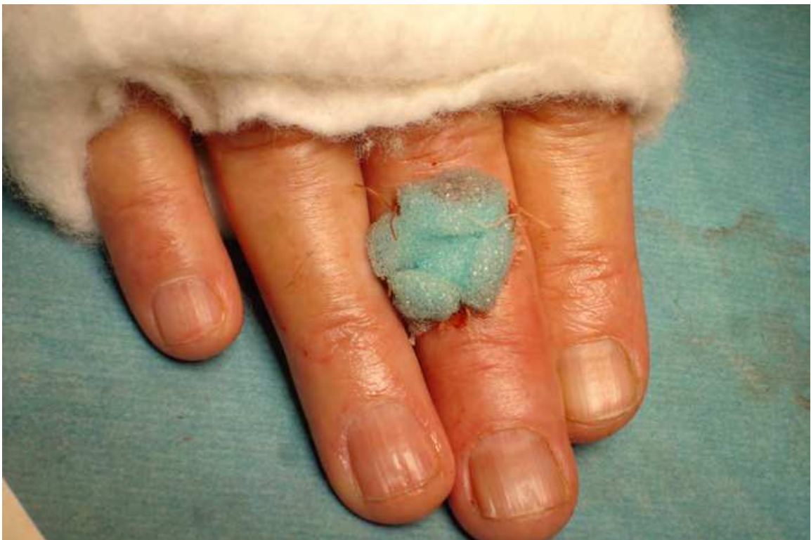
Fig. 8. Foam bolster dressing secured with sutures over full-thickness skin graft on dorsum of finger