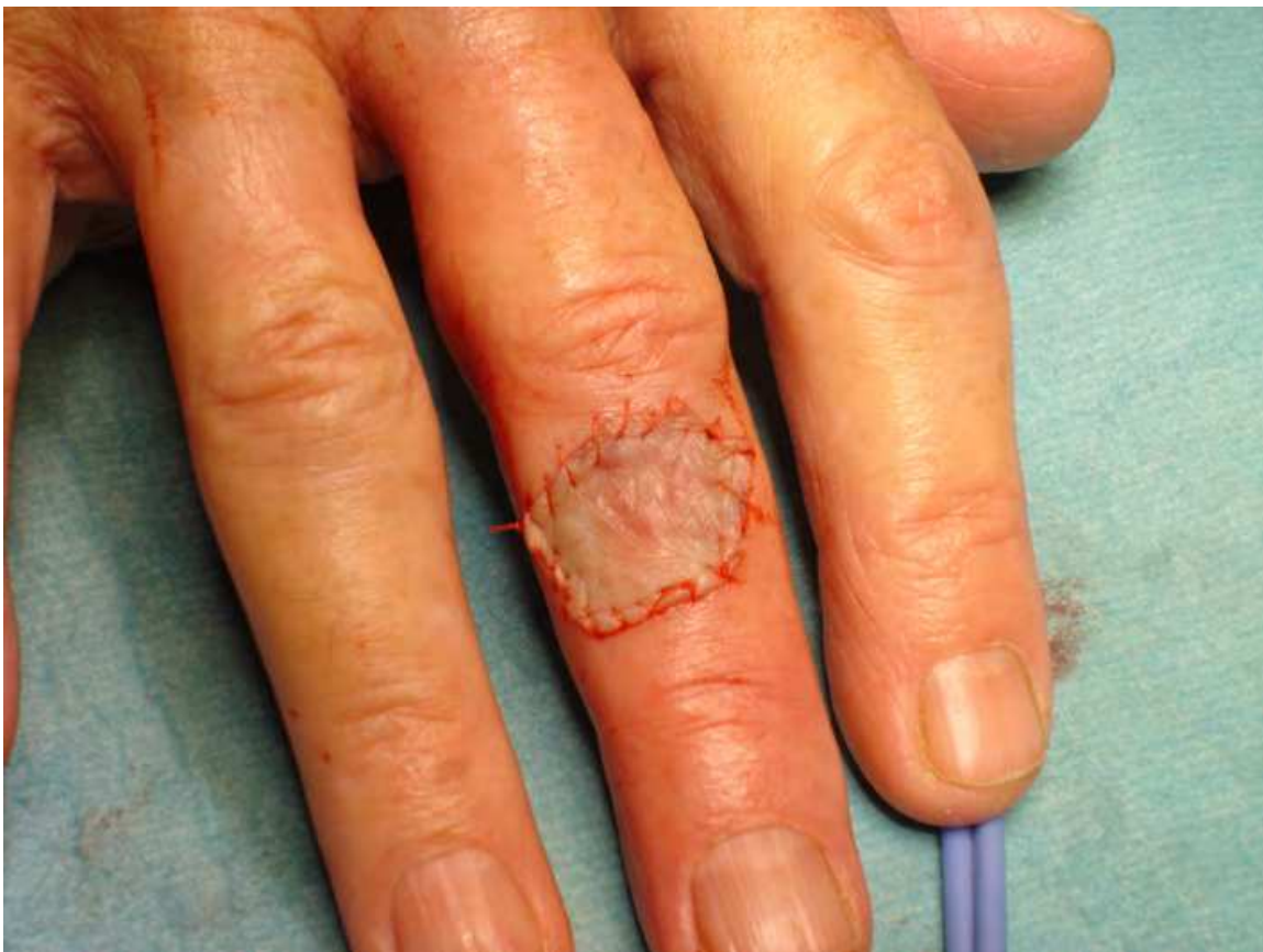
Fig. 6. Full thickness skin graft inset onto dorsum of finger