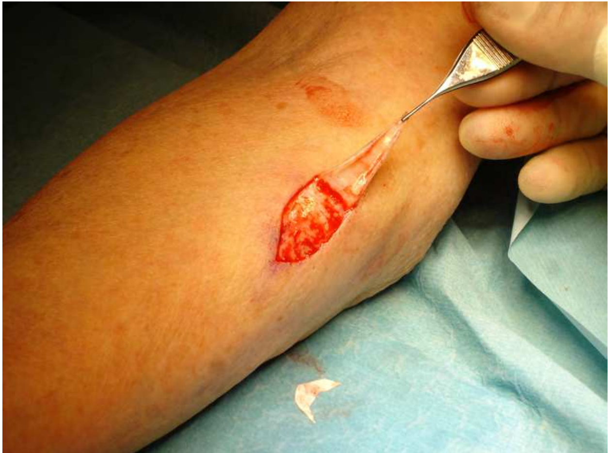
Fig. 2. Full-thickness skin graft harvest from the medial forearm donor area. Note the shiny undersurface of the graft dermis

resulting scar lies in the direction of the natural skin crease lines (Langer's lines). The graft is usually harvested with a 15 inch bladed scalpel between the dermis and the subcutaneous fat. Often, the graft is easier to cut if the area is infiltrated with fluid (1:200000 adrenaline). The full thickness skin graft leaves behind no epidermal elements in the donor site from which resurfacing can take place. For this reason, primary closure of the donor site is necessary. This is usually achieved using an absorbable suture in a single layer subcuticular stitch (Figures 3 and 4). Occasionally, a split thickness skin graft may be used to close the donor area.