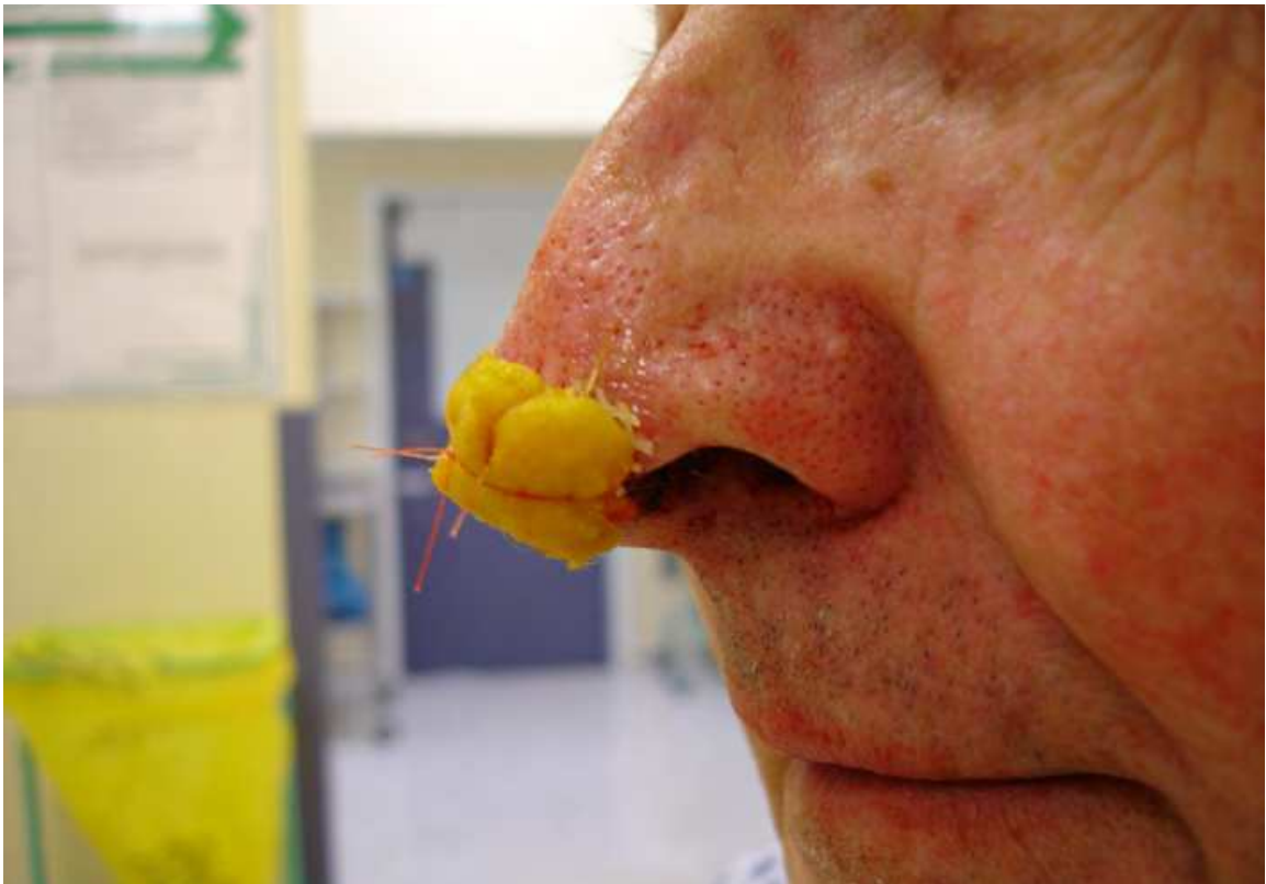
Fig. 7. Tie over dressing secured with sutures over full-thickness skin graft on nose. Note the presence of a non-adherent dressing (jelonet) between the proflavin wool and the graft