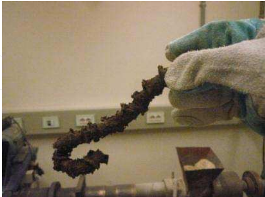
Fig. 5. The final shape of the extrudate

The extrudates (see figure 5) are crushed in the shredder (see figure 6) forming small particles with identical sizes to be fed into the furnace. The shredding operation was important as it avoided bad distribution of the mix during furnace heating within experimentation. As this process at first; during the pilot trials, was done without shredding which resulted in several cases of non homogenous final product. The main reason behind this that the extrudates have different sizes and the material's concentration within each extrudate wasn't distributed the same. Therefore, it was decided to use a shredder.