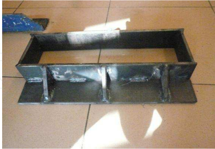
Fig. 8. The custom made die

(see figure 8) to accommodate the size required for the ASTM D 4761 test of flexural test. A sample obtained after pressing is show in figure 10.