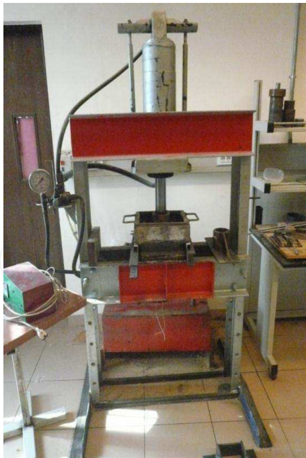
Fig. 9. The hydraulic press used

The required thickness is obtained via right weight selection for the mix and adjusted using thickness cutter.