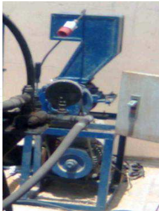
Fig. 6. The shredder adopted in crushing the extrudates