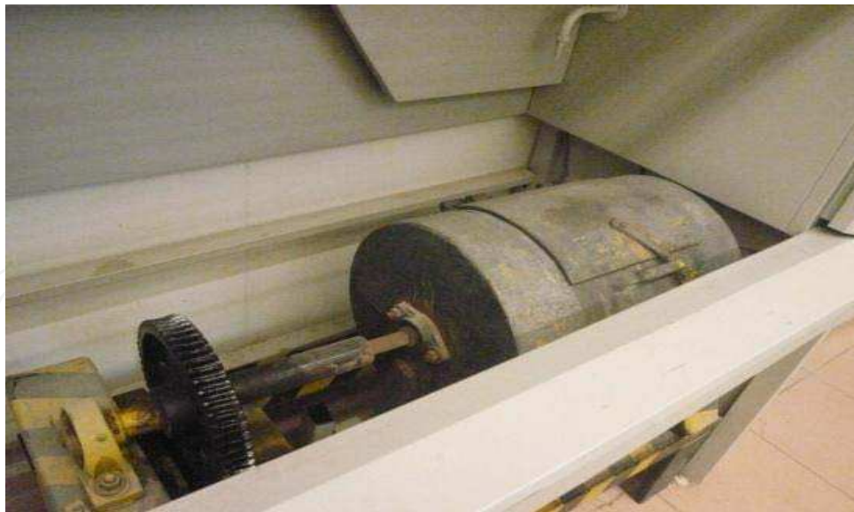
Fig. 7. The furnace used for heating the shredded particles to form a paste

The furnace works for about 15 min at 140 C to form a paste which is then taken to be pressed (see figure 7). The temperature was decided based on pilot trials aimed at forming a homogenous paste without burning.