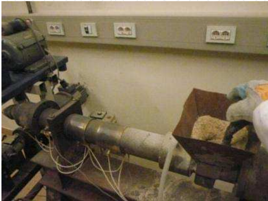
Fig. 3. Feeding the extruder with the mixture

Before feeding the extruder (single screw extruder), the plastic is mixed; using a mixer, with wood waste and talc (if any). The plastic used; which is composed of a mix of HDPE and LDPE with 25 % and 75 % respectively, has the shape of small particles. This mix is composed of shredded plastic waste obtained mainly from garbage plastic bags which are highly contaminated. The talc is used as a mineral additive; to enhance mechanical properties, with percentages varying from 0 to 35 percent by weight of the total. The mix is then being fed into the hopper of the extruder and the process starts as shown in figure 3.