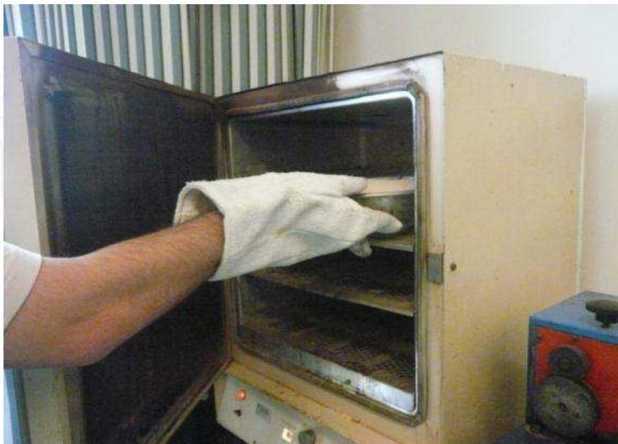
Fig. 2. Oven used to dry waste wood

The dryer used was set at 115 C to avoid wood waste burning. The meshed wood waste is left for 4 hours in the dryer to get rid of the moisture (see figure 2). It was assured that the moisture was totally eliminated through a test that was done. The test consisted of taking two samples of wood waste; sizes of up to 0.5mm and 1.18mm, utilized within experiments and weighs it through a calibrated scale. Then, it was left in the dryer for 2 hours then weighed. Each hour after the second hour, it was weighed. At the 5th and 6th hour the weight was not changed for the two types. Therefore, it was concluded that 4 hours was sufficient to dry the meshed wood waste. The experiment was repeated 3 times to guarantee the results.