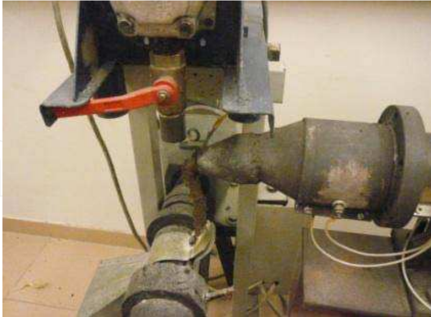
Fig. 4. The hot extrudates coming out of the extruder