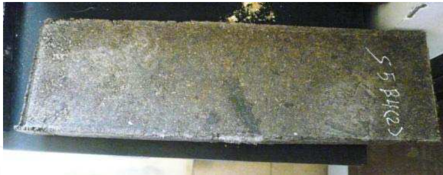
Fig. 10. The sample obtained after pressing