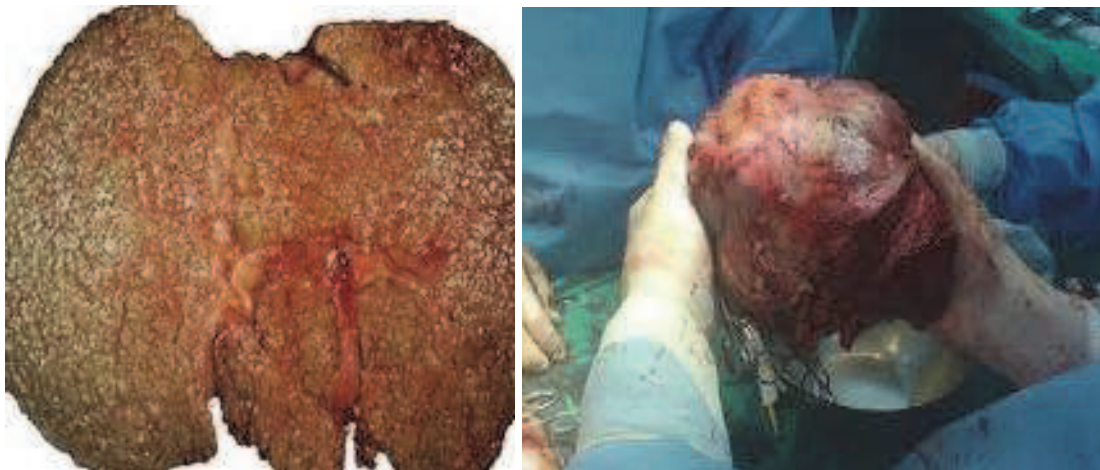
Fig. 3. Liver Cirrhosis and Hepatocellular Carcinoma Illustrations.

biopsy preparation but there is still lack of evidence. The only thing is that really matters are anticoagulant use and hemostase examination. Sampling error is that something that could happened because we only use small needle and probably we could only assess small area of the liver tissue even though we have the preconditions for liver tissue sampling so it can be assessed very well by the pathologist. However, until now liver biopsy is still a gold standard to obtain information about what happened in the progression of liver diseases and of course to see the improvement of liver histology after the patients received treatment. In Advanced liver disease, we have clinical (chronic liver disease stigmata such as icteric, spider nevi, hyper pigmentation, palmar erythema, splenomegaly, ascites, caput Medusa, and leg edema), biochemical parameters (low platelet count, albumin globulin ratio, hyperbilirubinemia, abnormal hemostase, etc), and imaging studies (ultrasound, CT-scan, MRI) to confirm the diagnosis so we don't have to perform any liver biopsy. (2,3,4,5)