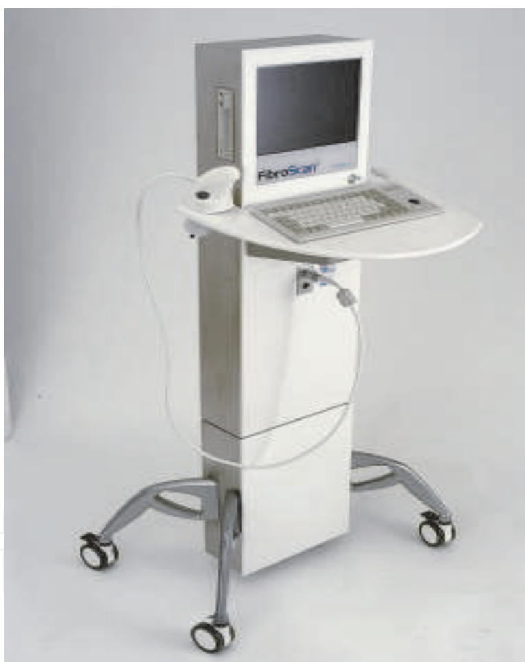
Fig. 4. Fibroscan.

probably is simpler than in CHB patients because in CHB not only the fibrosis is important but also the necroinflammation of the liver. Third, the AUROCs for F2 prediction in CHB which were reported in Asian studies found lower value than it found in Western studies. Beyond this point, study by Chan et al has showed there was a grey area in CHB patients with normal ALT between LSM 6.0-9.0 kPa, where a LSM 5.0-6.0 kPa would indicate insignificant fibrosis, a LSM >9.0 kPa had a high chance of bridging fibrosis, and that >12.0 kPa had a high chance of cirrhosis. It means in this grey zone the liver biopsy might be needed. (24,27,28) The use of TE in liver cirrhosis (LC) patients is still controversies since we have a lot of non-invasive parameters that can be used to diagnose LC. In some special conditions such as hemophilia, aplastic anemia, thrombocytopenia not related to liver disease, etc, TE might be a good consideration when those patients suffered from chronic active hepatitis virus infection (B & C).