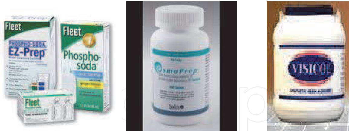
Fig. 4. Sodium phosphate products available in the US: OsmoPrep and Visicol. The aqueous formula is available only as a prescription.

through the kidneys, administer with extreme caution in individuals with renal insufficiency or failure (Atreja, A., Nepal, S. & Lashner, B., 2010). Magnesium citrate is often used as an adjunct to bowel prep. In addition to the PEG solution, adding magnesium citrate to the prep reduces the amount of PEG solution required to 2L. Taken the night before the procedure (one 300 ml bottle of magnesium citrate) plus two bisacodyl tablets and 2L of PEG solution, has shown to be just as effective as taking the full dose of PEG solution. Used alone, magnesium citrate is not an effective bowel cleansing agent prior to colonoscopy procedures. Magnesium citrate is often used as an adjunct to bowel prep (Atreja, A., Nepal, S. & Lashner, B., 2010; Wexner, S., Beck, D., Baron, T., et al., 2006).