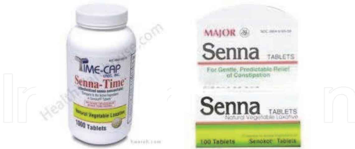
Fig. 8. Senna products