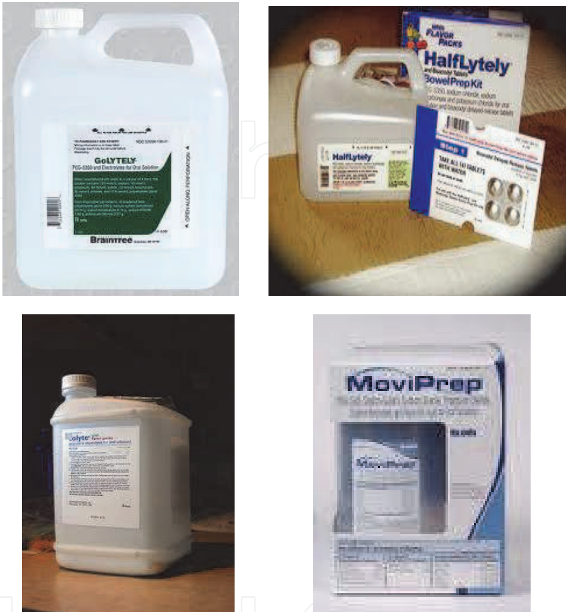
Fig. 3. Several commercially prepared polyethylene glycol solutions: Top left, GoLyteLy; top right, HalfLyteLy. Bottom left, Colyte and bottom right, MoviPrep.