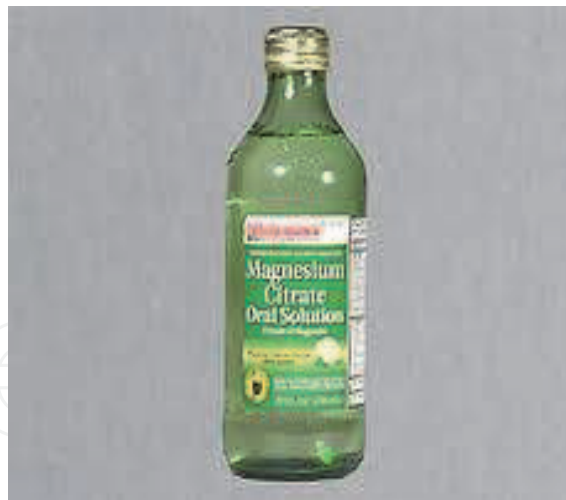
Fig. 5. Magnesium Citrate bottle

through the kidneys, administer with extreme caution in individuals with renal insufficiency or failure (Atreja, A., Nepal, S. & Lashner, B., 2010). Magnesium citrate is often used as an adjunct to bowel prep. In addition to the PEG solution, adding magnesium citrate to the prep reduces the amount of PEG solution required to 2L. Taken the night before the procedure (one 300 ml bottle of magnesium citrate) plus two bisacodyl tablets and 2L of PEG solution, has shown to be just as effective as taking the full dose of PEG solution. Used alone, magnesium citrate is not an effective bowel cleansing agent prior to colonoscopy procedures. Magnesium citrate is often used as an adjunct to bowel prep (Atreja, A., Nepal, S. & Lashner, B., 2010; Wexner, S., Beck, D., Baron, T., et al., 2006).