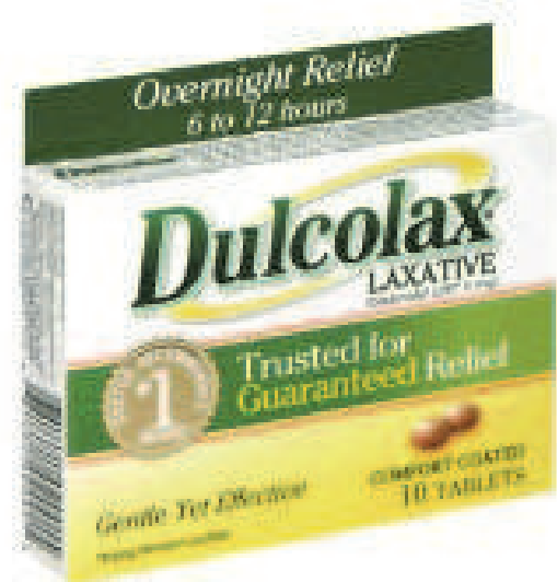
Fig. 6. Dulcolax tablets

Sodium picosulfate is another cathartic with osmotic action on the bowel similar to NaP. It is a saline laxative used in combination with magnesium citrate. An observational study done in Canada by Love and his colleagues found that administration of sodium picosulfate and magnesium citrate yielded a high percentage positive rate for efficacy (Yakut, M., Kubilay, Ç., Gülseren, S. et al., 2010). This preparation is mostly used in Europe and Canada and is not available in the United States (ASGE, 2009).