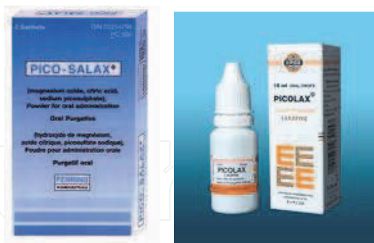
Fig. 7. Sodium picosulfate products. Not available in the US

Sodium picosulfate is another cathartic with osmotic action on the bowel similar to NaP. It is a saline laxative used in combination with magnesium citrate. An observational study done in Canada by Love and his colleagues found that administration of sodium picosulfate and magnesium citrate yielded a high percentage positive rate for efficacy (Yakut, M., Kubilay, Ç., Gülseren, S. et al., 2010). This preparation is mostly used in Europe and Canada and is not available in the United States (ASGE, 2009).