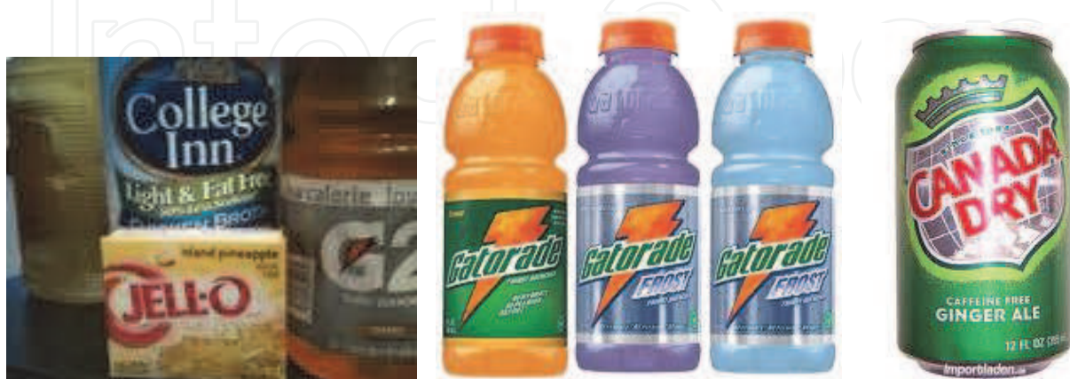
Fig. 9. Varieties of clear liquid: broth, Jello, apple juice or white grape juice, Gatorade, and ginger ale