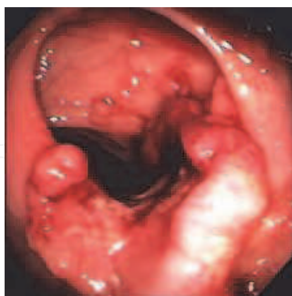
Fig. 1.a Cancerous tumor in the colon

The hardest part of the colonoscopy procedure is the preparation. It usually starts one-to-two weeks prior to the test depending on the recommendation of the physician. Careful planning and strict adherence to these instructions is crucial to the success of the test. Many individuals who have undergone this procedure will attest to the difficulty in complying