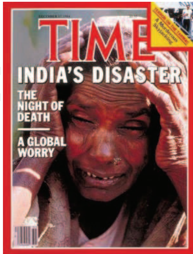
Fig. 1. Bhopal Disaster; cover in Time Magazine