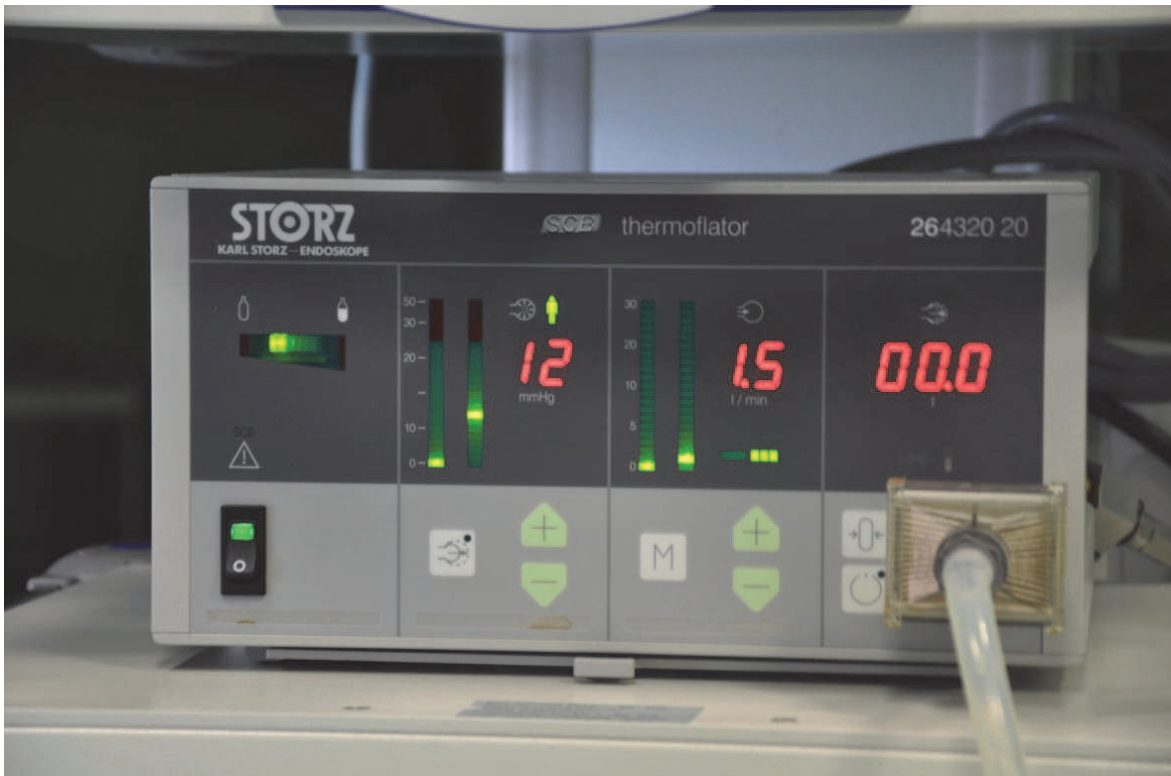
Fig. 1. CO 2 Insufflator showing normal working pressure.

The pneumoperitoneum increases the abdominal pressure, elevates the diaphragm and can compress both small and big blood vessels. The intra-abdominal pressure obtained during these procedures, which is usually 12mmHg (Fig. 1), increases central venous pressure (CVP), heart rate (HR), systemic vascular resistances (SVR) up to a 65%, and the pulmonary vascular resistances can rise up to a 90%. Cardiac output (CO) can increase on a healthy patient in Trendelemburg position, but can also decrease to a 50% on patients in anti-Trendelemburg position or with a low cardiovascular reserve. All those changes are usually well tolerated in healthy patients but it can be different in patients with systemic diseases.