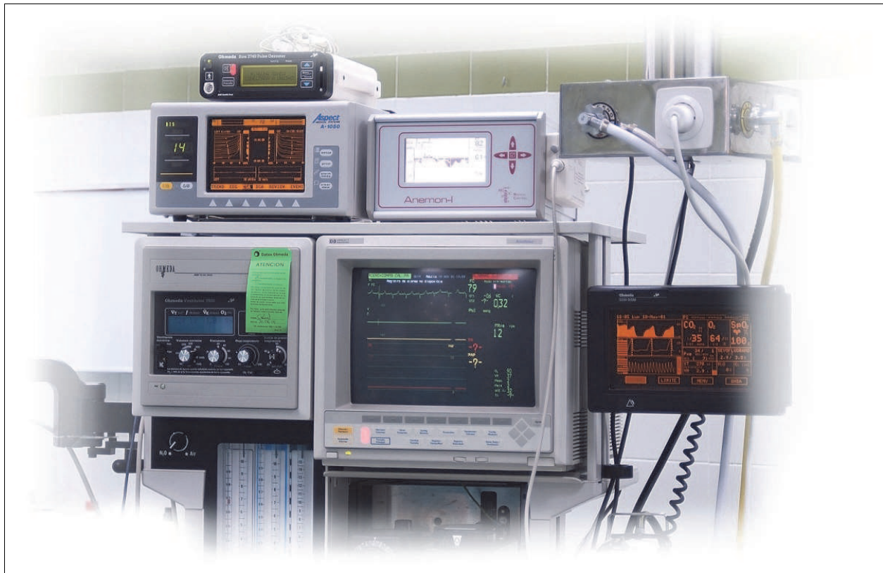
Fig. 2. Anesthetic monitoring during laparoscopic surgery.

Subcutaneous emphysema is always a laparoscopy associated risk. That makes mandatory to examine the patient for emphysema at the cervical, thorax and abdomen areas after surgery. It's also recommended to perform thorax radiography to rule out possible pneumothorax or pneumomediastinum complications.