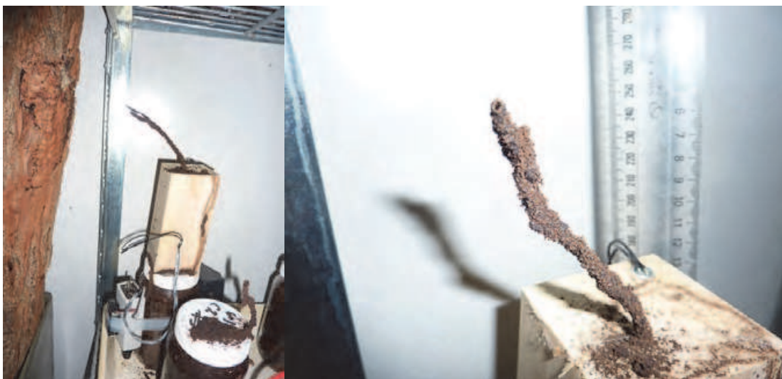
Fig. 1. Coptotermes termite constructing a bridge to reach food source in a laboratory set-up test Jars.

More recently, at an international conference at Arizona State University, USA, (18-20 February 2010), entitled 'Social biomimicry: Insect societies and human design', explored how the collective behaviour and nest architecture of social insects can inspire innovative and effective solutions to human design challenges (Figure 1).