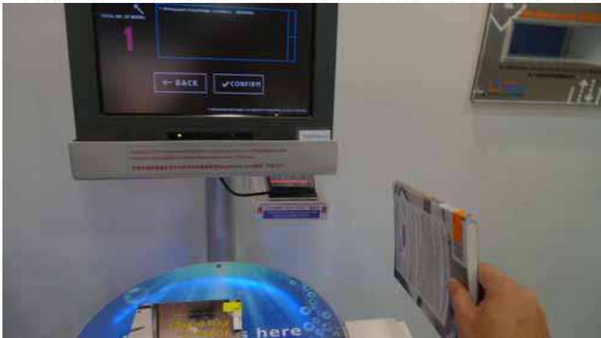
Photo 4. In the pilot test conducted in the CityU HK Library, the UHF RFID reader antenna is laid flat horizontally inside the self-check machines. The radio waves must go far upright to ensure the reading of the maximum number of books. However, the waves are not supposed to go wide to scan the books sideways as well. Any cases like that are misreads and must be rectified. The Project Team thus has made use of metal to provide shielding around the reader antenna and the result is good.

library setup, given the long read range of UHF RFID, it is important that radio waves are confined only to the designated area and distance appropriate for the purposes intended. For example, as discussed earlier, for the self-check machines in the pilot test of the CityU HK Library, the radio waves are expected to go only upright in a distance long enough to allow the most number of tags/ books to be identified in any one go. To ensure that the waves go far but not wide, the Project Team has made use of metal to provide shielding around the reader antenna (Photo 4).