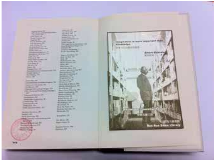
Photo 2. The tags were then covered by a book plate.

inside the machines and they are circularly polarized ones that are supposed to be less orientation sensitive. However, tests conducted by the Project Team reveal that, even with circularly polarized reader antennas, when tags are placed on the book spines and exhibit a perpendicular orientation to the reader antennas, the read rate is far from satisfactory. When books with tags on the book covers are laid flat on the self-check machines and thus sharing the same orientation as the reader antennas, the read rate is much better and the read distance is long. The long read distance enables users to check out more books in any one go 8 and thus capturing the benefits of UHF RFID. (Long read range, however, may generate a concern on misread if the detection area goes beyond the expected one. While the power of the reader antennas can be tuned to adjust the read distance when needed, the Project Team has also put in place a shielding mechanism in the self-check machines to guide the radio waves to go upright instead of sideways so as to safeguard against misread.)