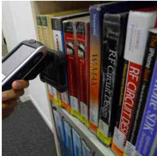
Photo 3. When books are vertically placed on the shelves, tags on the spines share the same orientation as the reader antennas in the handheld scanners while tags on the covers exhibit a perpendicular orientation.

the shelves and the tags on the books too. Smart trolleys and automatic book dispensers are examples of other foreseeable applications that many people have been talking about. Libraries forward-looking enough that will consider adopting these innovative applications in the future may also need to take into consideration the possible requirements of these end-use applications when selecting their tags at the present moment.