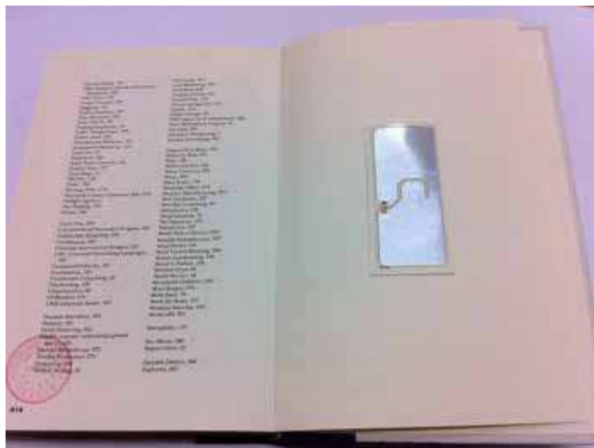
Photo 1. In the pilot test conducted by the CityU HK Library, UHF RFID tags were randomly placed in four different positions at the back covers of the books. The photo shows one of the selected positions.

For the case of the CityU HK Library, the UHF RFID tags that the Project Team has used in its pilot test were of an optimal size with a dimension of 72mm x 30mm. The Semi-Closed Collection where the pilot test was conducted is a very small room of about 75sq.m. only. The self-check machines, the self-return machines and the security detection gates are all in proximity. For instance, the security detection gates are only 4.5 meters away from the nearest bookshelves. Therefore, the Project Team must be even more cautious when choosing the tags. Different tests have been performed to ensure that the size of the buffer zone required around the detection gates is kept to a minimum and at the same time the self-check machines can read the most number of tags when books are placed on top of them so as to maximize the benefit of multiple item identification at the check-out process. In the Semi-Closed Collection, the UHF RFID tags have been placed at the back covers of books with a book plate of 150mm x 100mm on top to act as a camouflage to hide the tags from the scene (Photos 1 and 2). To reduce the tag masking probability, during the tagging process, tags have been randomly placed in four different positions behind the book plates. However, the additional book plates mean additional costs and labour.