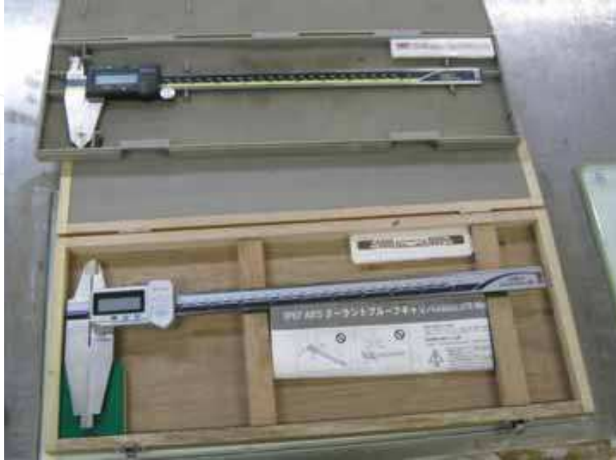
Fig. 4. Displayed the instrument attached UHF RFID tag in the case study (2).

tag suggested to be attached on the non-metal surface (like wooden box) or placed a formcore (about 5 mm) for the interface for decreasing the influence because the RFID tag will be influenced by metal facilities (see Fig. 2-Fig.4).