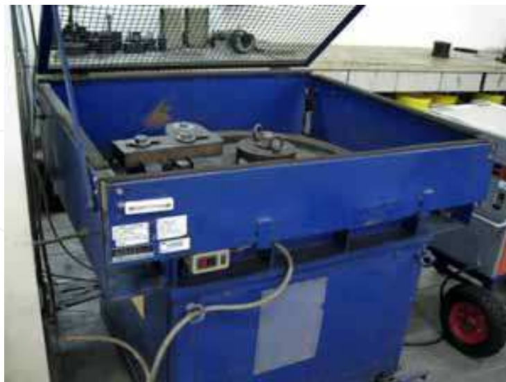
Fig. 3. Displayed the instrument attached UHF RFID tag in the case study (1).

During the setup phase, all the ID of instrument in the RFID tag had been determined and entered the database for system, and then the RFID tag was attached in the instrument. Finally, the tag will be scanned and checked before the maintenance work. Furthermore, the