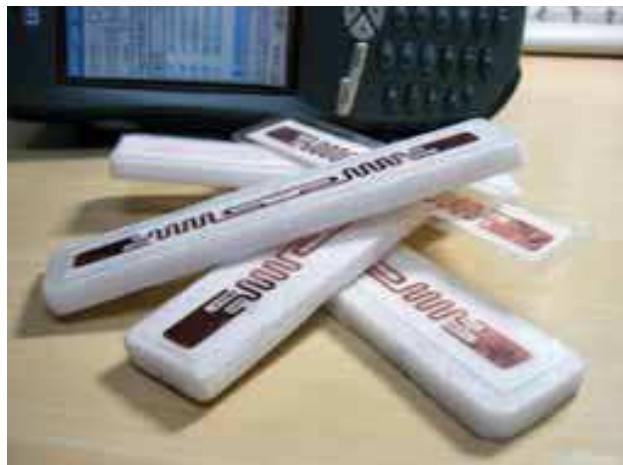
Fig. 2. Displayed the UHF RFID tags using in the case study.

Existing approaches for tracking and managing instruments maintenance adopt manually updated paper-based records. The most of inspection in maintenance work were paper-based work by manual entry although instruments maintenance management system was developed for information management. However, information collected by staff members using such labor-intensive methods is rework and ineffective in the maintenance results entry. Therefore, maintenance management division and maintenance staff members utilized the M-RFIDMM system to enhance instruments inspection and maintenance management in the case study. UHF Passive read/ write RFID tags were used in the case study. After the critical instruments were selected, each UHF RFID tag for the instruments was made, and the unique ID of the instrument was entered into the M-RFIDMM system database. After the instrument was assigned to be monitored for maintenance, the instrument was scanned with a RFID tag to enter the M-RFIDMM system.