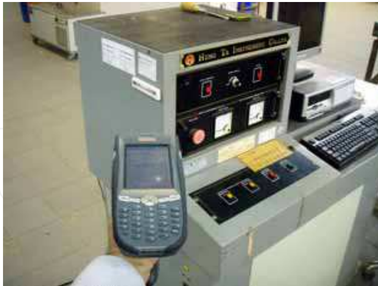
Fig. 6. Displayed maintenance staff member used RFID-enabled PDA to scan RFID tags (2).