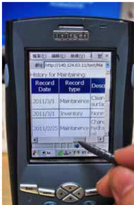
Fig. 7. Displayed maintenance staff member entered the result of inspection, edited the description in the PDA.

Before the inspection/ maintenance work, the instruments staff members can check the instrument list from PDA, refer the relative information and can make the preparation work without printing any paper document. During the inspection/ maintenance progress, the instruments staff member scanned the RFID tag first and to confirm the instrument, then checked the further detail information like maintain procedure, notification, and fittings (see Fig. 5 and 6). The system would support any information of instrument via browser under wireless circumstance. After the instruments were inspected, staff members recorded the