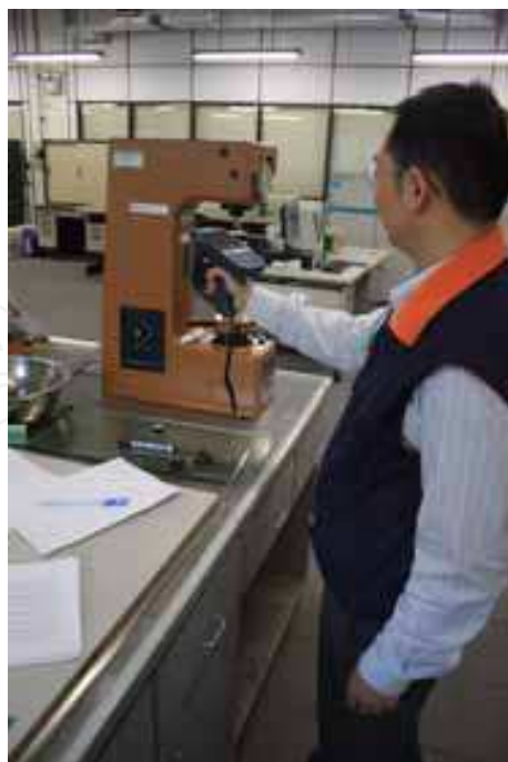
Fig. 5. Displayed maintenance staff member used RFID-enabled PDA to scan RFID tags (1).