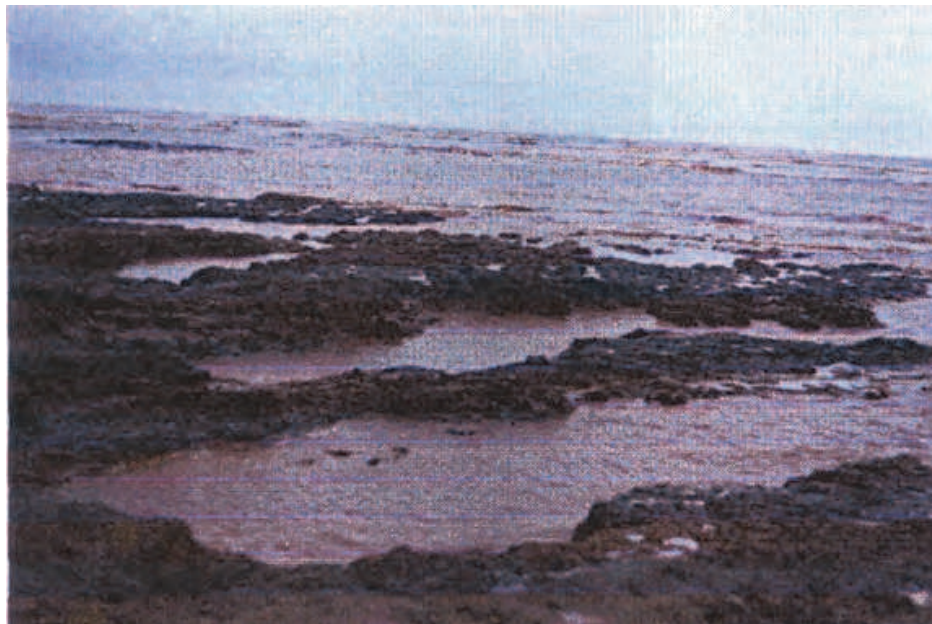
Plate 1. Wave breaking on a muddy coast at Aiyetoro, Nigeria

unstable, the continuous agitation of the surf zone by breaking waves transport mud material cross-shore and equilibrium conditions are hardly attained. Thus muddy coastlines hardly form breaches, which offer natural coastal protection systems. Plate 1 shows the action of breaking waves on a muddy coastline.