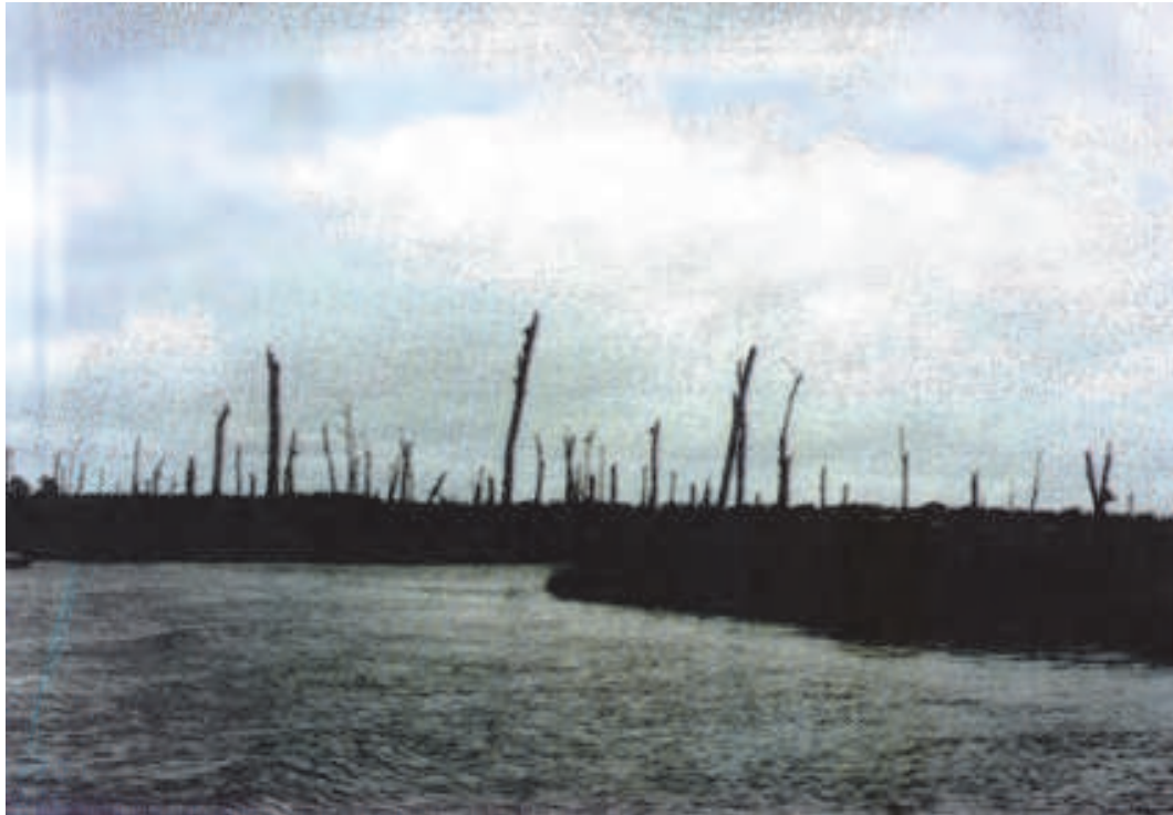
Plate 2. Dead vegetation around Awoye inlets