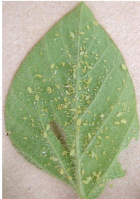
Fig. 1. Soybean aphid infestation on soybean

To fully understand the threat to host-plant resistance, research must focus not only on developing new varieties of soybean-aphid resistant soybean, but also on the genetic, genomic and evolutionary factors involved in adaptation and spread of soybean aphid biotypes. This chapter will review the current status of soybean aphid biotypes, highlight functional and population genetic and genomic studies that may provide clues to uncovering the basis for soybean aphid biotype adaptation, and outline future studies that will be necessary if resistant soybean varieties are to be used and preserved as a soybean aphid management strategy.