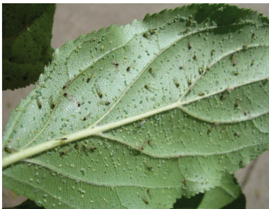
Fig. 2. Soybean aphids on buckthorn ( R. cathartica ). Note the presence of winged forms (most likely males (androparae) and females (gynoparae) and wingless females (oviparae). Picture taken on October 6, 2006 in Toledo, OH, USA.

The life cycle of the soybean aphid in North America is similar to what is known from its native range (Wang et al. 1994). It is a typical heteroecious, holocyclic species, alternating among sexual reproduction on primary hosts and asexual reproduction on secondary hosts (Ragsdale et al. 2004). The primary hosts are various buckthorn trees ( Rhamnus spp., Voegtlin et al. 2005; Yoo et al. 2005). Buckthorn is a widely distributed herbaceous shrub in the flowering plant family Rosales. This shrub is commonly used for horticultural and landscaping, especially along hedges and fence rows. These characteristics led to the introduction of buckthorn into North America from Europe by the early 19 th century. It quickly became invasive and led to an invasion meltdown involving 10 other Eurasian plant, animal and pathogen species (Hiempel et al. 2010). In North America, overwintering of the soybean aphid mainly occurs on Rhamnus cathartica (common buckthorn, Figure 3), but can also occur on R. alnifolia (alderleaf buckthorn), R. lanceolata (lanceleaf buckthorn) and F. alnus (glossy buckthorn) (Voegtlin et al. 2005; Yoo et al. 2005; Hill et al. 2010). Across its native Asian range, R. davurica and R. japonica are the main hosts (Yoo et al. 2005).