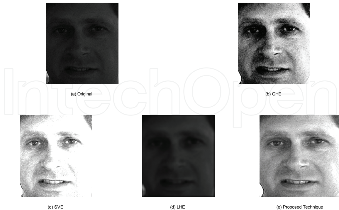
Fig. 4. (a) Low contrast image, Equalized image using: (b) GHE, (c) SVE, (d) LHE, and (e) the proposed technique.