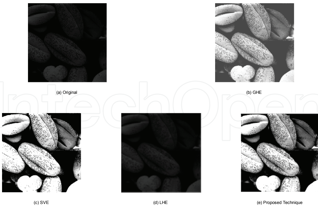
Fig. 3. (a) Low contrast image, Equalized image using: (b) GHE, (c) SVE, (d) LHE, and (e) the proposed technique.