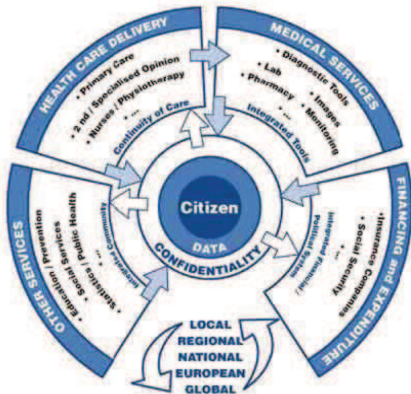
Fig. 2. The Vision For a Citizen-centered health care. Reproduced from: Telemedicine 2010: Visions for A Personal Medical Network-The Telemedicine Alliance-July 2004