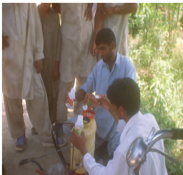
Fig. 4. Improper handling of pesticides