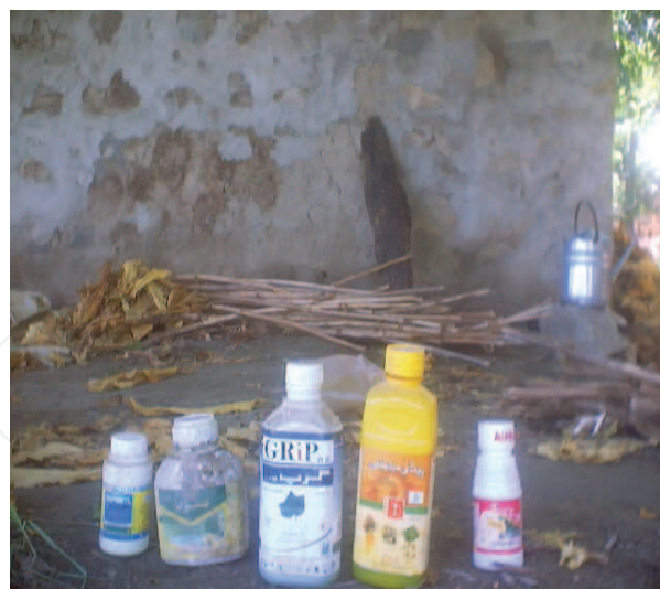
Fig. 5. Poor house keeping of pesticides