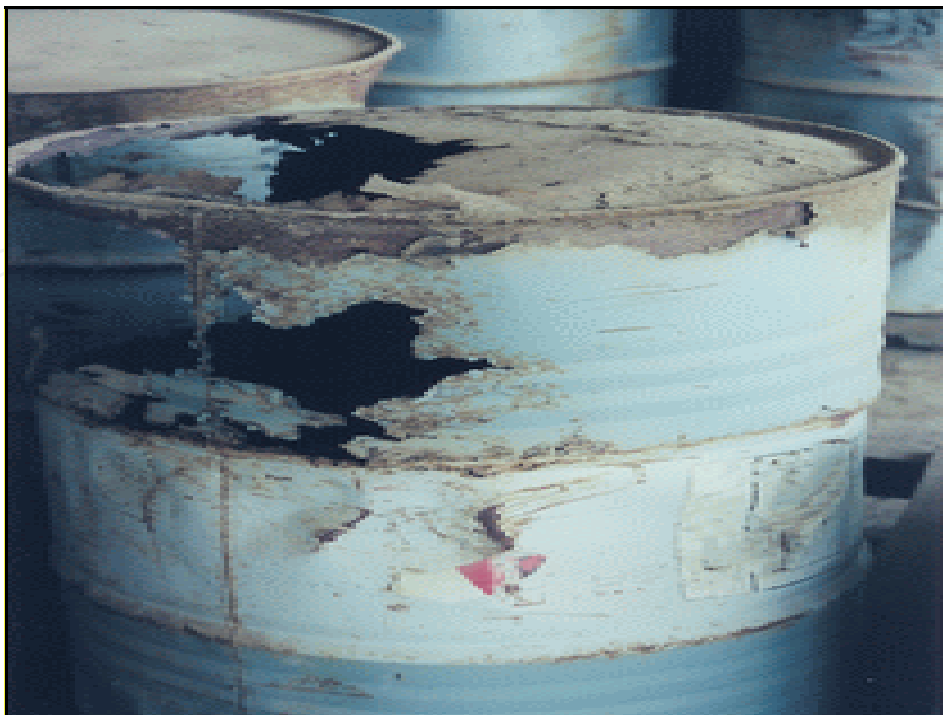
Fig. 2. Corroded pesticide container