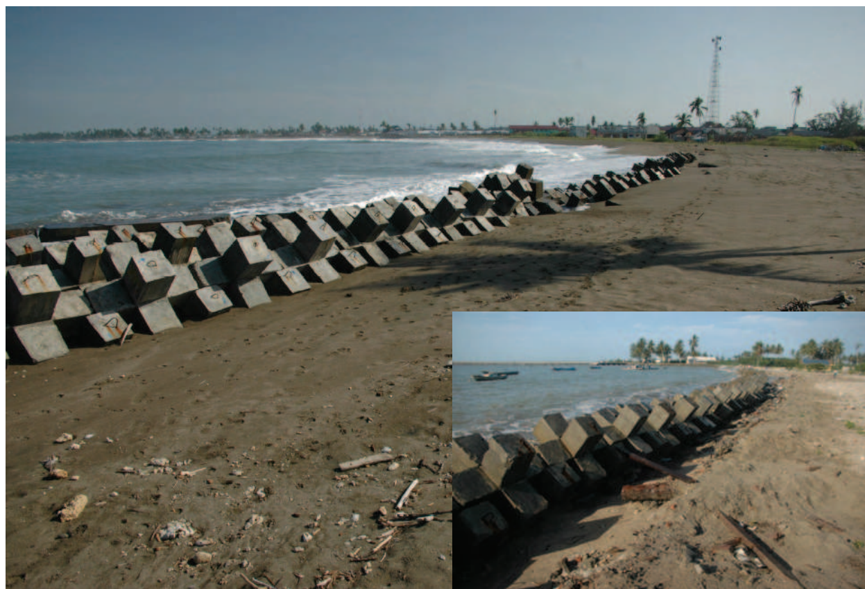
Fig. 8. Protective concrete structures set in place along (a) northern and (b) southern coasts of the Peninsula of Meulaboh. Note that only the southern coasts were actually eroding; along the northern coasts the beaches were accreting.

however, most likely a complete failure, i.e. a foregone investment which may amount to over 2 million US$ for just this project. There were many other projects in Aceh and elsewhere, in total probably amounting to several million US$, that were invested in a very short time period – too often in the wrong locations and typically in want of a longer-term strategy. Even more disconcerting than the careless use of aid money may eventually be the bitter realization that these projects have actually served as a vehicle to educate local people that mangrove planting and management is essentially a nonsensical activity. If the big aid agencies (employing entire village communities) could not do it, how then should the “locals” be able to do it?