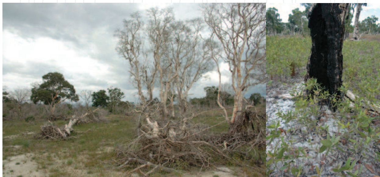
Fig. 7. (a) Tsunami-affected Melaleuca savanna on Koh Phra Tong, Thai Andaman coastline. Most of the trees were killed by salinity. No seedling regeneration was evident in the grassland affected by tsunami salinity and sediments, but (b) vigorous seedling recruitment was observed in a pristine savanna that had evidently been affected by fire a few weeks earlier. Pictures: R. Cochard, July 2006.

In a Melaleuca savanna on Koh Phra Tong no regeneration was obvious after the tsunami (Fig. 7a), as seedlings of Melaleuca and other tree species were observed almost exclusively in non-affected areas. Prolific seedling recruitment was in particular observed in a recently burned area unaffected by the tsunami (Fig. 7b). It is possible that Melaleuca seedling establishment was not only facilitated but also triggered by savanna fires. In contrast to statements by IUCN (2006) whereby fires should be prevented, fires could actually represent an intrinsic ecological process in this vegetation type (cf. also Stott 1990, Finlayson 2005) and may potentially serve as a savanna regeneration process following the tsunami.