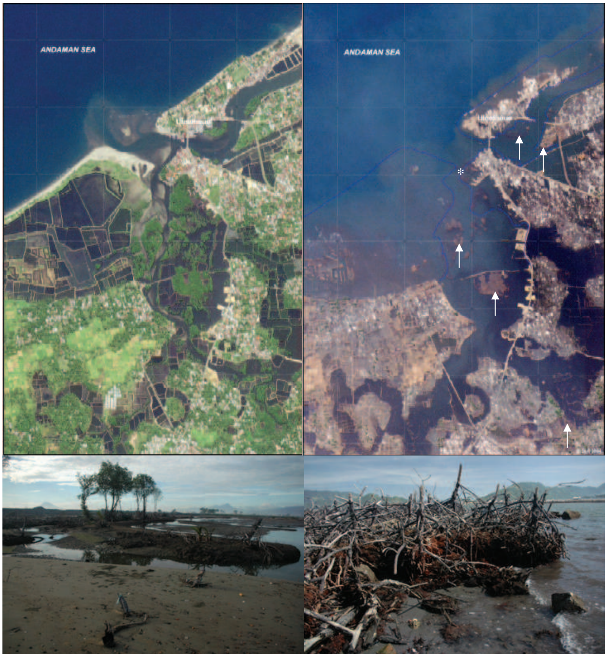
Fig. 3. Part of the northwestern shoreline near Banda Aceh at the port of Uleelheue before and after the 2004 tsunami. (a) IKONOS satellite image taken on 10 January 2003, showing settlements, the extensive tambak fish ponds in the surrounding former swamp area and some remaining mangrove stands in the river estuary and along the rims of tambak ponds (b) IKONOS satellite image taken three days after the tsunami on 29 December 2004. A part of Uleelheue Island, the sand beach to the West as well as most of the tambak areas have been completely scoured by the tsunami waves and form now part of the open sea. As can be seen, intertidal flats still persist in some of the larger former areas of mangroves (arrows). (c) A few surviving larger Rhizophora stylosa trees along the rims of former tambak ponds, close to the sea front near the mouth of Aceh River, North of Banda Aceh. (d) Destroyed