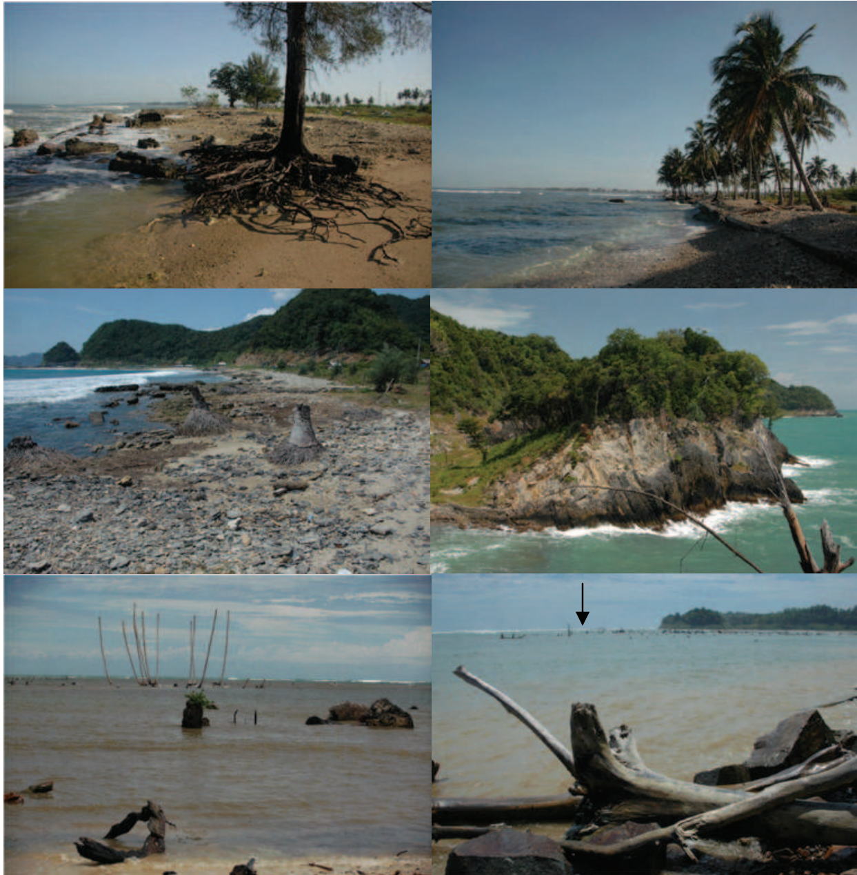
Fig. 2. (a) A Casuarina tree and (b) coconut palms that are (still) surviving near the tip of the Meulaboh peninsula. Virtually all the houses of the town that was densely built behind these trees were completely levelled by the tsunami. Post-disaster reconstruction has been prohibited at this very exposed site. (c, d) Sand beach erosion and hillside vegetation removal by the tsunami (Ujung Labuhan, South of Lhok Nga), exposing the bare rock surface along the new shoreline and as a trim line along the cliffs. (e) Land subsidence and beach erosion (along the coastline between Lho Kruet and Calang) as evidenced by the submersed and killed coconut palms and (f) former mangrove stands (see line at horizon, arrow), now exposed to open water wave action and erosion. Pictures: R.Cochard, July 2006.