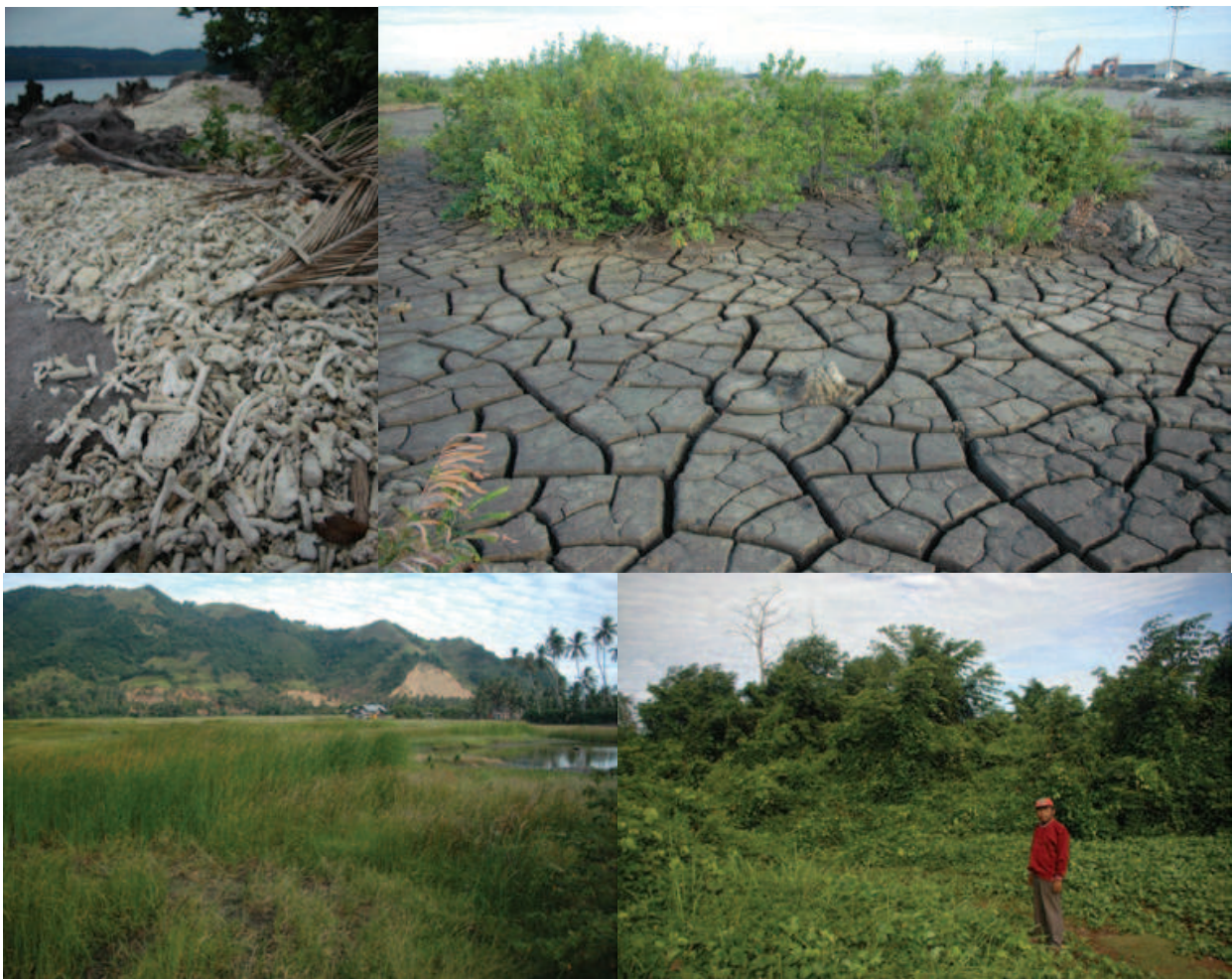
Fig. 6. (a) Coral fragment tsunami deposits on a rock coast on Weh Island North of Banda Aceh. (b) Tsunami mud deposits about 1 km from the coast North of Banda Aceh. Note the crab burrows, possibly indicating land subsidence. (c) Former paddy fields near Lamblang, West of Banda Aceh. In July 2006 these fields were swamps dominated by Typha angustifolia and sedges. (d) Post-tsunami forest regrowth that is mainly dominated by leguminous tree species. July 2006.

Another factor which may initially have been causing secondary dieback of mangrove stands may have been excessive sedimentary deposition by the tsunami (Fig. 6b). According to Ellison et al. (1998) natural sedimentation rates of mangroves are in a range normally lower than 0.5 \text{ cm y}^{-1} , with a maximum of about 1 \text{ cm y}^{-1} , whereby Rhizophora spp. with stilt roots appear to be slightly less sensitive than species with pneumatophores, such as Avicennia and Sonneratia spp. Tree death is also more likely to occur if roots are being smothered by fine sediments, probably because aeration is lower than in rough sediments