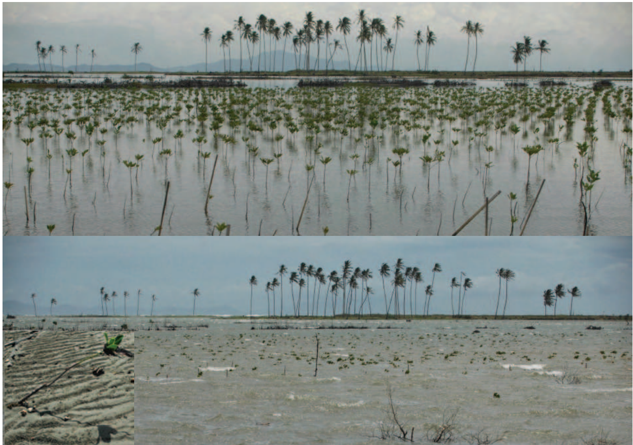
Fig. 4. Newly planted mangrove saplings west of Banda Aceh (a) during low tide and no wind, and (b) during high tide and exposed to wind-driven waves. (c) A surviving sapling after such exposure; it can also be seen that there is a layer of rippled sand deposits. Pictures: R.Cochard, July 2006.

mangrove mudflats to the physical wave impact of the open seas. As no tree recruitment appears to be occurring and replanting is not successful, the tidal flats are now slowly eroding in the widened bay (Fig. 3d). Also, most mangroves which still had been fringing former tambak ponds have been leveled by the tsunami with the effect that high winds are now freely blowing over the open tambak areas and mudflats. Quite significant waves are thereby produced even within relatively small tambak ponds. These waves probably have a significant impact on unprotected, replanted seedlings (Fig. 4a,b). Unless certain conditions change (e.g. new deposition of sand spits, establishment of wind and wave shields by pioneer plants), there is therefore little prospect of mangrove plantations to be successful in those areas.