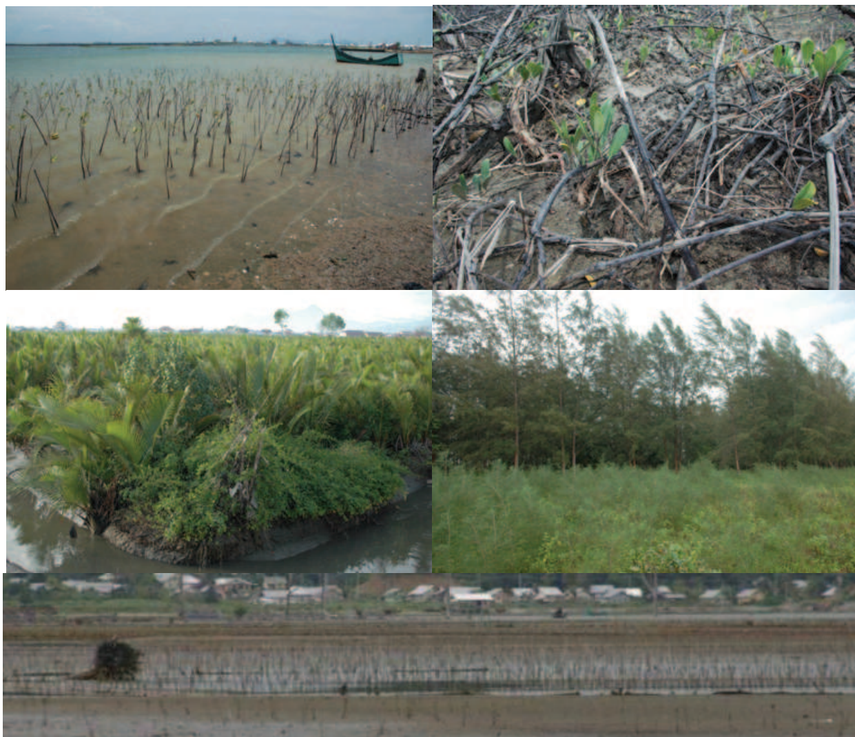
Fig. 1. (a) Root resprouting in a broken Rhizophora apiculata stand at Thale Nok, Thai Andaman coastline. (b) Rhizophora seedlings planted along the rims of rehabilitated tambak ponds close to Banda Aceh. Most of the seedlings were already dead. No successful seedling establishment was seen around Banda Aceh in July 2006 except for (c) vigorous growth (~ 3 m in height) of mangrove palms, Nypa fruticans , in an area close to the mouth of the Aceh River. (d) In areas where beaches were not completely eroded, natural and aided regrowth of Casuarina trees was successful in Aceh as well as in Thailand. Here a regenerating stand on Ko Kho Khao, Thai Andaman coastline. Pictures: R.Cochard, July 2006. (e) Dead Rhizophora seedlings on a mudflat close to Banda Aceh in January 2008 (picture source: Dr. B. McAdoo).

further extended to aspects of risk robustness and resilience. Attention is drawn to several issues of importance in regard to the development needs of greenbelt restoration schemes. Information is drawn from scientific literature, reports of international organizations and NGO's, and some own experience in the field. Visits to the tsunami-affected coastlines of Aceh Province in Indonesia were conducted between 23 July and 2 August 2006 (Banda Aceh to Meulaboh, including Pulau Weh) and to the Andaman Sea of Thailand between 23 and 26 March 2006 (Thai coastline, Phuket to Ranong). Many of my personal observations, particularly regarding the impacts of the tsunami on coastal vegetation, form thereby one pillar of this article.