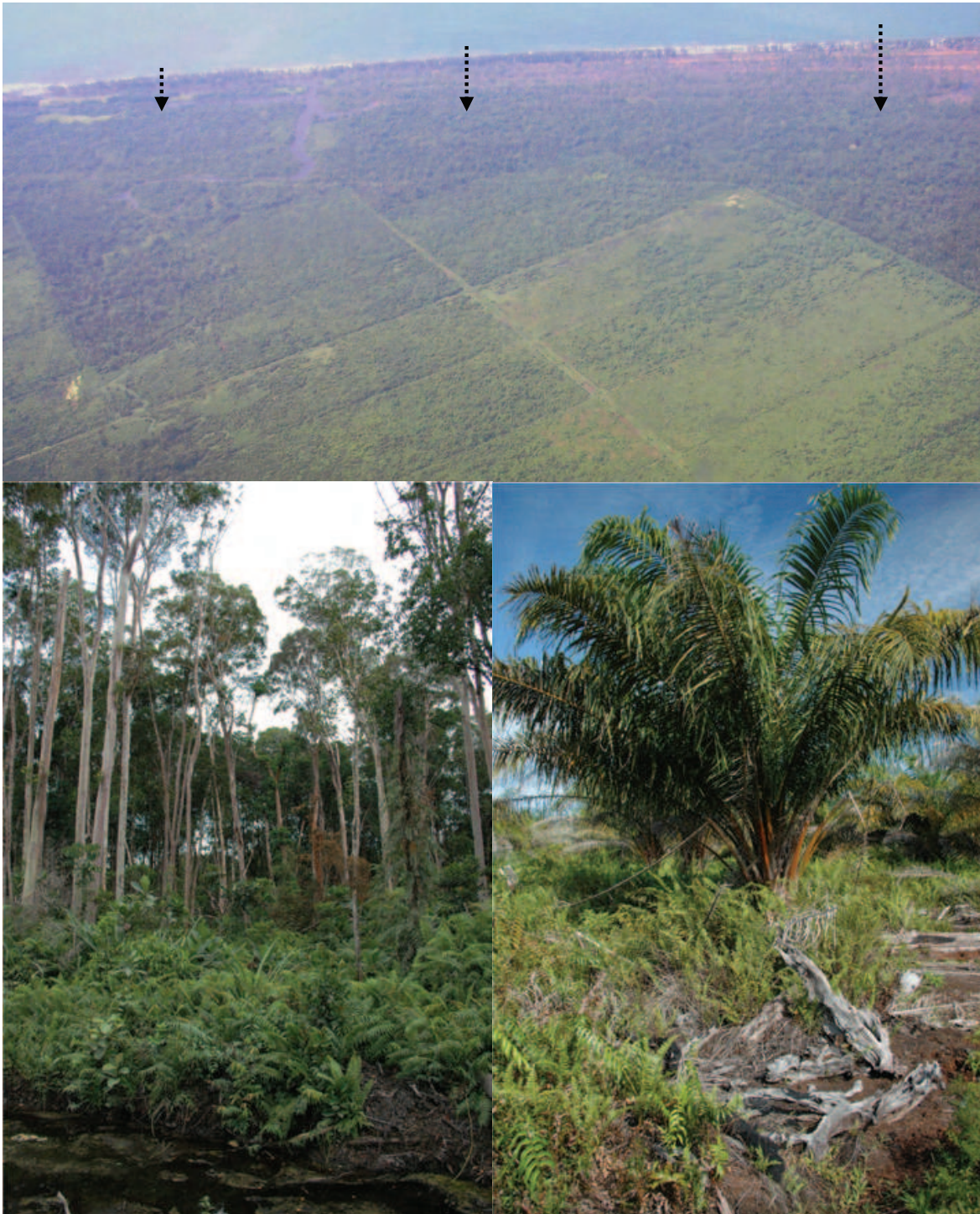
Fig. 5. (a) Aerial picture near the Tripa estuary South of Meulaboh, West Aceh coastline, showing the tsunami-buffering by a strip of remaining peat swamp forest. The picture also shows some of the extent of forest destruction by oil palm companies. In this area more forest was cleared than could actually be planted with oil palms and/or the soil conditions were found to be unsuitable. Secondary forest regeneration is clearly visible within the cleared areas. (b) An intact stand of peat swamp forest along the coastal road North of Meulaboh. (c) Peat swamp forest converted to oil palm plantations in the Tripa region. Aerial picture source: Dr. I. Singleton; other pictures: R. Cochard, July 2006.