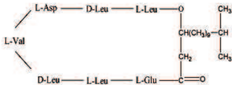
Fig. 1. Primary structure of surfactin

The molecular assembly of surfactin in an aqueous solution and the conformation of the molecules in aggregates condition its physicochemical activities and biological properties. Surfactin adopts a \beta -turn, forming a \beta -sheet with a characteristic horse-saddle conformation, which is probably responsible for its broad spectrum of biological activities, even at such low concentrations. The \beta -turn may be formed by an intramolecular hydrogen bond, whereas the \beta -sheet may depend on an intermolecular hydrogen bond (Bonmatin et al., 1994; Han et al., 2008; Zou et al., 2010). The two charged side-chains are gathered on the same side and form a "claw", providing a polar head opposite to the hydrophobic domain (Tsan et al., 2007).