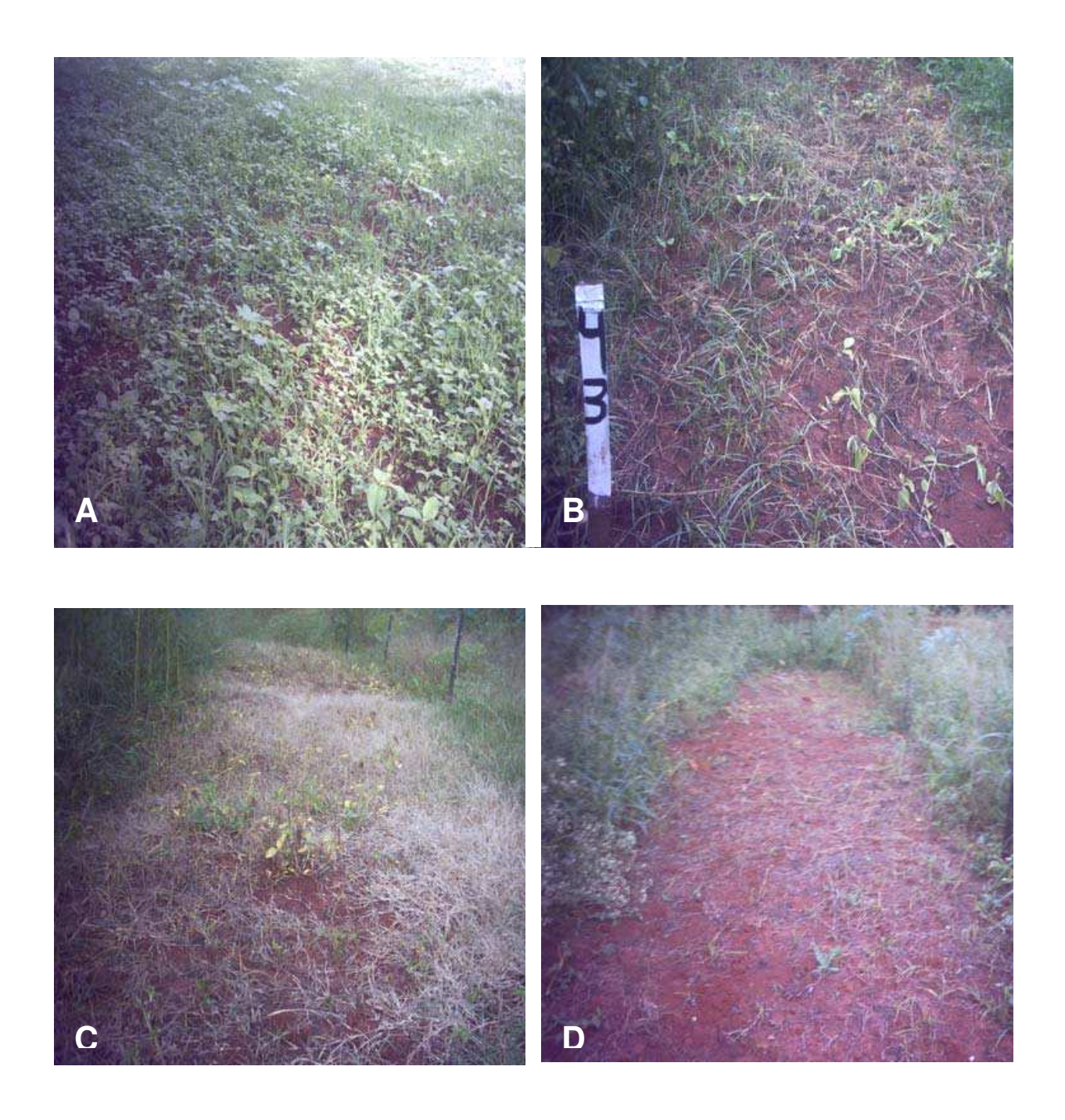
Fig 1. A) Weed community before the application of treatments; B) lack of control of Cyperus sp. and Commelina benghalensis (1.50 + 43.75, 1.00 + 62.50, 1.50 + 18.75, 1.00 + 37.5, 1.00 + 12.5 L ha<sup>-1</sup> glyphosate and fusel oil, respectively); C) Commelina benghalensis with yellow leaves and D) total control of weeds (1.50 + 43.75, 1.00 + 62.50, 1.50 + 18.75, 1.00 + 37.5, 1.00 + 12.5 L ha<sup>-1</sup> glyphosate and fusel oil, respectively). Ribeirão Preto, Brazil, (Azania, 2007).