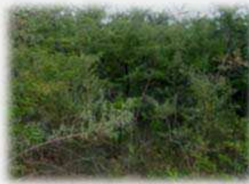
High density : > 1000 stands/ha