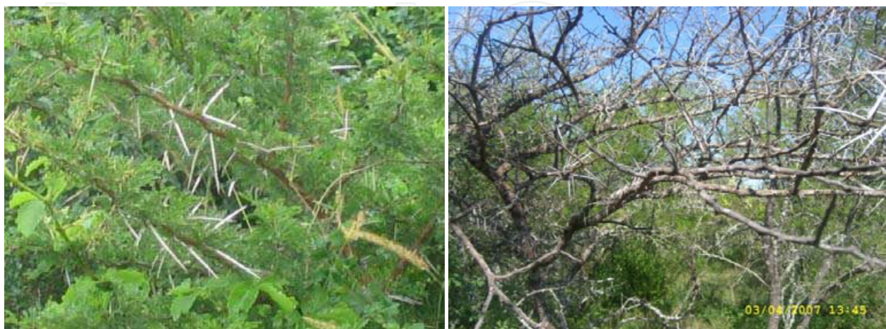
Fig. 3. Effect of bromacil application on Acacia Karoo over time