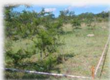
Low density : < 500 stands/ha