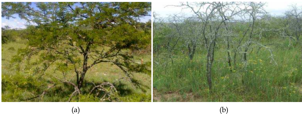
Fig. 2. (a). Stand of Acacia karoo (b). Dead stands of Acacia karoo form plots treated with Bromacil