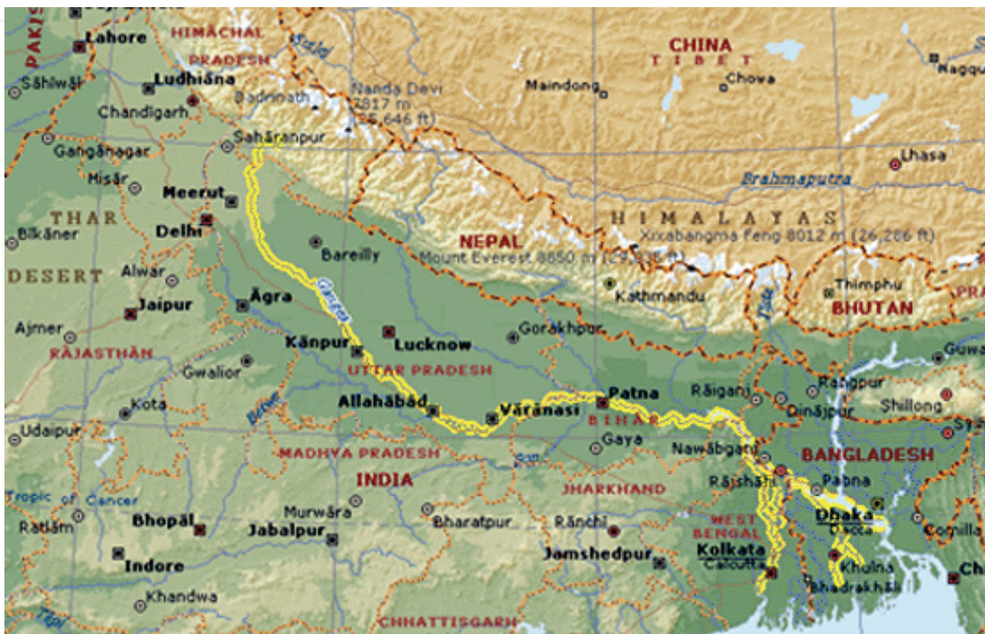
Fig. 1. Course of the River Ganga showing different stretches ( http://www.gits4u.com/water/ganga1.gif )

Labeo rohita and Cirrhinus mrigala and their spawning occurs during the monsoon (June-July) and extend till September. In recent years the phenomenon of IMC maturing and spawning as early as March is observed, making it possible to breed them twice a year. Thus, there is an extended breeding activity as compared to a couple of decades ago (Dey et al., 2007), which appears to be a positive impact of the climate change regime.