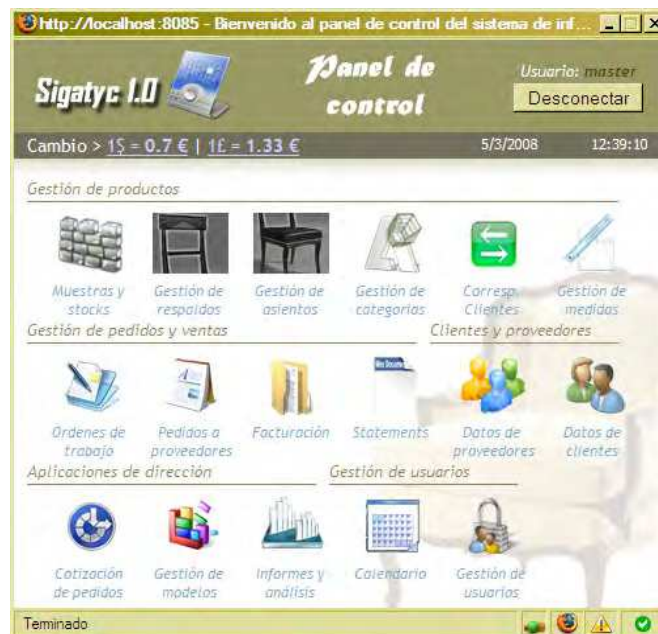
Fig. 1. Control Panel where each icon represents an application

After the authentication process, SIGATYC begins with what the student called " Control Panel ", from which the end-users can choose a specific application.