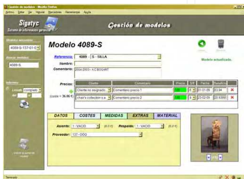
Fig. 2. Model management application with an image gallery web widget

Although the applications are grouped in five different groups, the access rights are granted by application, not by group. In this way, the end-users have a better delimited set of applications they can use.